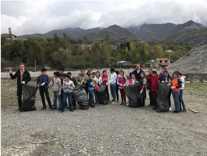
Schoolchildren cleaning up the village from waste

Lakes, mountains and clean air are associated with Switzerland's quality of life. As beautiful nature is an integral part of Switzerland's identity, the government actively promotes the protection of the environmental heritage throughout of the globe.