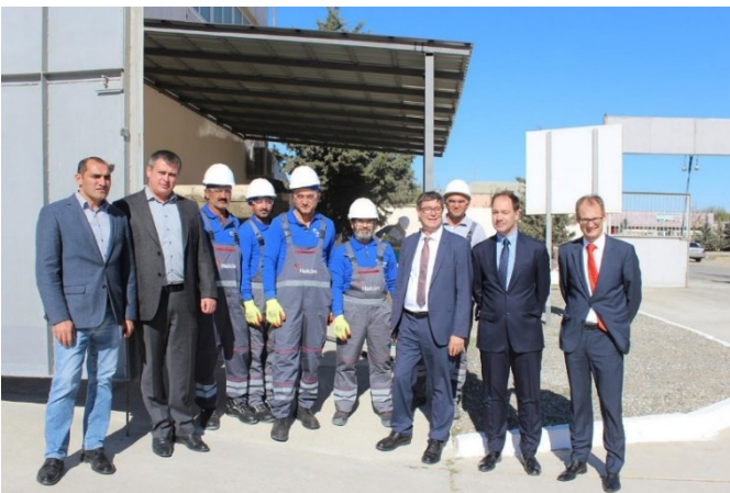
Swiss Secretary of State with the group of masters at Holcim Academy