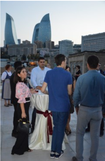
Young alumnis enjoy wonderful view from the terrace of the residence

The Embassy gathered Azerbaijani students and graduates from the Swiss universities and schools at a reception given at the Swiss Residence. This year's Alumni Networking Event took place on 7 September and dozens of young people enjoyed their attendance at the roof terrace in beautiful Icheri Sheher. For the first time, the CEO's of Swiss companies operating in Azerbaijan were also invited. This created an opportunity for students to expand their networking and even seek for job opportunities.