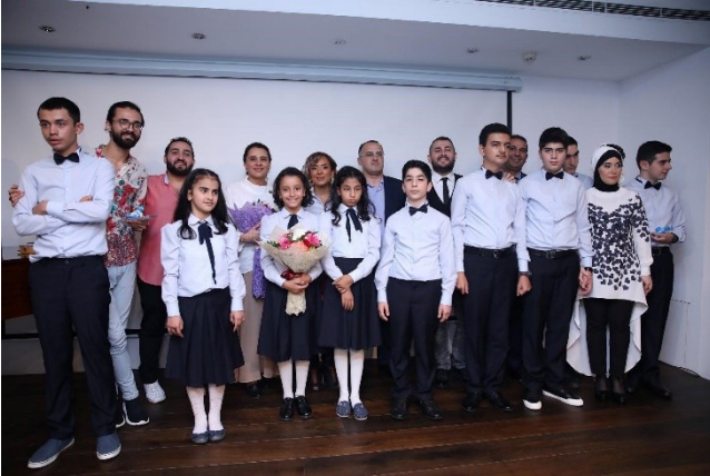
Chorus concert of talented children

Another performance of an arts & culture project supported by Switzerland was held in Baku, Sumqayit and Quba in October.