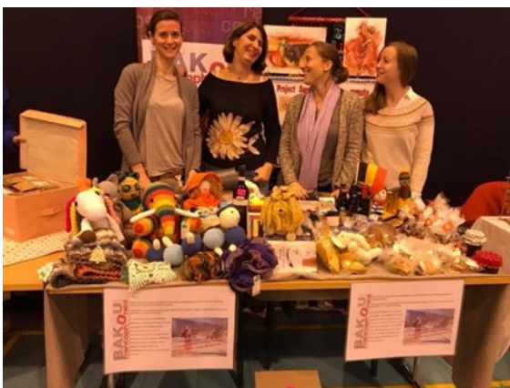
Booth of Bakou Francophones at TISA

The annual winter fair was organized at the International School of Azerbaijan (TISA) on 1 December. The Swiss Embassy participated at it in the frame of the organization Bakou Francophones together with other Embassies from French speaking countries (Belgium and Romania). Money from the sale of items were given to the Camping Azerbaijan and the NGO will buy toys for children living in remote mountainous villages. The project called “ Santa Claus in remote villages ”, will start from 22 December and continues until 1 January 2019.