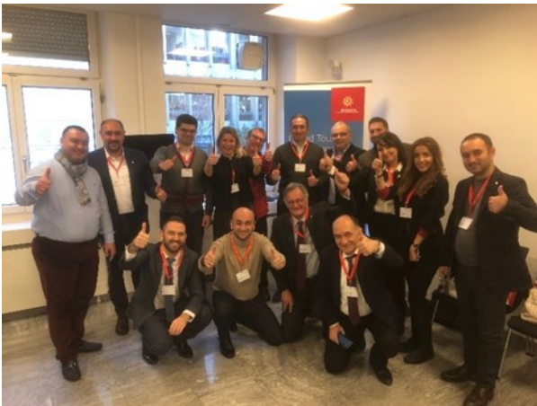
Azerbaijani travel agency representatives say the mission was successful

On invitation of Switzerland Tourism, a group of ten representatives of Azerbaijan's travel agencies visited Switzerland at the end of November 2018. The aim of the visit was to promote the direct flight recently introduced between Baku and Geneva and to provide first-hand information about Switzerland as a touristic destination. Ultimately, the visit should contribute to increase the number of tourists in both directions.