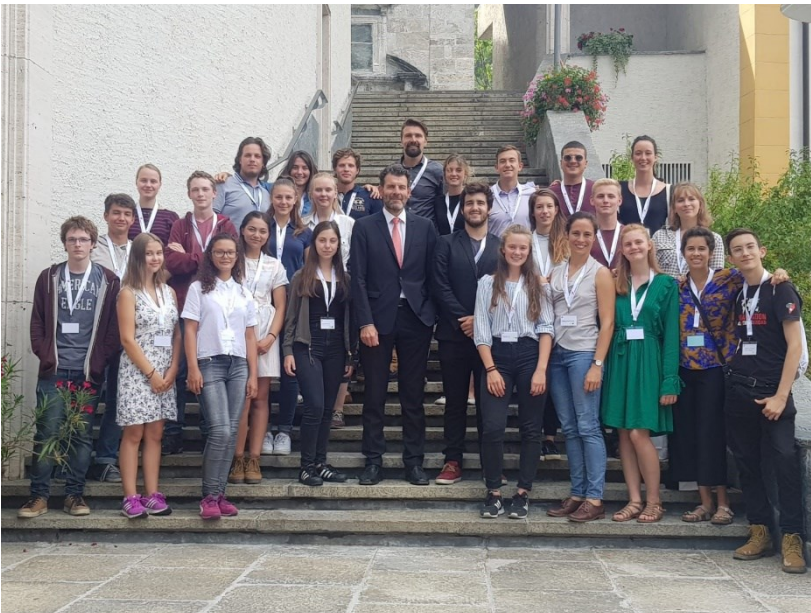
The State Secretary Roberto Balzaretto with the group of youth

Once a year during summer, the Organisation of the Swiss Abroad (OSA) holds a congress for Swiss citizen living all around the world. This event has become very popular among the members of the "Fifth Switzerland". The subjects are picked to match the interests of Swiss people living abroad.