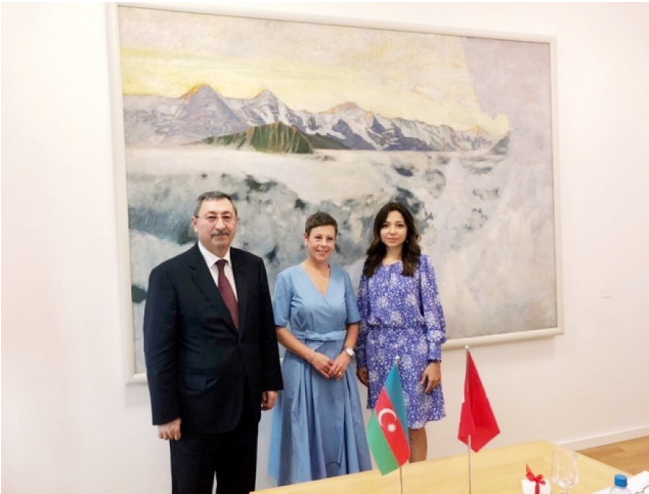
Deputy Secretary of State Krystyna Marti (middle) welcomes Deputy Foreign Minister Khalafov and Azerbaijani Ambassador to Bern, Hanum Ibrahimova

The political consultations between Switzerland and Azerbaijan took place in Bern on 21 September 2018. Swiss Deputy Secretary of State, Krystyna Marty Lang , met with her counterpart, Deputy Foreign Minister Khalaf Khalafov , to discuss a wide range of bilateral issues. Both sides emphasized the positive dynamic of relations and highly appreciated the outcome of the meeting. The settlement process of the Nagorno-Karabakh conflict, the economic cooperation as well as topics related to the educational sphere were equally discussed.