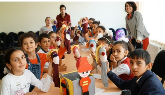
Children proudly show their handmade puppets

Living near the frontline of an unsettled territorial conflict must be an extremely difficult experience for civilians on both sides of the border in most case. This is even truer for children fighting with symptoms of stress and psychological trauma caused by regular exchanges of fire.