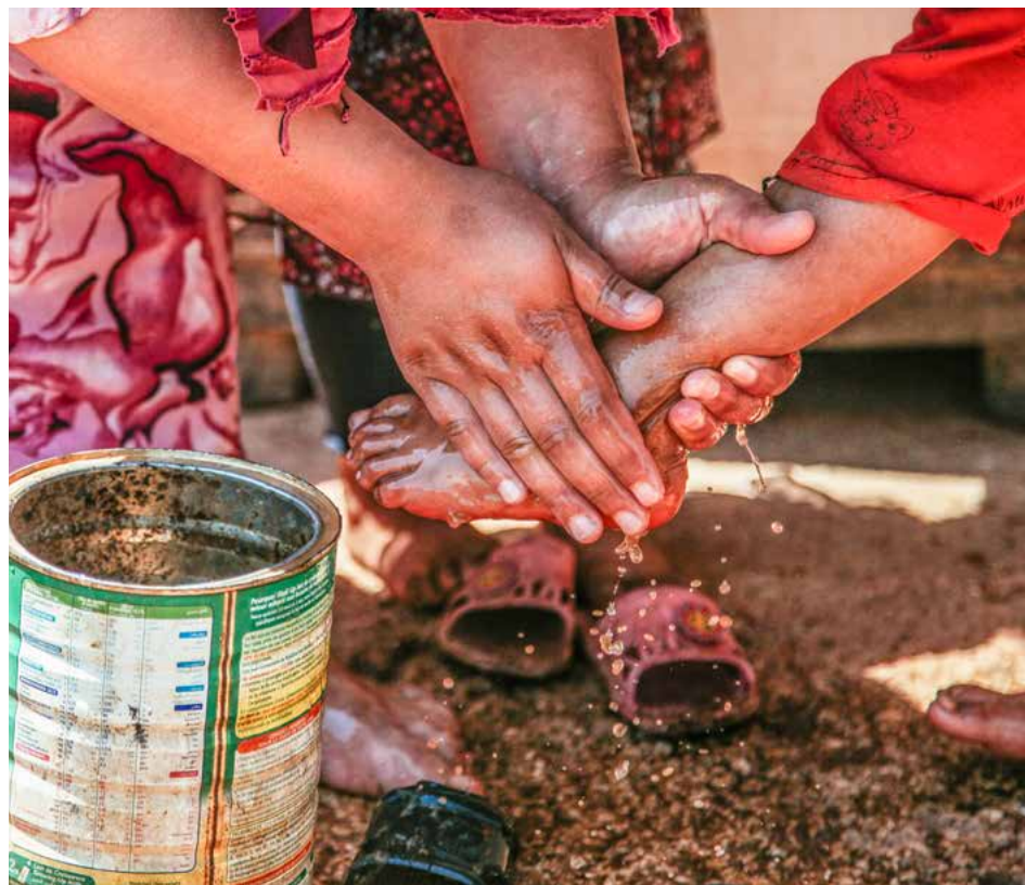
A Syrian mother washing her child's feet (cash for hosting project supported by SDC), Akroum village, Lebanon.

The intervention modalities of the SCP entail contributions to multilateral partners for humanitarian, protection, and resilience focused assistance. The dialogue with multilateral partners will be intensified and better structured based on well-defined criteria in order to provide support more strategically and based on needs. Switzerland will observe and support the UN reform processes. UNRWA will continue to be the main regional institutional partner for Switzerland's support for Palestine refugees. While the lead in relation to and financing for UNRWA is mainly channelled through the Swiss Cooperation Office in Jerusalem, the SCP will contribute to the institutional development and dialogue through Embassies in Amman, Beirut, and Damascus as well as the Humanitarian Office in Syria.