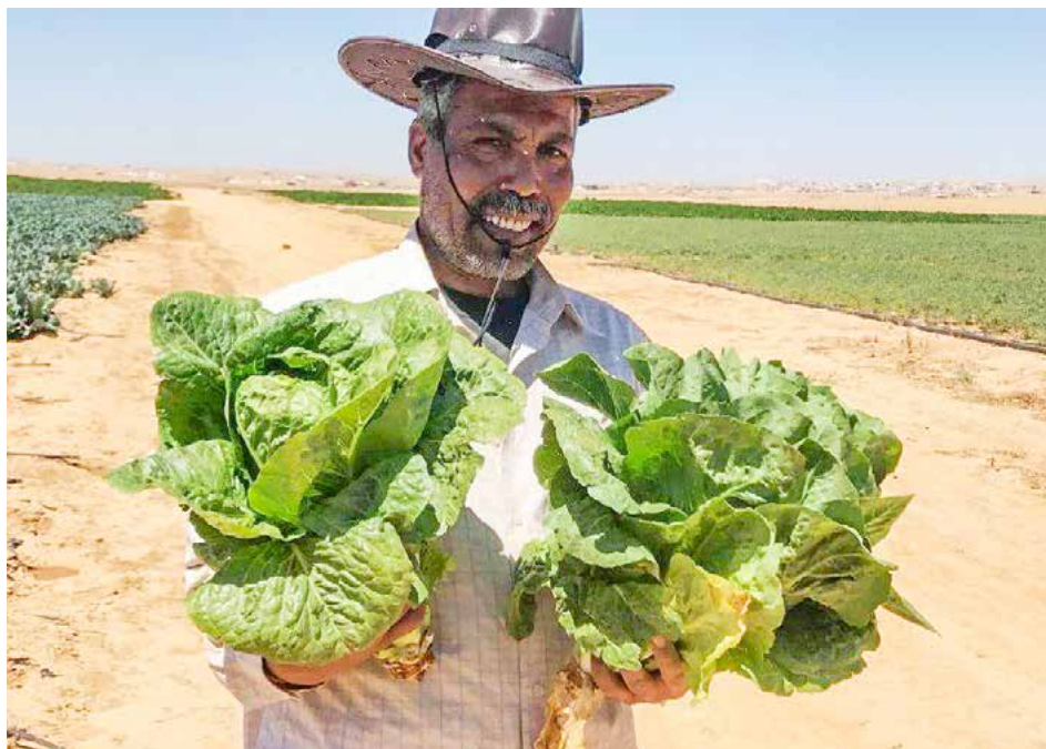
FAO project at A- Ghadeer Al Abyad Dam project site in Al Mafraq, Jordan, supported by SDC.

The SCP has been jointly developed by concerned institutions.