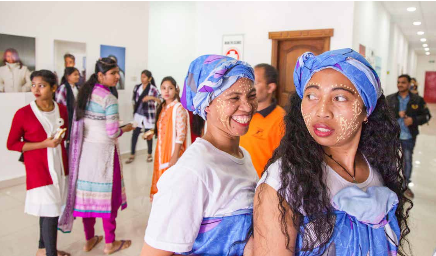
Worker's Center supported by Switzerland's Global Programme for Migration and Development, Al Hassan Industrial Zone, Irbid, Jordan.