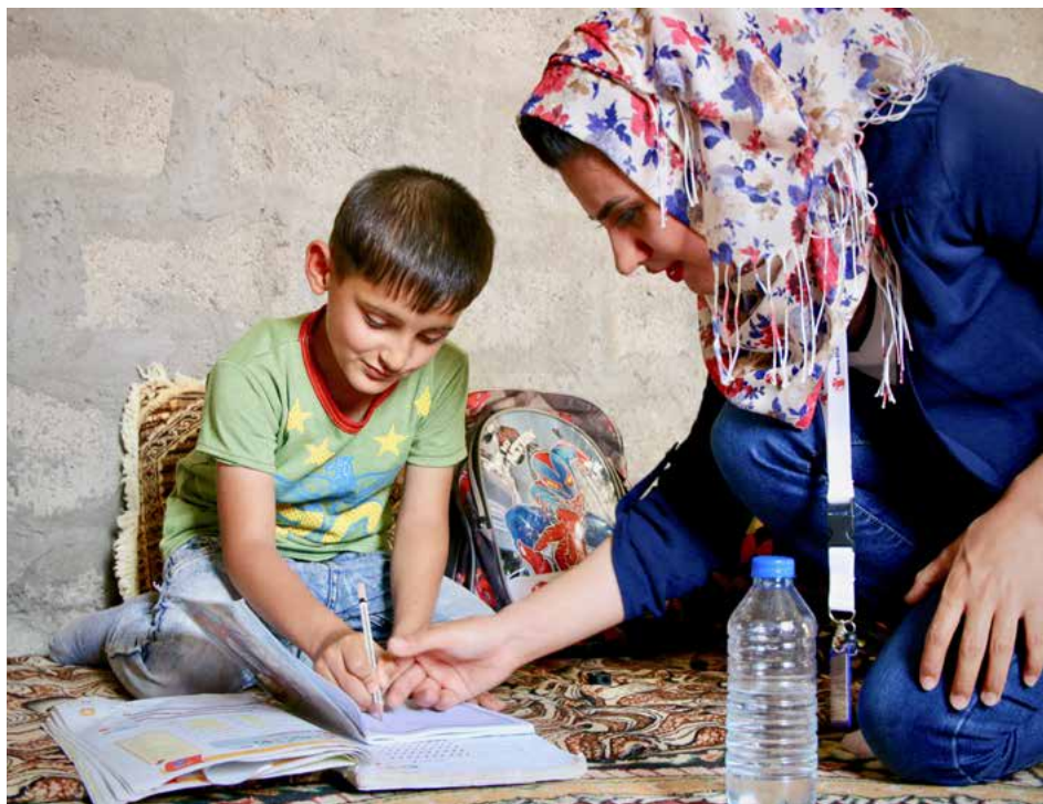
Save the Children protection and education project in Dyala, Iraq supported by SDC.

Iraq: As of 2018, 250,000 Syrian refugees, a vast majority of whom are of Kurdish ethnicity, are registered mostly in the Kurdistan Region of Iraq (KRI).