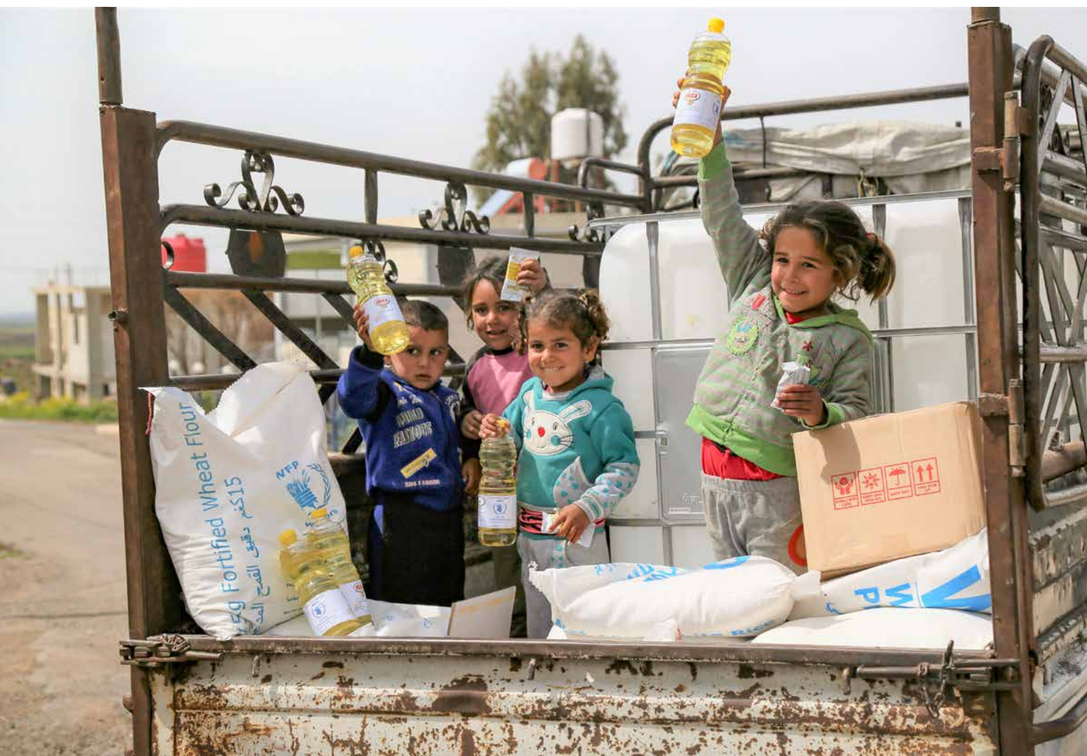
World Food Programme food-kit distribution to support pregnant and lactating women supported by SDC, Homs, Syria.