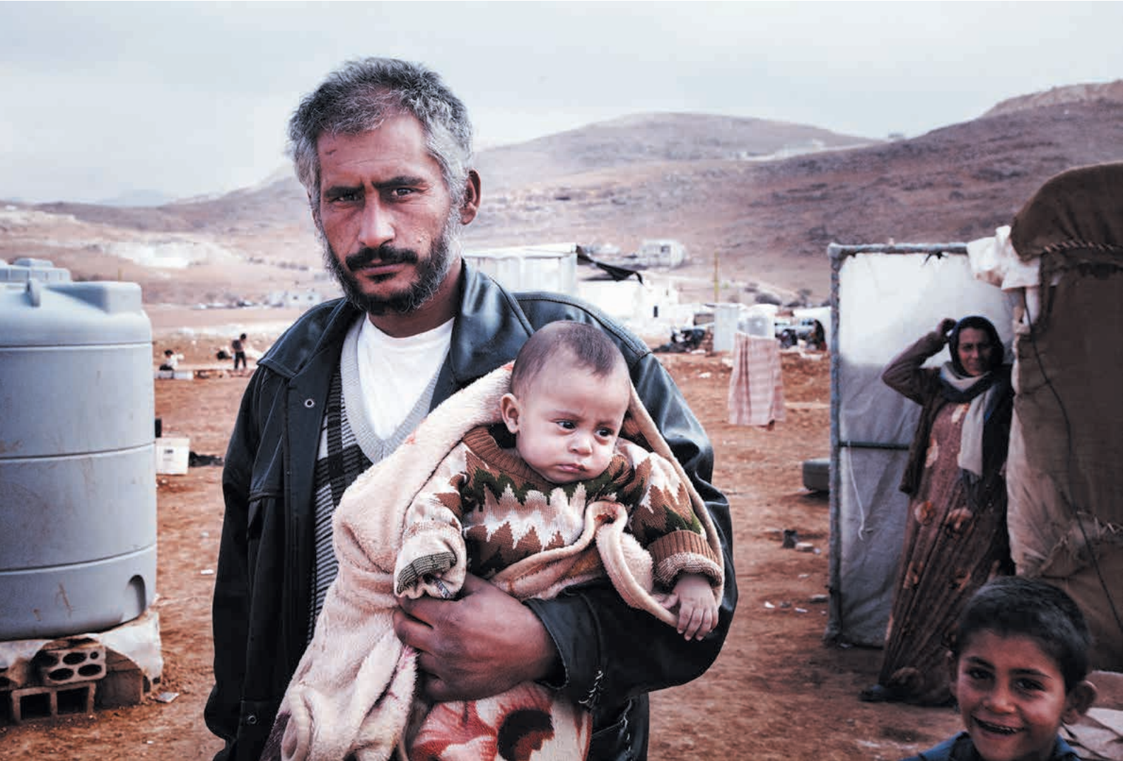
© Leila Alaoui / DRC 2013