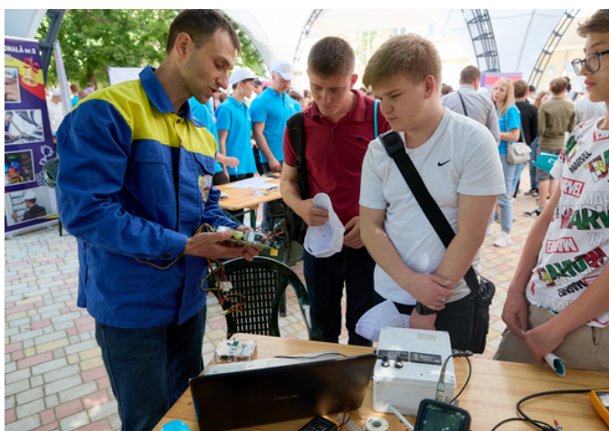
Young people learn about the advantages of professional studies that include apprenticeship. Dual Vocational Education and Training Day in Comrat, 2023

The recent multiple crises magnified the economic vulnerability of Moldova, affecting adversely, among others, its capacity to attract investments. Therefore, building economic resilience and sustaining recovery have become important elements of the EDE domain interventions. Responding to the COVID-19 pandemic, the Swiss EDE interventions shifted their focus from stimulating the creation of new jobs to assisting companies in finding solutions to maintain their businesses and keep their existing employees. Additional adjustments have been introduced to strengthen the economic resilience of small and medium enterprises (SMEs) and small farmers in the face of energy, climatic and economic shocks, as well as to facilitate the transfer of knowledge and expertise of Moldovan emigrants. Furthermore, the scope of the EDE portfolio has been extended to include the promotion of a green economy approach and the economic inclusion of vulnerable groups, including refugees. The Swiss interventions now capitalize, as well, on the new opportunities linked to the EU-candidacy status granted to Moldova in 2022. By promoting the competitiveness of Moldovan products on the European markets, Switzerland makes its contribution towards fostering a tighter integration of Moldova's economy into the European common market and value chains.