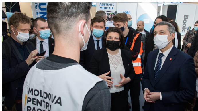
The President of Switzerland, Ignazio Cassis and the Prime-Minister of Moldova, Natalia Gavrilita during a visit to the temporary refugee shelter at Moldexpo in 2022

Under the new circumstances, Switzerland committed to adopting and promoting the 'triple nexus' approach, ensuring strong interlinkages and complementarity between development, humanitarian and peace building interventions. The adjustment of the Swiss Cooperation Program for Moldova to the new context has resulted in revised priorities, approaches and expected results; correspondingly, resources have been redirected and additional funds allocated. In order to support the Moldovan Government's efforts to respond appropriately to humanitarian needs and, at the same time, to achieve the country's development objectives, social cohesion and sustainable peace, the Swiss Cooperation Program is using, now more than before, a variety of approaches.