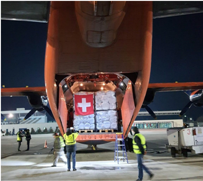
A Swiss aircraft shipped a 20-ton batch of humanitarian aid to help Moldova manage the refugee crisis in March 2022

Moreover, Switzerland provided the following direct financial contributions to Moldova: