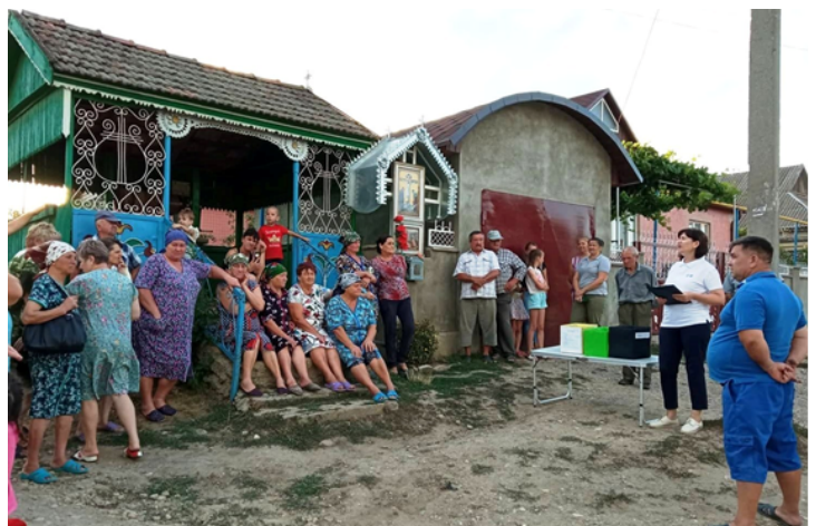
Villagers of Borogani, Leova, discuss local development priorities during consultations held within the Swiss-financed project "Mă Implic" ("I Engage")

At the same time, Switzerland assists local public authorities in diversifying their sources of funding through partnerships with migrants, private sector, and other donors, in order to improve the availability, accessibility and quality of public services delivered to people all over the country. As well, in order to enable central and local public authorities to make targeted, cost-efficient policies based on reliable evidence and demographic projections, Switzerland continues supporting the National Bureau of Statistics in modernizing the generation and dissemination of official population data at national and sub-national levels taking into account internal and international migration trends. The convergence of multiple crises put the resilience of Moldova and its population to a great test, and forced central and local public authorities to balance between operating in a short-term crisis management mode, on the one side, and pursuing the implementation of reforms with a medium-term perspective, on the other side.