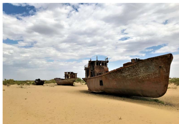
Ship wrecks in the dried up Aral Sea, Uzbekistan, Photo: SDC/Andreas Gerrits

The combination of a regional approach and bilateral interventions will offer an opportunity for the required flexibility in a dynamic and changing environment and underscores the requirement to 'think regionally, act locally'. The regional approach consists of four sub-approaches: 1) Regional action to solve regional problems; this currently refers mainly to the Blue Peace Initiative; 2) Cross-border programmatic activities; where Switzerland is ready to support such interventions if requested by the countries; 3) Multi-country programming, i.e. working on the same topic in different countries; this is already being done in a number of areas, e.g. in supporting country-level interventions for integrated water resource management and for the provision of quality public infrastructure services as well as in helping MSMEs provide access to jobs and income opportunities; and 4) Regional exchanges and knowledge management; whereas this sub-approach is already developed in the water, infrastructure and climate change (WICC) portfolio and culture programme, its application to other areas of interventions will be promoted and tested, and Swiss government entities engaged in Central Asia together with involved partners will coordinate their regional efforts more closely to increase impact and learn from each other.