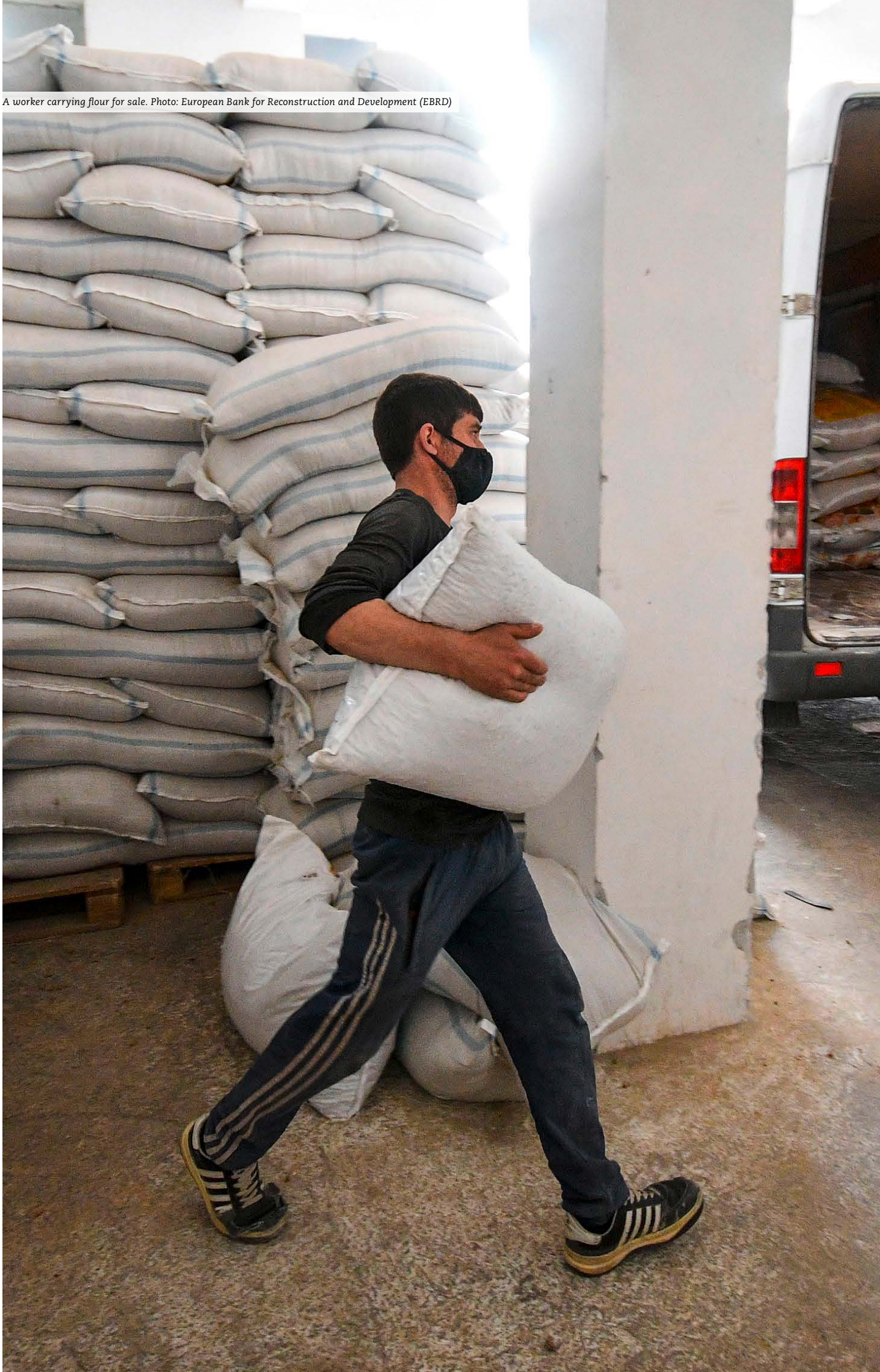
A worker carrying flour for sale.