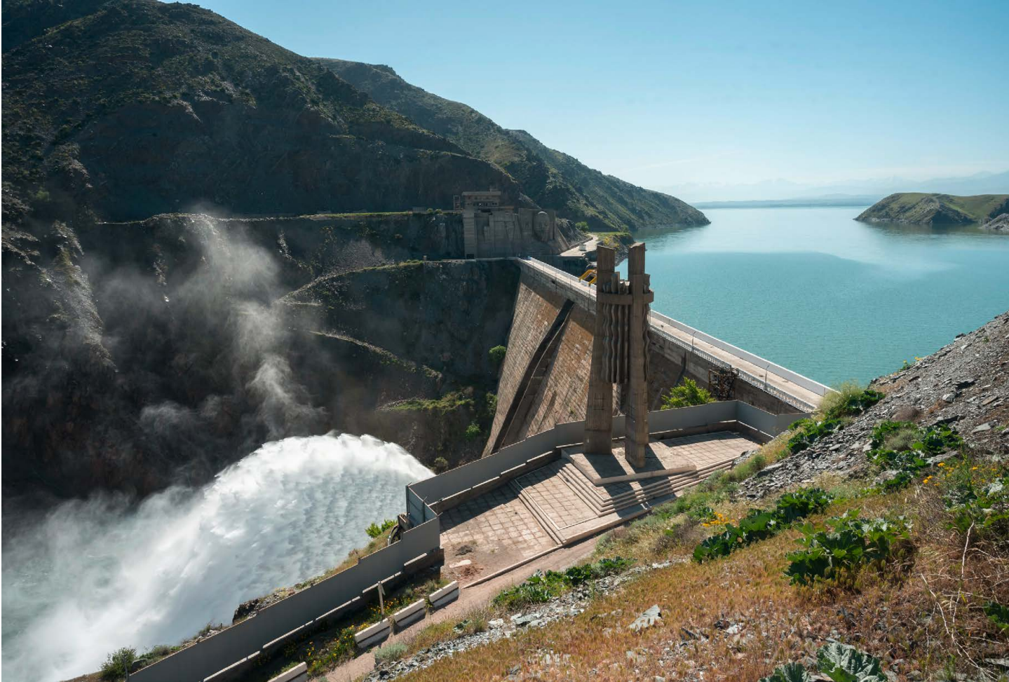
The Kirov reservoir, the water dam in west of Talas province, Kyrgyzstan.

A key lesson learned at regional level is that there is a need for better understanding of the regional political economy in the water sector with its underlying power and interest mechanisms, including the divergence between formal and the actual governance. Values governing the water agreements at various levels have not been sufficiently investigated.