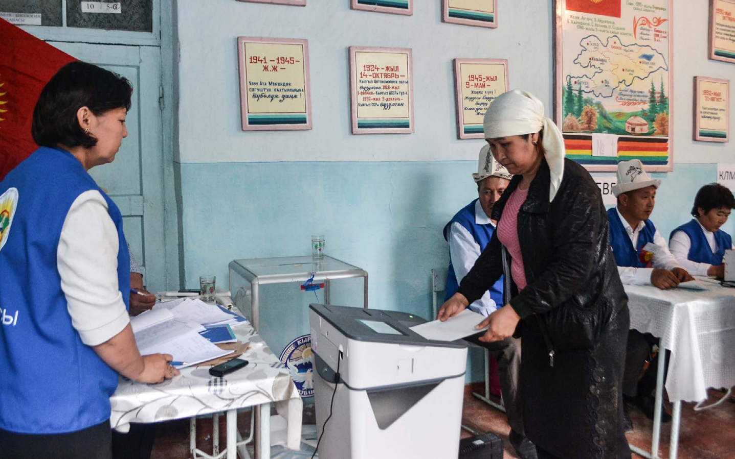
People are voting in parliamentary elections, Kyrgyzstan.