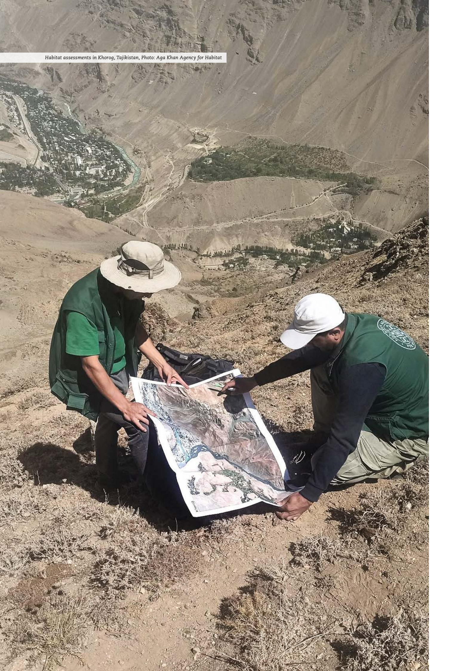
Habitat assessments in Khorog, Tajikistan, Photo: Aga Khan Agency for Habitat