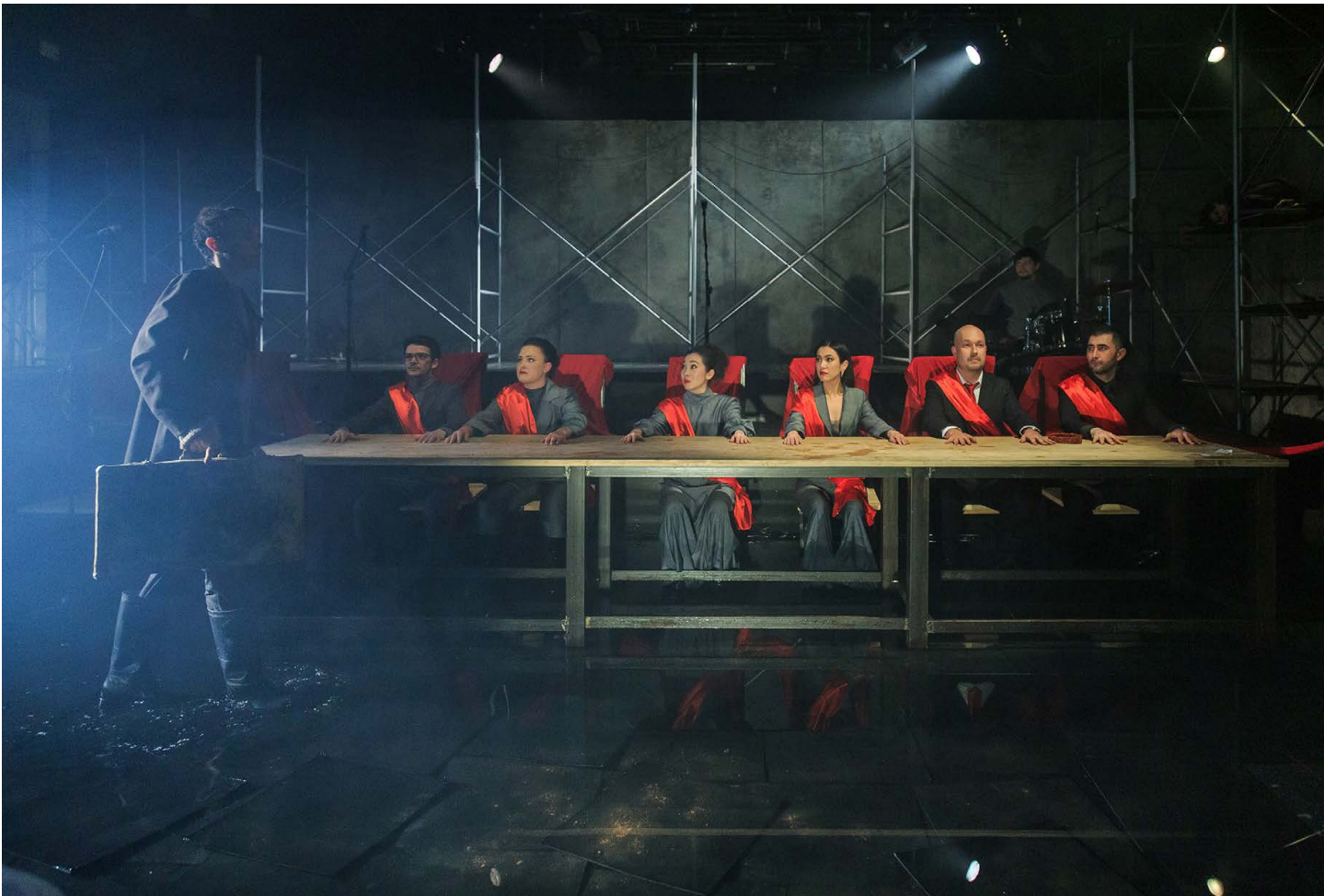
“Tomorrow” performance at Ilkhom Theatre, Uzbekistan.

Programme disbursements foreseen within the Swiss Cooperation Programme Central Asia 2022–25 amount to approximately CHF 233 million. Overall, the SDC’s contribution will amount to CHF 138 million, of which CHF 117.3 million will go to EURAD, CHF 6 million to HA, and CHF 14.6 million to Global Cooperation. SECO’s commitments are to be at least CHF 95 million (see Annex 4).