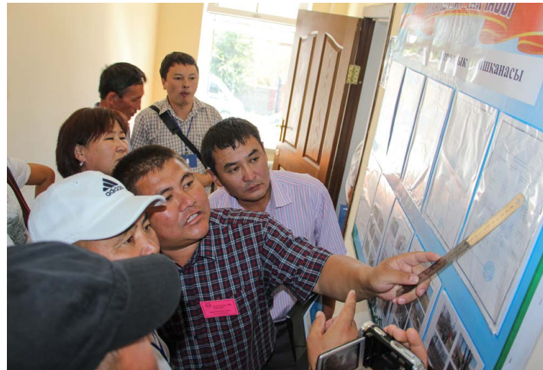
Citizens discuss the local budget in their rural municipality, Kyrgyzstan.

All countries in the region are exposed to high-level risks of natural disasters, including earthquakes, and are already suffering greatly from the impact of climate change. Glacier melting, permafrost thawing, and changing precipitation patterns are increasing the risk of large landslides, avalanches, and glacier lake outburst floods. In terms of water availability, a significant decline is expected in the second half of this century. Decreasing precipitation is already weakening food security and energy production in Central Asia. In addition, climate change is threatening the resilience of ecosystems that are already under increasing pressure from agri-