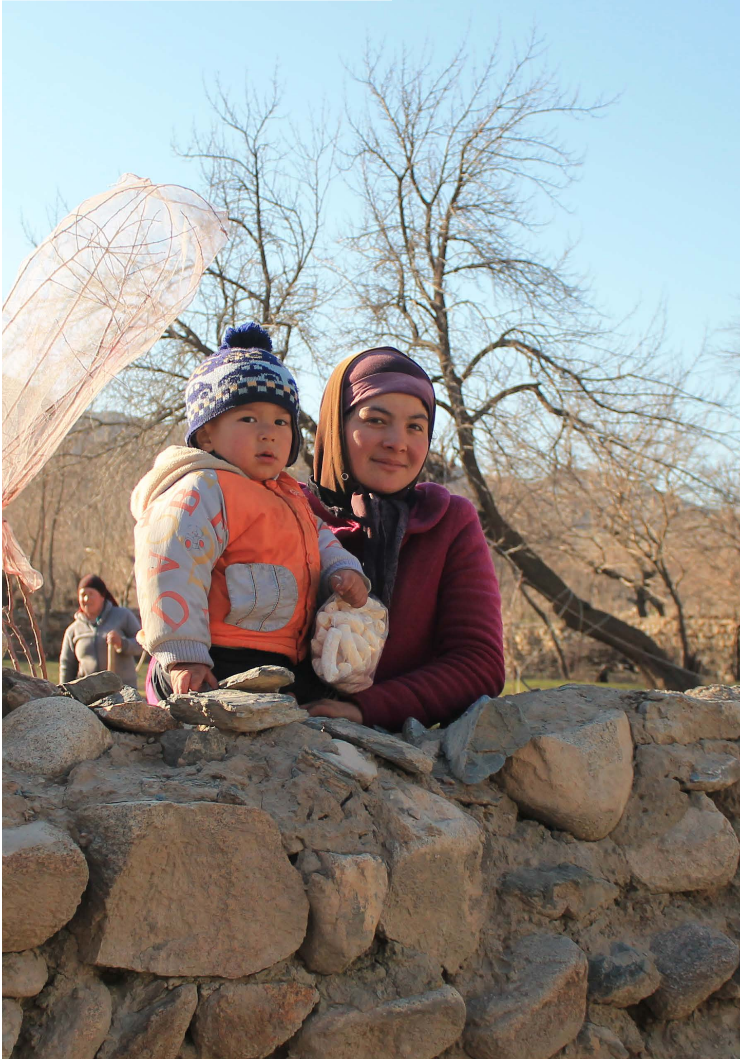
A young mother and her son peek over a wall in Sentyab village, Uzbekistan.