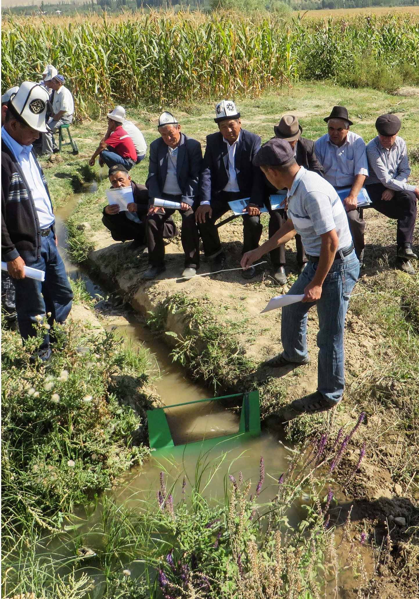
Members of Water Users Association at water distribution point, Kyrgyzstan.