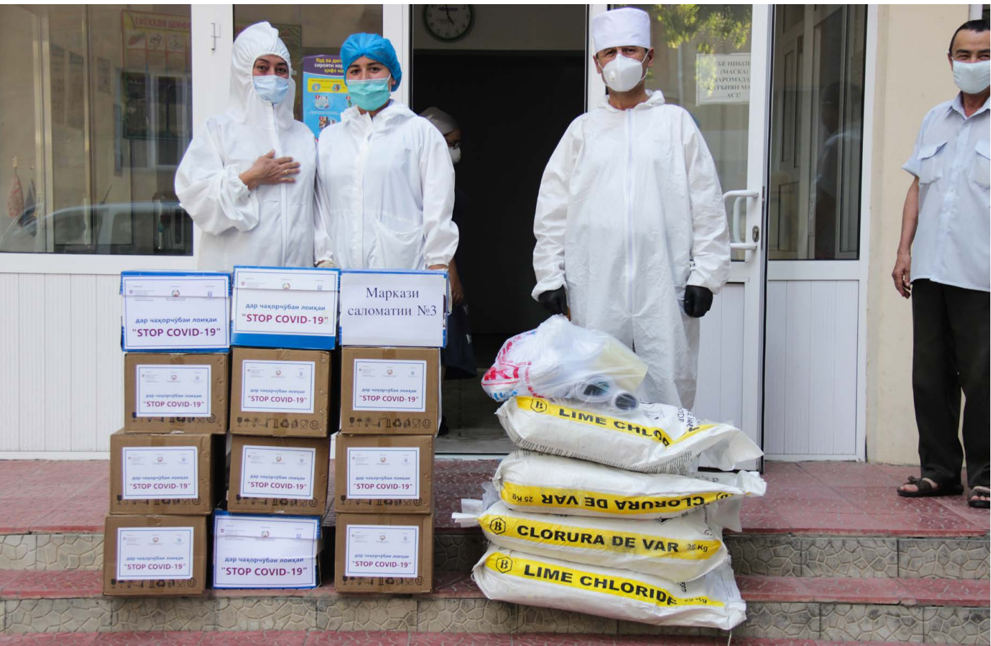
Local hospitals have received help in response to Covid-19, Sugd, Tajikistan, Photo: International Secretariat for Water