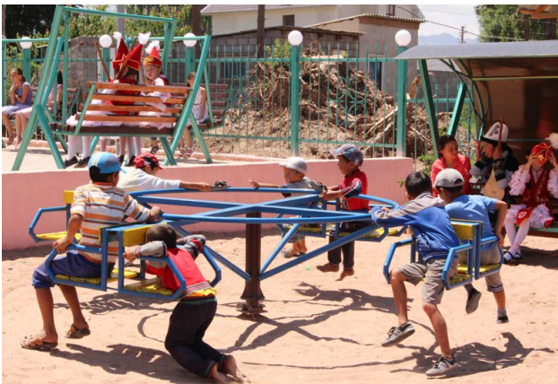
Recreation services improved in rural municipality, Kyrgyzstan.

The first dimension is the regional and country context – which is monitored through an annual MERV process and linked to the uncertainties identified in the context analysis and additional fields of observation for the development space. The second dimension – programme portfolio results – assesses progress towards expected outcomes defined in the result frameworks for the regional and three national portfolios (see the synopsis of these result frameworks in Annex 2) as well as the contributions towards regional and country-level development outcomes, including transversal themes (gender and governance). Innovative approaches to monitoring the programme's progress will be explored, especially for regional outcomes. Annual reports jointly developed by all partners involved are the main instrument for communication, accountability and learning, as well as for the monitoring of financial disbursements. Learning is promoted through exchanges, as well as specific events, including regional meetings (facilitated by regional advisors), field visits, and peer reviews. The third dimension – management – will be monitored by each representation's internal control system, the office management report, and the financial reporting system.