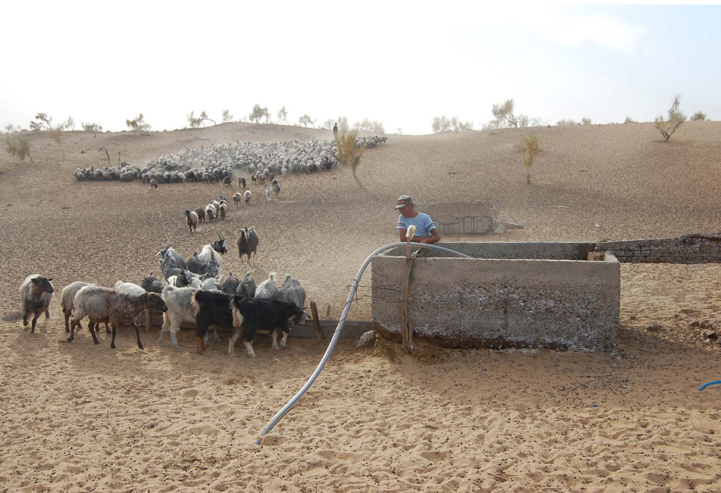
Managing the scarce water resources is key for livestock and food security, Uzbekistan, Photo: UNDP