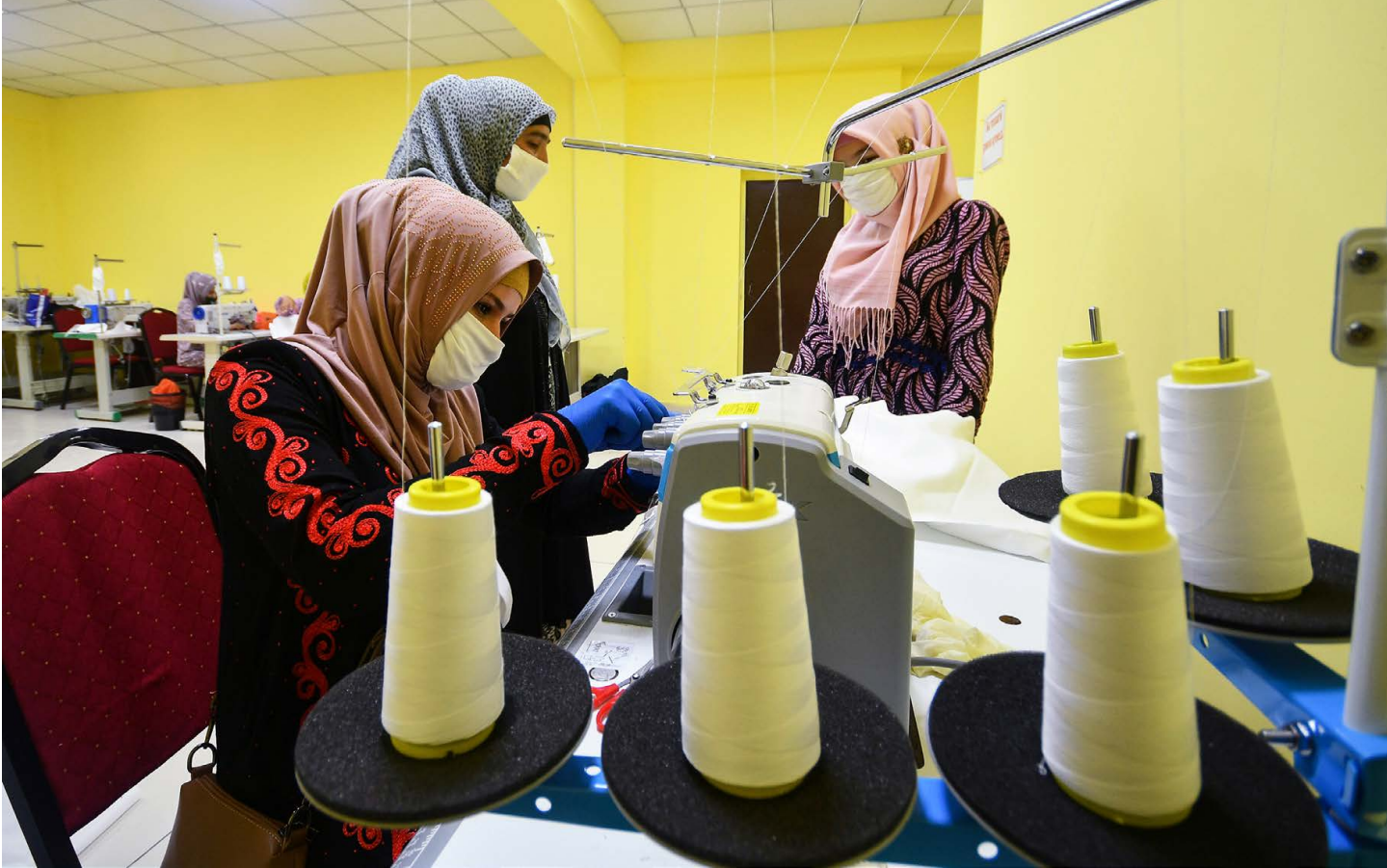
Women sewing textiles in their sewing factory.