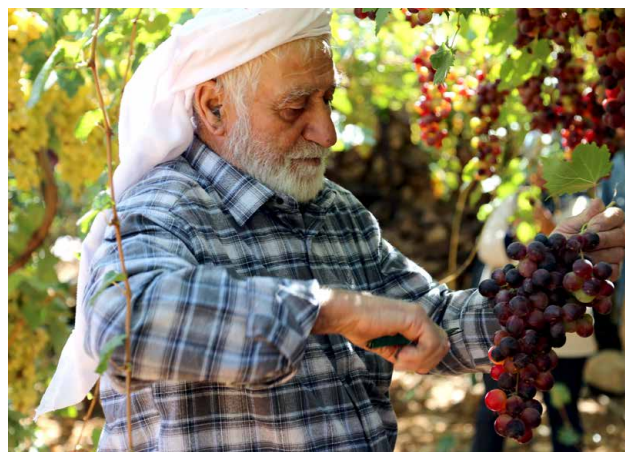
Switzerland promotes support and technical innovation for smallholders – a contribution to foster food security and access to land in the oPt.

In line with the peace promotion strategy of the Human Security Division (PHRD) for Israel and the oPt, Switzerland has contributed to inclusive dialogue, both within the Israeli and Palestinian societies, as well as between them. Through diplomatic and programmatic engagement, it has encouraged innovative approaches to addressing the conflict and contributed to de-escalating tensions. For example, Switzerland co-mediated a ceasefire agreement between Israel and Hamas in November 2018. In 2017, Switzerland negotiated the elaboration of a document (the Swiss roadmap) between Palestinian factions that laid the ground for a consolidation of the civil service in the Gaza Strip.