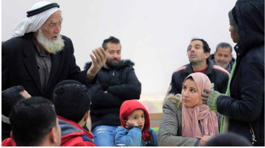
Debate between members of a community on future projects for their village.