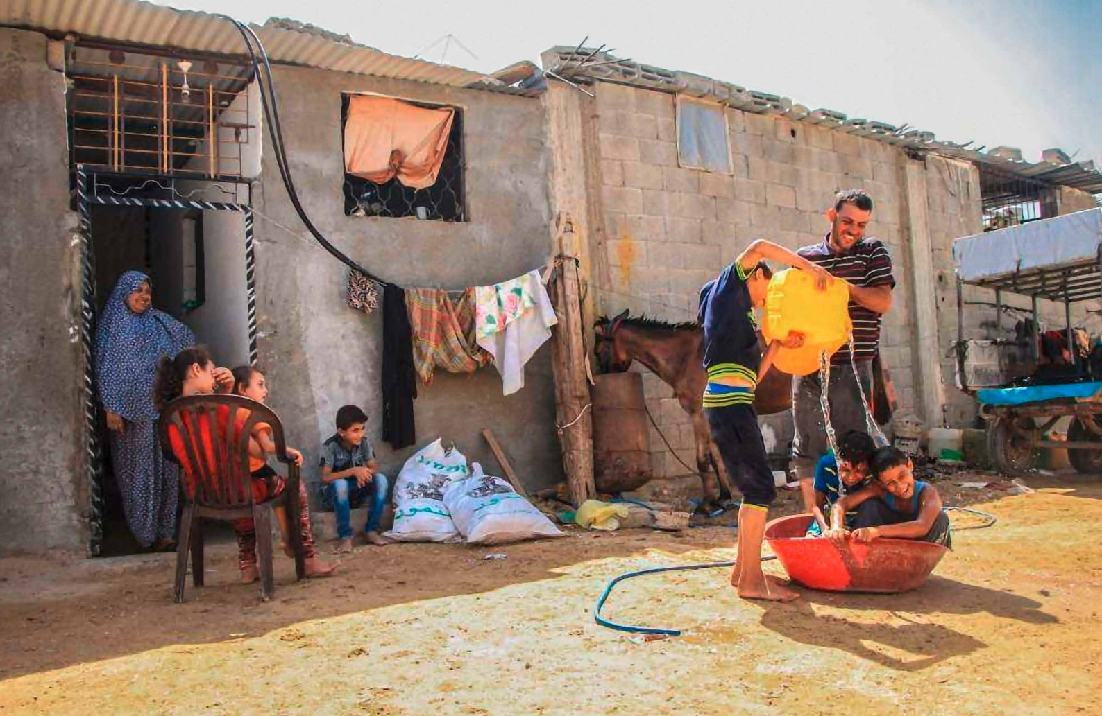
Family life in the Gaza strip. Only one in 10 people has direct access to clean and safe water while 97% of freshwater from Gaza's aquifer is unfit for human consumption.