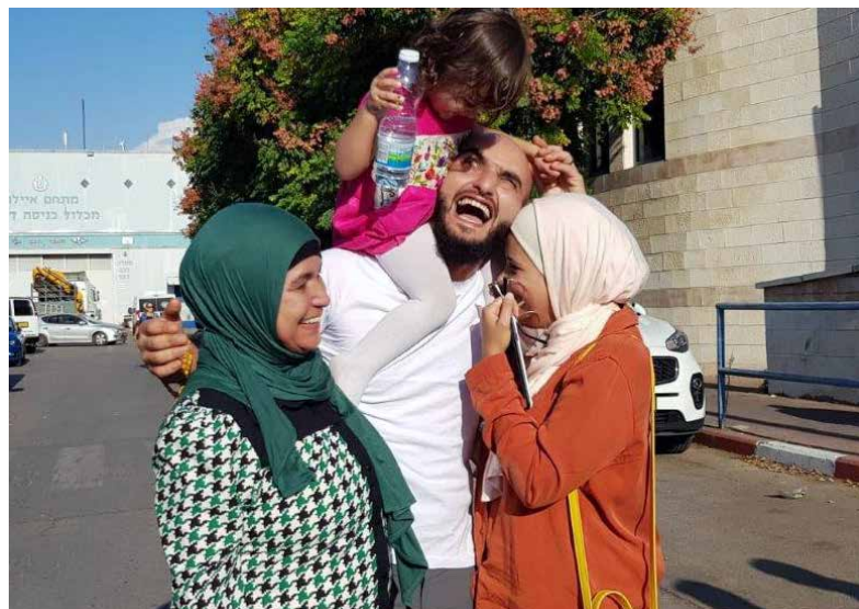
The promotion of peace, human rights and international humanitarian law is a central pillar of Swiss engagement in the oPt and Israel. A Palestinian released from administrative detention in Israel is greeted by his family.

In general terms, young people in the oPt are politically underrepresented and no participation mechanisms are in place to enable them to accede to leadership positions. Unemployment remains high, particularly in the Gaza Strip – reaching about 50% among the general population and 70% among youth (aged 15 to 29) and 92% among young women 9 . Palestinian youth are increasingly disillusioned and there is a risk that frustration will be expressed through violence or emigration. Within the existing constraints, including trade barriers, opportunities exist: well-educated and skilled Palestinian youth can be engaged in and generate jobs in the emerging high-tech and IT sectors. In the medium term, and if circumstances allow, there will be additional opportunities linked to the regional economy, for example in the digitalisation sector.