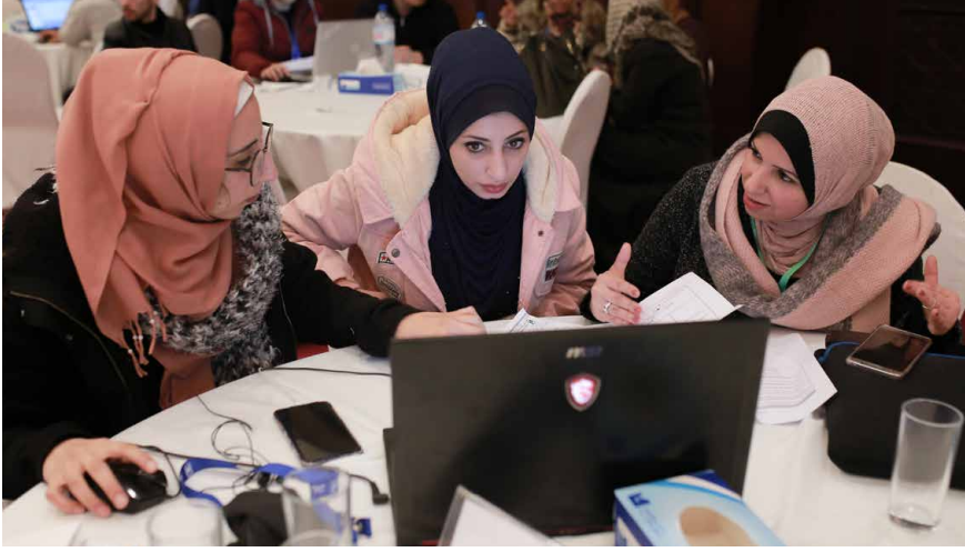
Youth brainstorming at a “hackathon” (software development event) in Gaza sponsored by the SDC and UNDP job creation program.