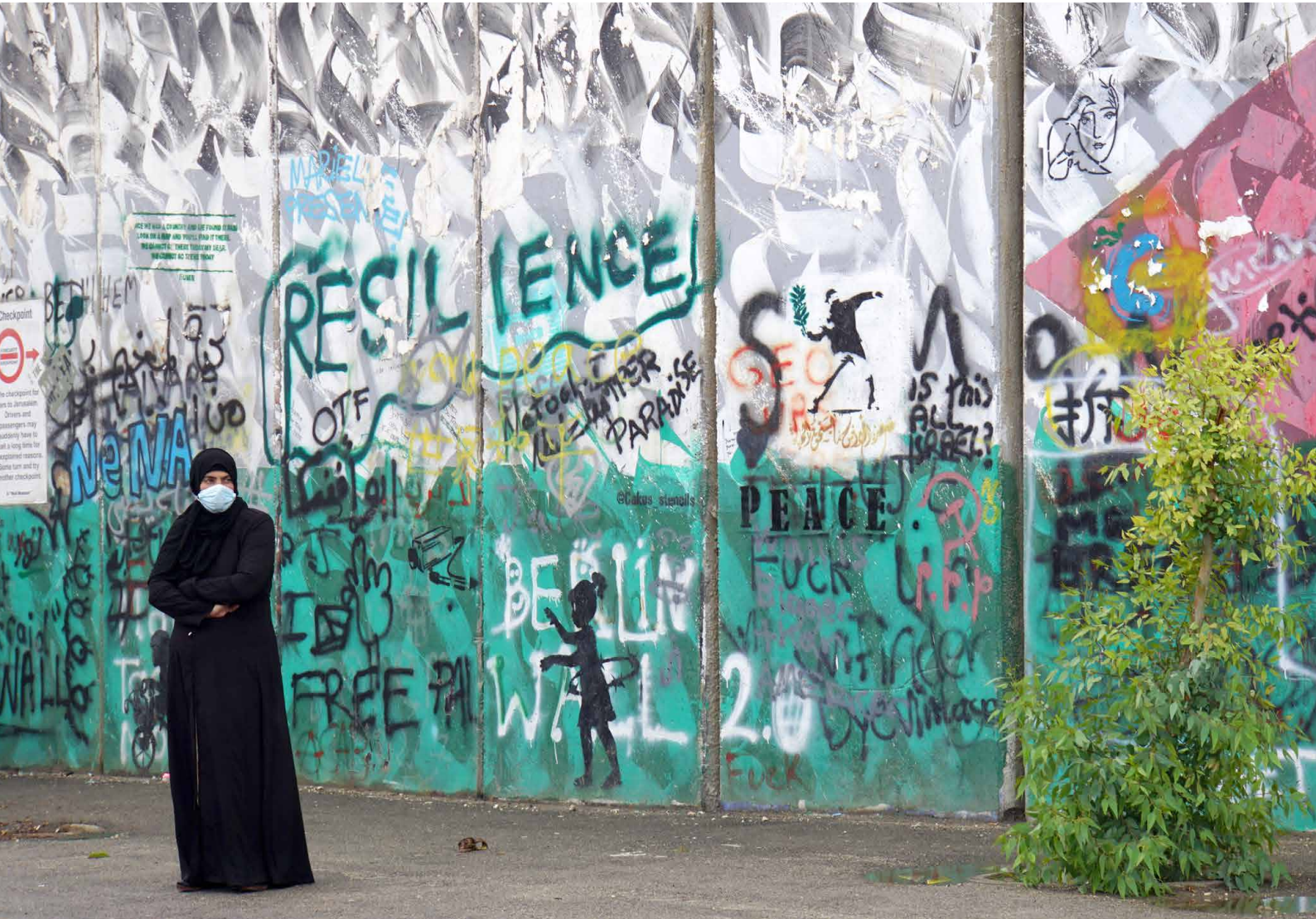
Resilience and longing for peace – scene at a bus stop in Bethlehem.