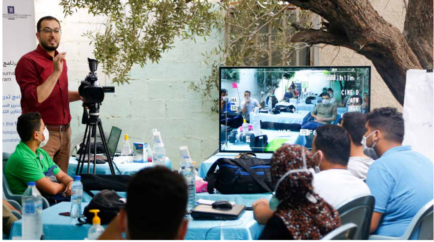
Training course for young journalists in the frame of the project “Strengthening Free & Independent Media in Palestine” co-funded by the Swiss Government.