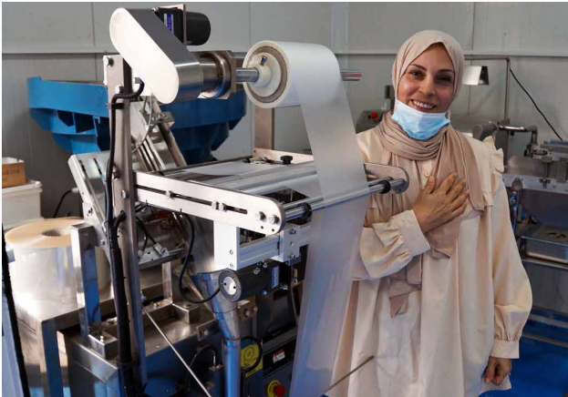
This Palestinian businesswoman expanded her family enterprise thanks to a new packing system for dates, purchased with Swiss support.