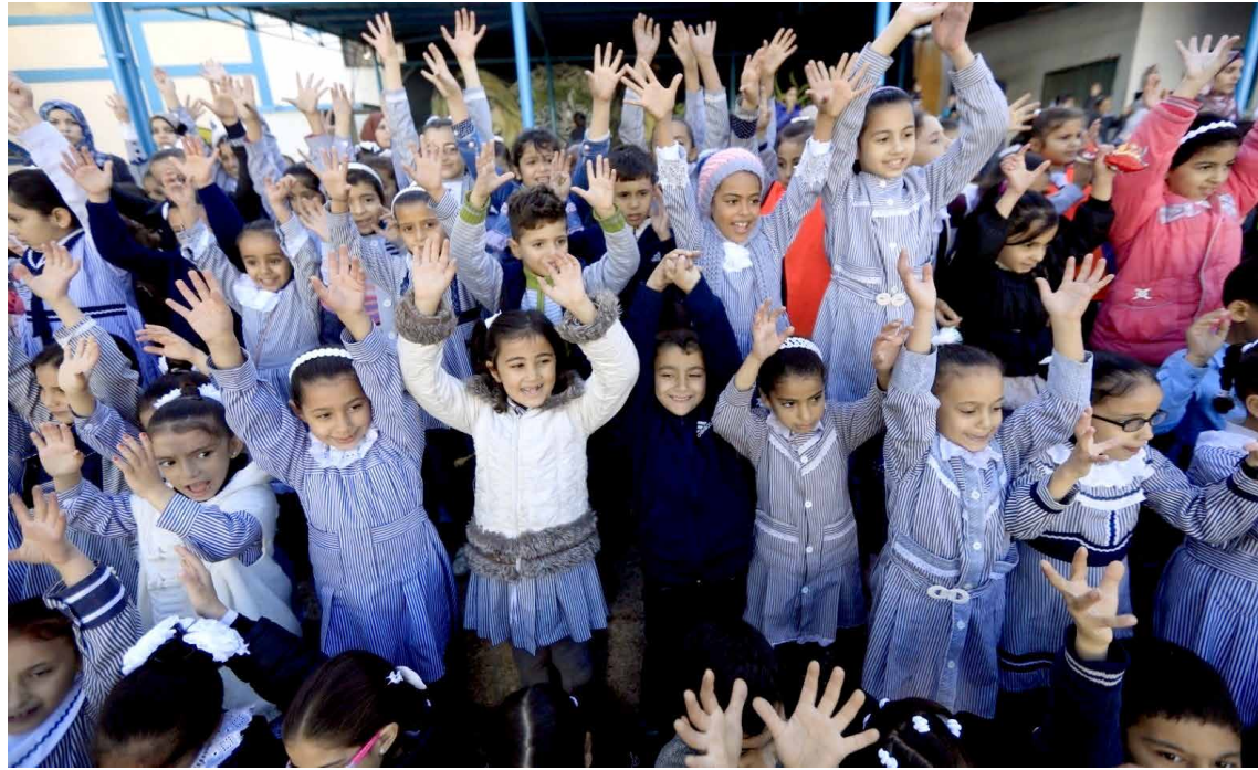
330'000 children in the oPt have access to quality education in UNRWA schools.