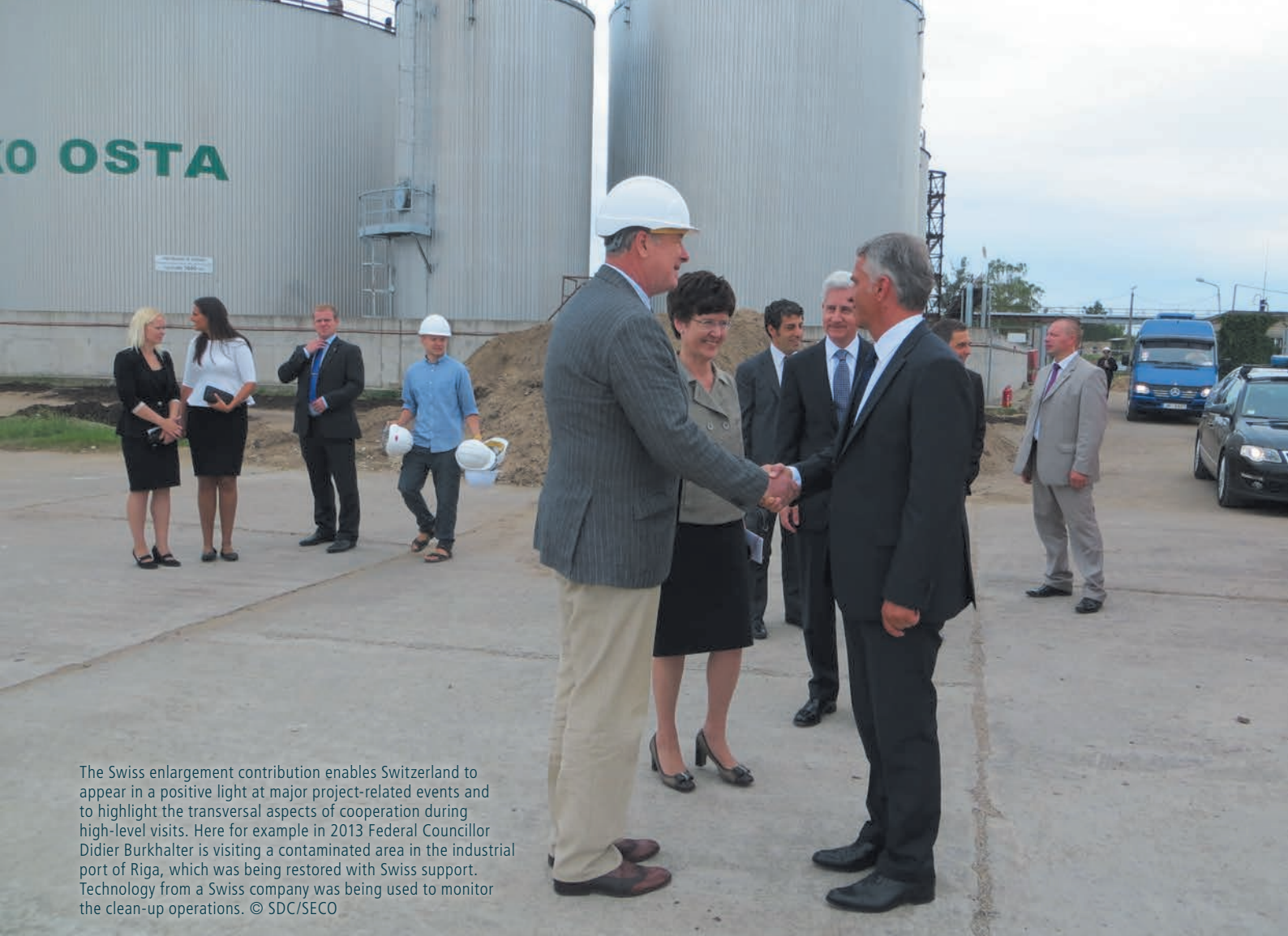
The Swiss enlargement contribution enables Switzerland to appear in a positive light at major project-related events and to highlight the transversal aspects of cooperation during high-level visits. Here for example in 2013 Federal Councillor Didier Burkhalter is visiting a contaminated area in the industrial port of Riga, which was being restored with Swiss support. Technology from a Swiss company was being used to monitor the clean-up operations.