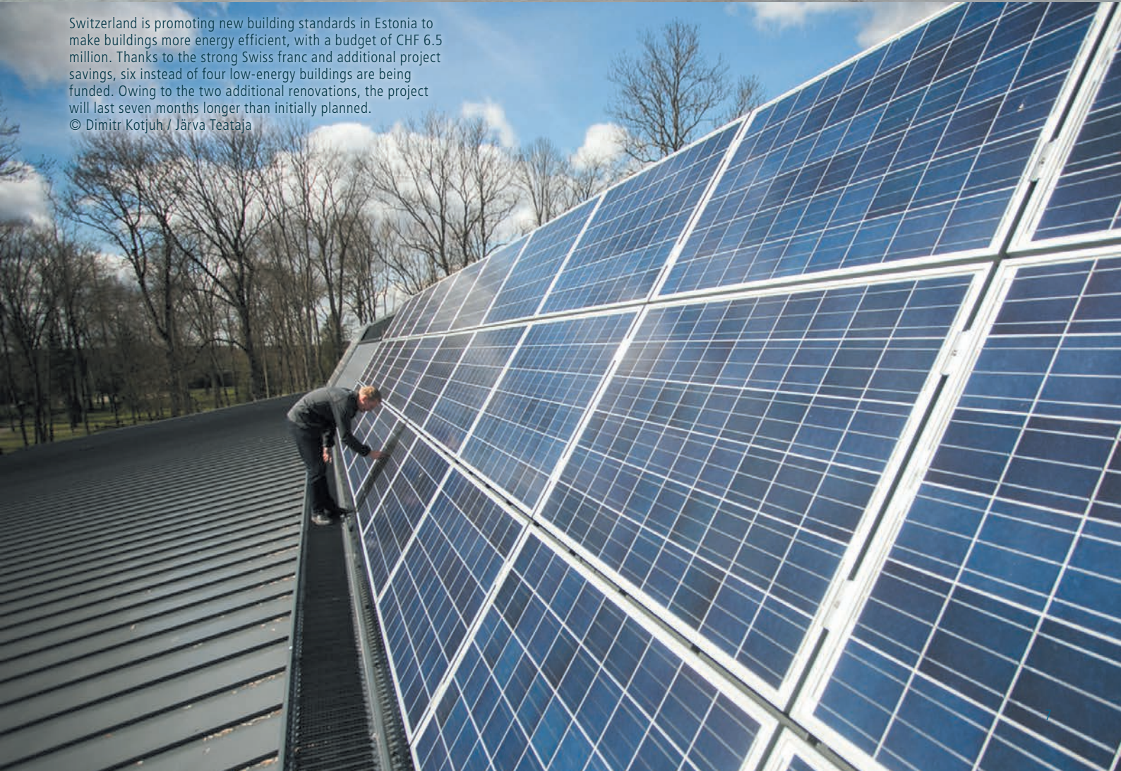
Switzerland is promoting new building standards in Estonia to make buildings more energy efficient, with a budget of CHF 6.5 million. Thanks to the strong Swiss franc and additional project savings, six instead of four low-energy buildings are being funded. Owing to the two additional renovations, the project will last seven months longer than initially planned.