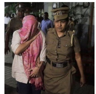
The arrest of a local employee of the Swiss Embassy in Colombo.