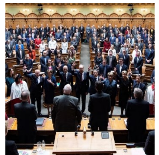
Swearing in of the Federal Council