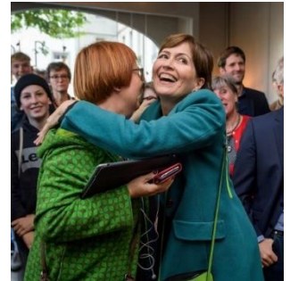
Images in most media primarily featured women politicians from the green parties.

Some media also linked the result to a more immediate understanding of climate change in Switzerland given the melting of the Swiss glaciers. The electoral gains of The Greens and the Swiss Green Liberal Party (glp) failing to translate into a seat on the Federal Council also attracted interest and met with incomprehension in some foreign media. This news was sometimes accompanied by explanations of how the Swiss political system works.