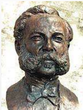
Bust of Henry Dunant (1828-1910).