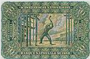
Reproduction of the "Woodcutter" (painting by Ferdinand Hodler), which featured on the back of the 50 Swiss franc bank note issued in 1911.

The economic and social developments of the 19 th century led to the rapid growth of the Swiss banking system. Before then, Switzerland had only a handful of private banks, which managed the financial affairs of city patricians and merchants.