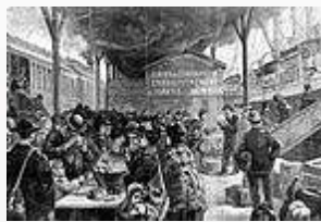
America-bound emigrants in Le Havre.

Population growth, a dearth of job opportunities, famine and economic crises forced many Swiss people to emigrate in the 19 th century. There were three main emigration waves – 1816-1817, 1845-1855 and 1880-1885 – which saw the Swiss settle in all parts of the world, especially in North America.