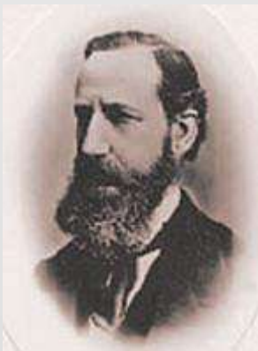
Henri Nestlé (1814-1890).

The second half of the 19 th century saw the emergence of new economic sectors in Switzerland. These were often spin-offs from existing industries. Demand for fabric dyes led to the growth of the chemical industry, which built its factories along rivers (Basel) and, in turn, facilitated the development of intensive farming (artificial fertilisers) and the expansion of the paper industry (cellulose and bonding agents).