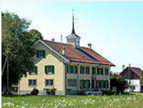
The village school built in 1875 in Les Cullayes, canton of Vaud.

"Enlightened" thinkers and, later, liberals campaigned for public schools. They considered education as both a prerequisite for responsible political co-determination and a provider of the skills needed by an increasingly specialised and market-driven economy.