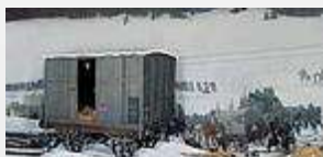
The Bourbaki Panorama in Lucerne depicts one of the first aid operations carried out by the Red Cross: the transport and care of the wounded following the defeat of French troops in the Franco-Prussian War of 1870/71.

The Battle of Solferino (Lombardy) in 1859, which was fought during the Italian war of unification, left more than 10,000 dead. One eyewitness was the Geneva businessman Henry Dunant, who helped the villagers care for the wounded. When he returned to Geneva, he called for the creation of a special committee that would come to the aid of all those wounded in battle. In 1876, this organisation was named the International Committee of the Red Cross (ICRC). Although the ICRC is a private association and all members of its governing body are Swiss nationals, it is recognised as an international organisation under international law.