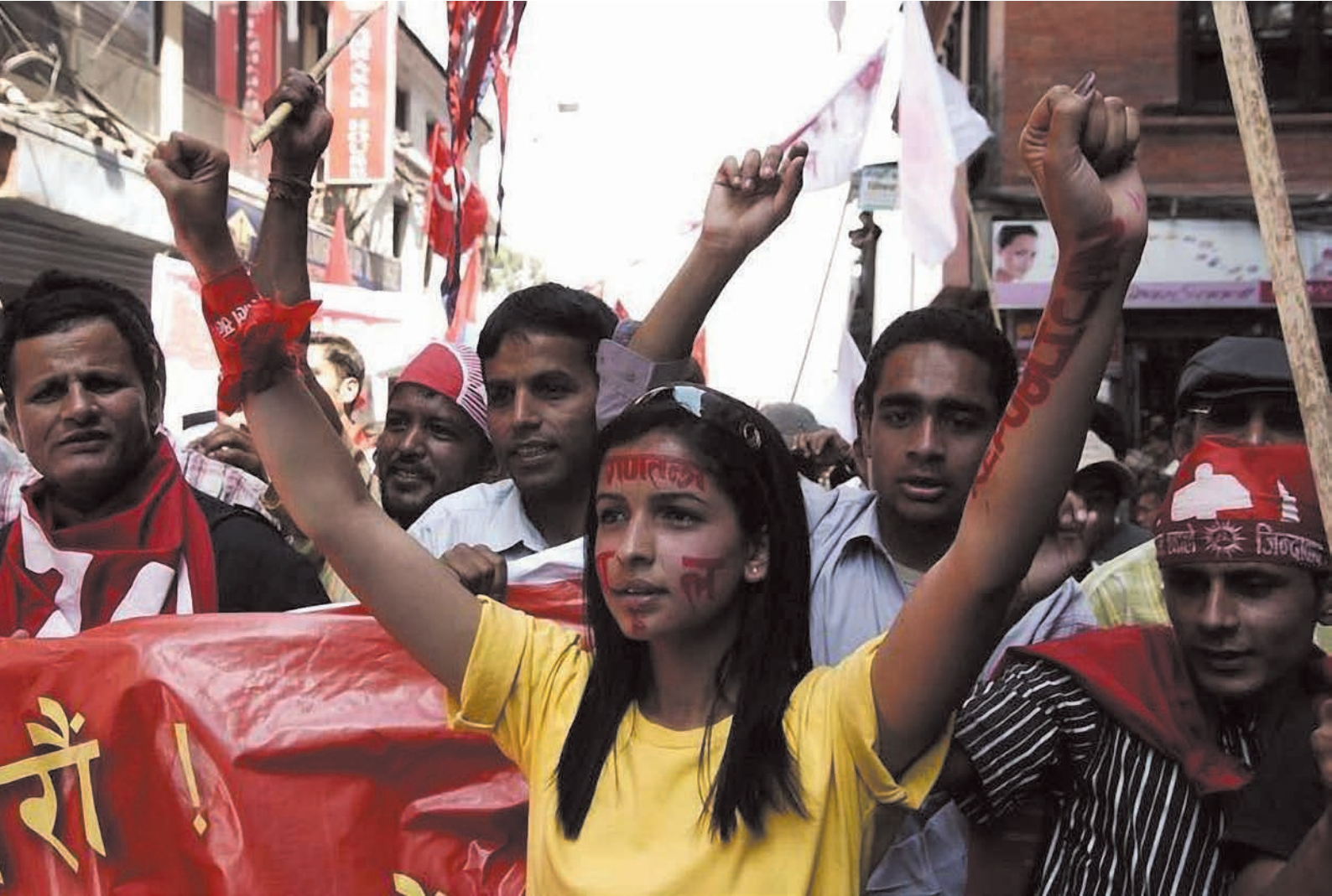
People's movement for democracy, 2006, Nepal («Jana Andolan II»)