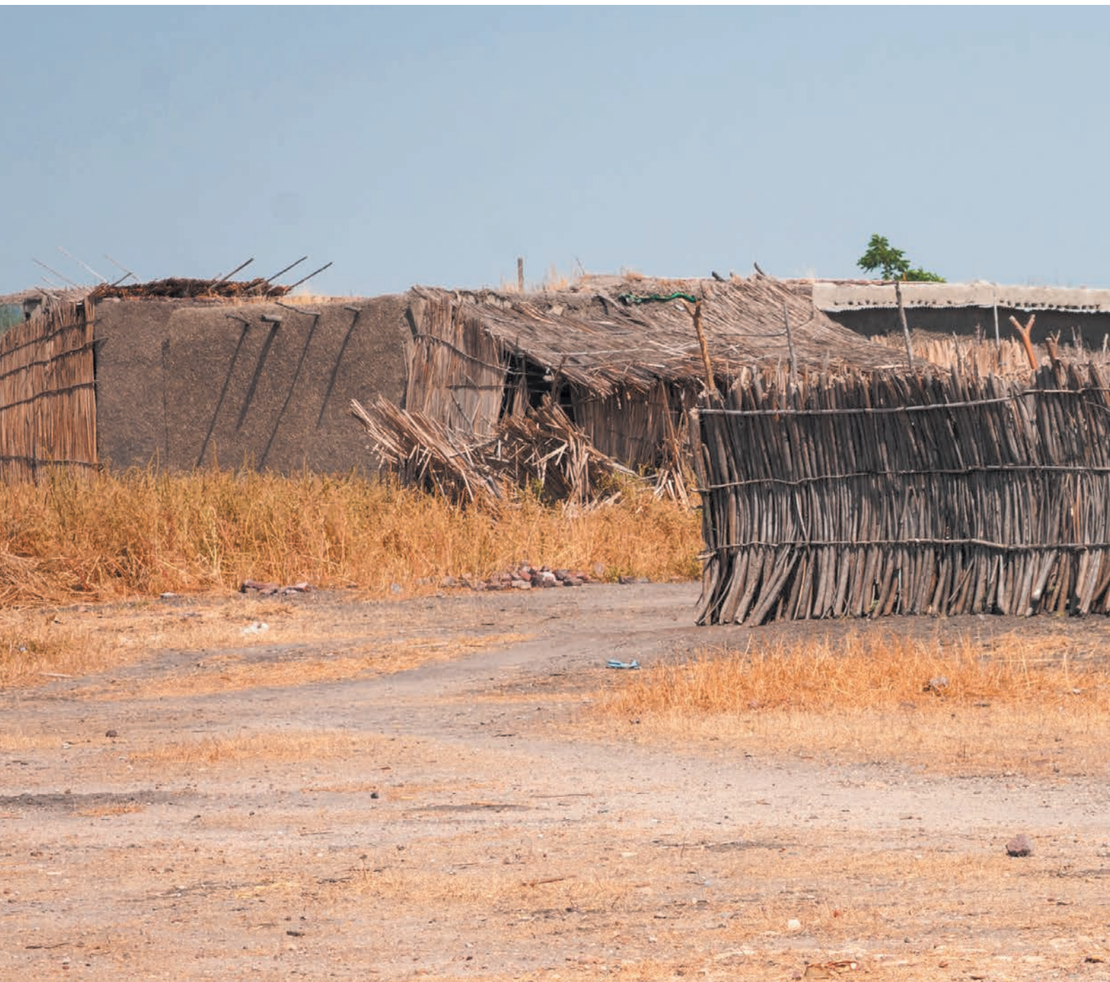
Girl with ICRC jerry can in the near Renk, South Sudan