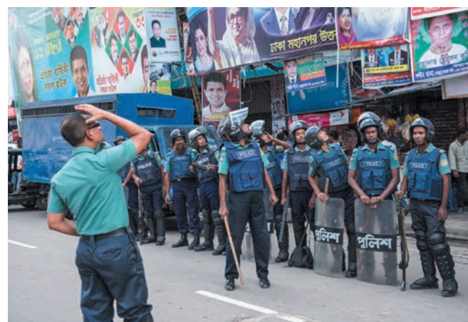
Bangladeshi police men preparing for their mission during political strikes, Dhaka

Sound conflict analysis guides SDC's contribution to the reduction of conflicts around natural resources. In Honduras, SDC supports a watershed program that serves as a vehicle to address underlying causes of violence such as social exclusion, lack of state legitimacy and local economic development. The program contributes to local ownership and the strengthening of the legitimacy of state entities and additionally to disaster risk reduction. With the Blue Peace project, SDC contributes to building the foundations for the future cooperative management of the Orontes basin's water resources at local, national and transboundary level. The project is based on the assumption that if water can contribute to conflict, for instance in Syria, it can also be a source of reconciliation and that concerted water management can contribute to peacebuilding. In Colombia, through the IAPRE project (do no harm in land restitution), SDC contributes to the mitigation of conflicts that are generated by the transitional justice policy that seeks to return the land to the people who have been dispossessed by armed conflict. Through the institutionalization of instruments that enhances the context analysis, the awareness of public officials and judges, the project aims to reduce the negative effects of land restitution during the armed conflict.