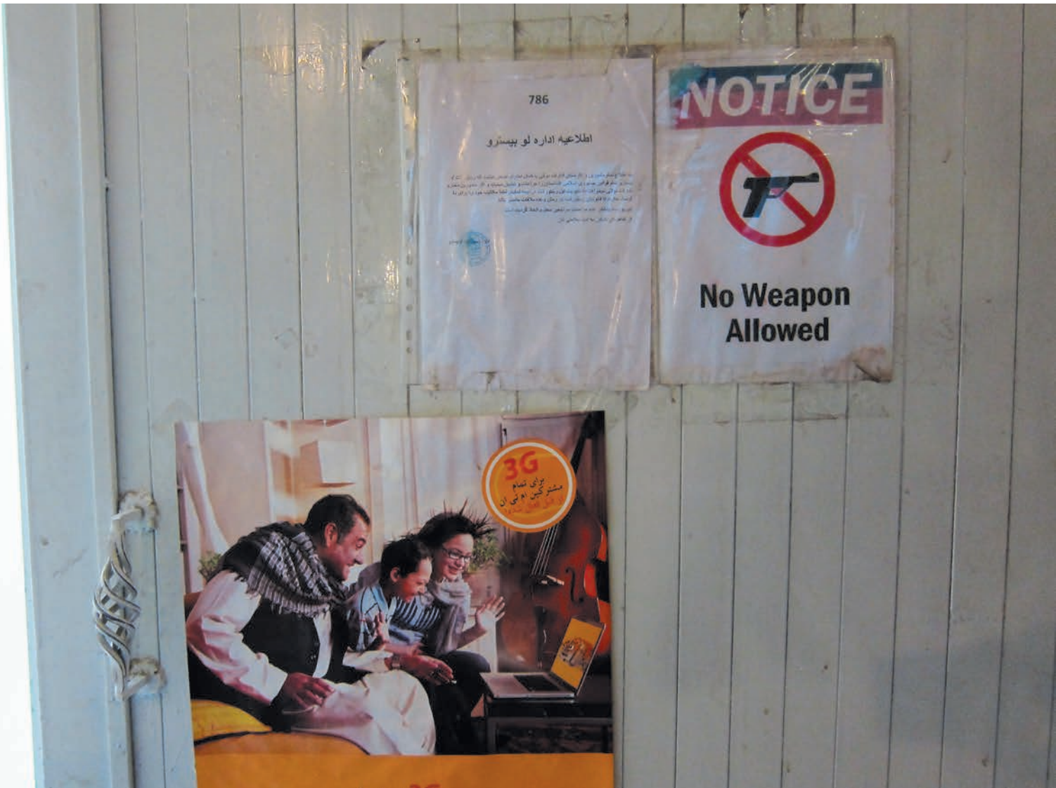
“No weapon” sign at the entrance of a shop in Kabul, Afghanistan