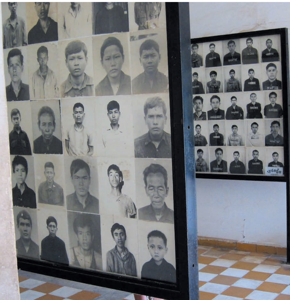
Dealing with the Past in Cambodia: exhibition of Pol Pot victims at the Tuol Sleng Genocide Museum, Phnom Penh

SDC aims to widen the space for development and humanitarian aid as a crucial condition for staying engaged. The presence of SDC and its partners in the field has had positive effects on protection of the population in rural areas. The Sustained Humanitarian Presence Initiative in South Sudan for example allows partners to stay and deliver humanitarian assistance in a conflict environment. Enlarging the space enables SDC in general to transfer local information to the national and international levels. Whilst access in humanitarian aid is based on a clear legal base (IHL), practical access to the beneficiaries has proven to be crucial as well for development programs to be able to stay engaged in difficult situations. For instance the Conflict Sensitive Working Group Afghanistan, including SDC, has developed "Principles of Access".