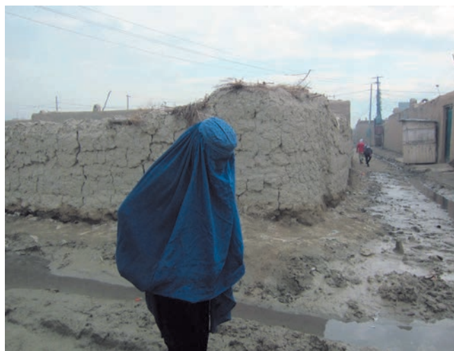
Woman walking in the streets of Kabul, Afghanistan

Results-based frameworks in cooperation strategies help to achieve results in fragile contexts and define the implementation modalities. The programs are systematically adapted to the actual scenario. The result frameworks are key in order to comply with the principles of downward- and upward-accountability. Specific management and performance results have to be defined in the Result Framework 1) one on CSPM Implementation (e.g. work force diversity or specific contribution to donor coordination), and 2) one on the policy contribution aid for peace.