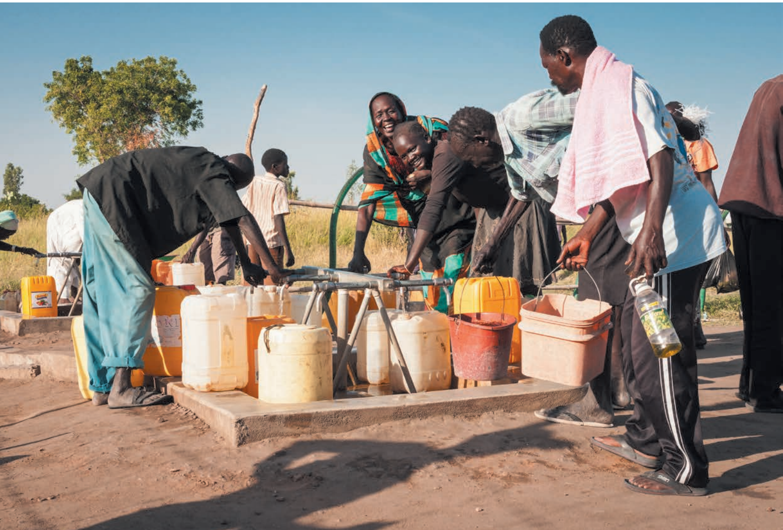
South Sudanese returnees from Khartoum fetching water in Renk, South Sudan