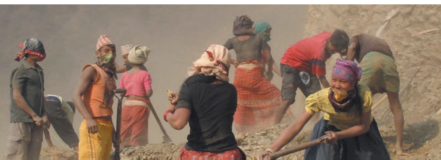
Labour-based road construction programme (DRSP) of SDC in Nepal. As a result of a conflict sensitive programme management, the work could be continued also during the armed conflict.

Building peace and increasing state responsiveness requires a political process for transforming power dynamics and economic relationships. Resistance and setbacks are to be expected. Supporting champions of reform is crucial and requires adept political dialogue to build trust and manage risks. SDC actively participates in donor coordination (in FCS a bottom up-approach in donor coordination is often more suitable for SDC, given the highly politicized context on national level), established international processes, as well as international organizations. On the global level, SDC has a number of priority multilateral organizations, of which it is among the top ten donors. It takes an active and recognized part in their steering, as shareholder, and brings its field perspective into global discussions. For a country specific example of an aid-for-peace-guided program, SDC is part of the Nepal Peace Trust Fund (NPTF), a joint funding mechanism to support constructive collaboration between the parties of the armed conflict and the implementation of the 2006 Comprehensive Peace Agreement . A specific contribution in FCS can be for SDC to insist that, the Office of the High Commissioner for Human rights is represented in Development Fora.