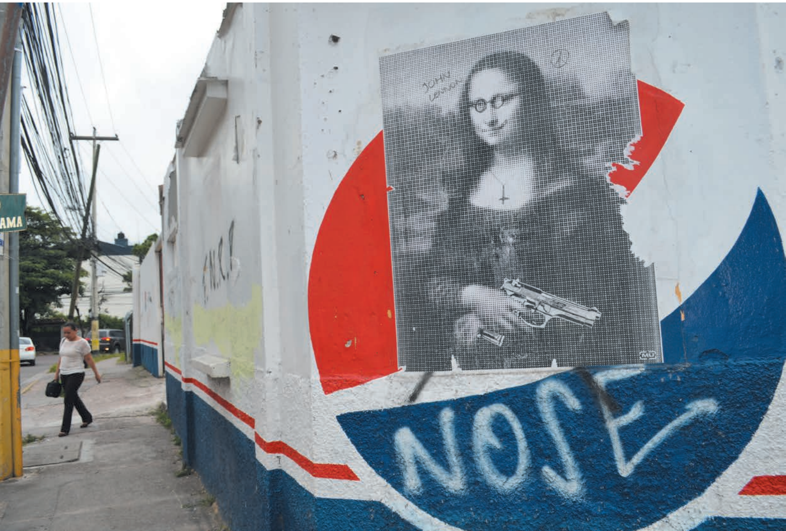
Graffiti art in the streets of Tegucigalpa, Honduras