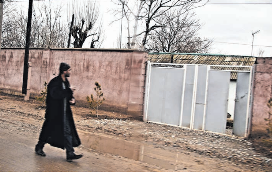
Open gate. Dushanbe, Tajikistan