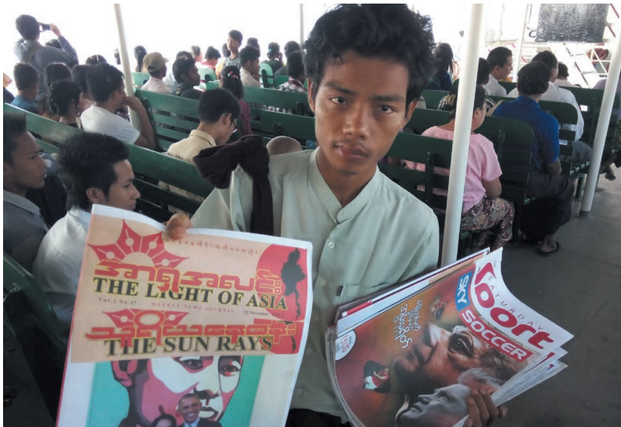
Boy selling local newspapers on a commuter ferry in Yangon, Myanmar

SDC supports the respect for human rights and fundamental freedoms, which are often under threat in fragile contexts. Access to justice helps overcome conflict and fragility by enabling people to access remedies and redress for injustice and by holding perpetrators accountable. SDC supports activities that address the legacy of conflict, contribute to the restoration of justice, and rebuild trust between state institutions and citizens. In Kyrgyzstan, for example, SDC has supported land reform efforts as well as legal awareness and services for the rural population with the aim of enhancing land ownership rights and preventing land-related conflicts.