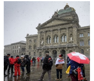
The popular vote on the COVID-19 Act was also seen as polarising.