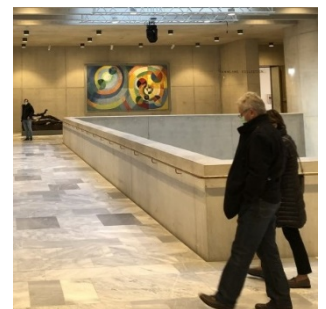
The extension to the Kunsthhaus Zürich includes the Bührlé Collection.

better approach to dealing with potentially looted art.