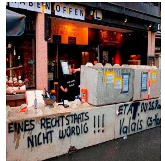
The closure of a restaurant in Zermatt for breaching coronavirus measures was also covered by international media.

rest of Western Europe; and the popular vote for the second referendum on the COVID-19 Act. In the run-up to the vote, the media also addressed the rising tensions between supporters and critics of the measures, as well as contrasting urban and rural vaccination coverage and scepticism. They sometimes presented