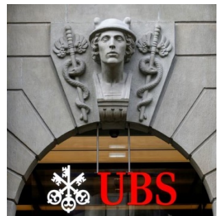
Reporting on major Swiss banks is mostly illustrated with stock images.

Further cases of the bank spying on its former employees emerged at the close of a FINMA enforcement procedure, with FINMA identifying serious breaches of supervisory law and imposing conditions on Credit Suisse. The media also reported on the conclusion of another FINMA enforcement procedure relating to the 'tuna bonds' loans scandal in Mozambique, focusing on FINMA's criticism of the banking giant and on the fines it paid to the US and UK. The intense media criticism could also have a negative impact on the reputation of the Swiss financial centre in general. Reporting also mentioned that Switzerland has an effective financial market supervisory authority, though this featured less prominently.