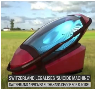
Sarco suicide capsule

Topics related to Switzerland continue to garner international attention even when their objective relevance is rather limited. Such topics often stand out because they are particularly emotional or surprising. In the fourth quarter of 2021 the news that the Sarco suicide capsule had allegedly been authorised under Swiss law was met with considerable interest. Media outlets around the world covered the story in detail and social media posts on the capsule were shared tens of thousands of times. A number of reports strongly criticised this alleged expansion of assisted dying in Switzerland, with some