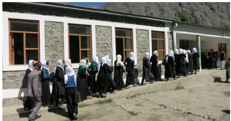
Girls school, Shughnan district, Badakhshan Province, © SDC.

The project supports the MoE to enhance quality education at secondary schools. The aim is to increase student enrolment, retention and learning. It works with 200 secondary schools as well as provincial and district education departments and communities in Badakhshan, Baghlan and Bamyan Provinces.