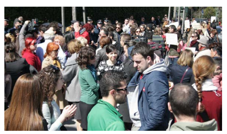
A civil gathering in Tirana, Albania.

Civic engagement in Albania is low. The relationship between citizens and local authorities is still not based on accountability, transparency and participation. Corruption is pervasive while checks and balances are weak and under utilised.