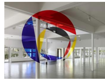
Felice Varini Art Exhibition 2-8 May