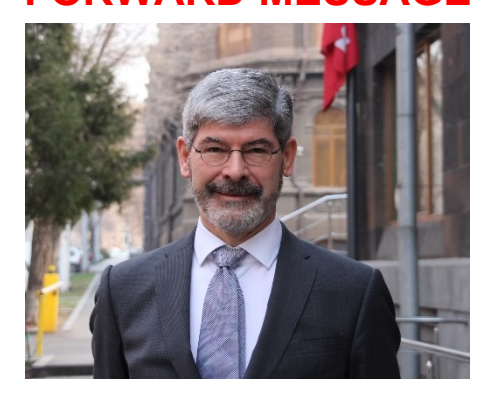
Dear readers Dear partners and friends

Probably the most important topic of Armenian policy and public attention in 2023 was the crisis in Nagorno-Karabakh (N-K). It began with the blockade in December 2022 and culminated in the Azerbaijani intervention and takeover of the remaining N-K territories in September 2023. As a result, Armenia had to take in around 100,000 refugees in less than a week, in addition to the approximately 27,000 refugees from the 2020 war.