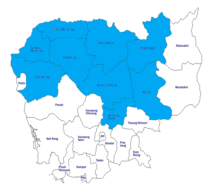
Provinces with more than one project

Mine Clearance: (01/2020-12/2022, CHF 3,530,000). In the past 30 years, Cambodia has cleared over 1,900 km2 of minefields, benefiting approx. 5.6 million people. However, an area of approx.860 km2 is still heavily contaminated. Cambodia aims to be a mine-free country by 2025. The main goal of the Swiss contribution to the project implemented by HALO Trust Cambodia is the clearance of 12.2 km2 of mined areas spread in a long strip of land in north-western Cambodia that will provide safe access to land and livelihood development directly to 25,000 rural households.