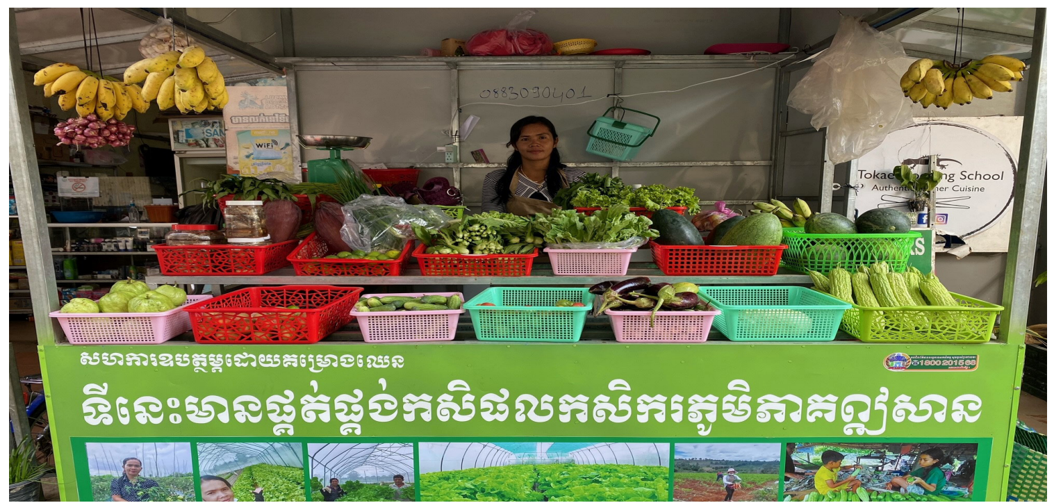
Market stall in Kratie province

Swiss Agency for Development and Cooperation SDC