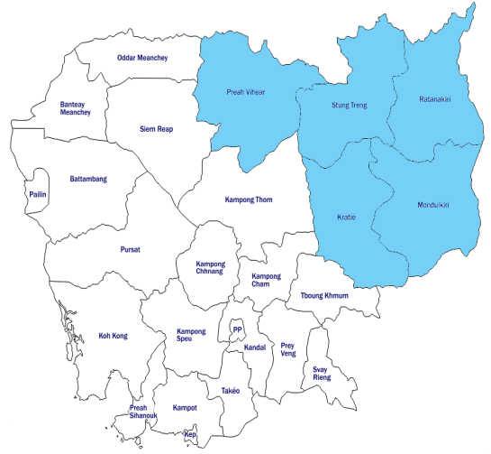
Target provinces highlighted in blue colour

Disadvantaged young people with low-level education and low-skilled workers. Teachers, instructors and management staff of public TVET institutions, personnel of other government institutions as well as owners of small businesses also benefit from the programme. SDP phase II covers the 5 provinces of Preah Vihear, Stung Treng, Kratie, Ratanakiri and Mondulkiri, while some interventions go beyond these provinces.