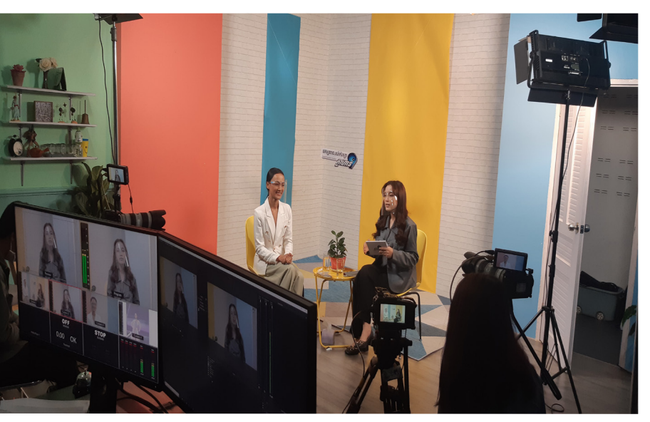
Live video of Klahan9 Roadshow Academy is being streamed on Klahan9 Facebook page, Phnom Penh, Cambodia.