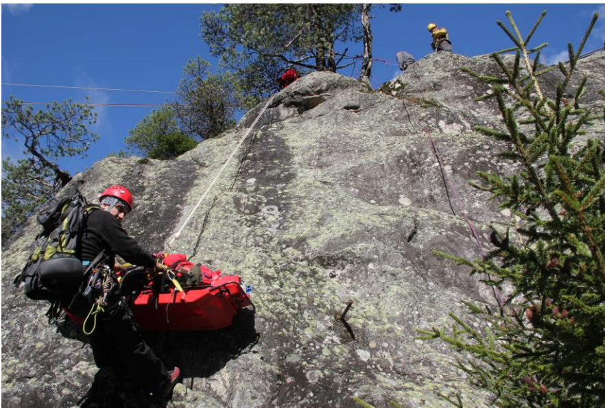
Summer Mountain Rescue Training.

Disasters of different nature and intensity, occurring in Georgia, are recurrent and hinder the country's sustainable development and poverty reduction efforts.