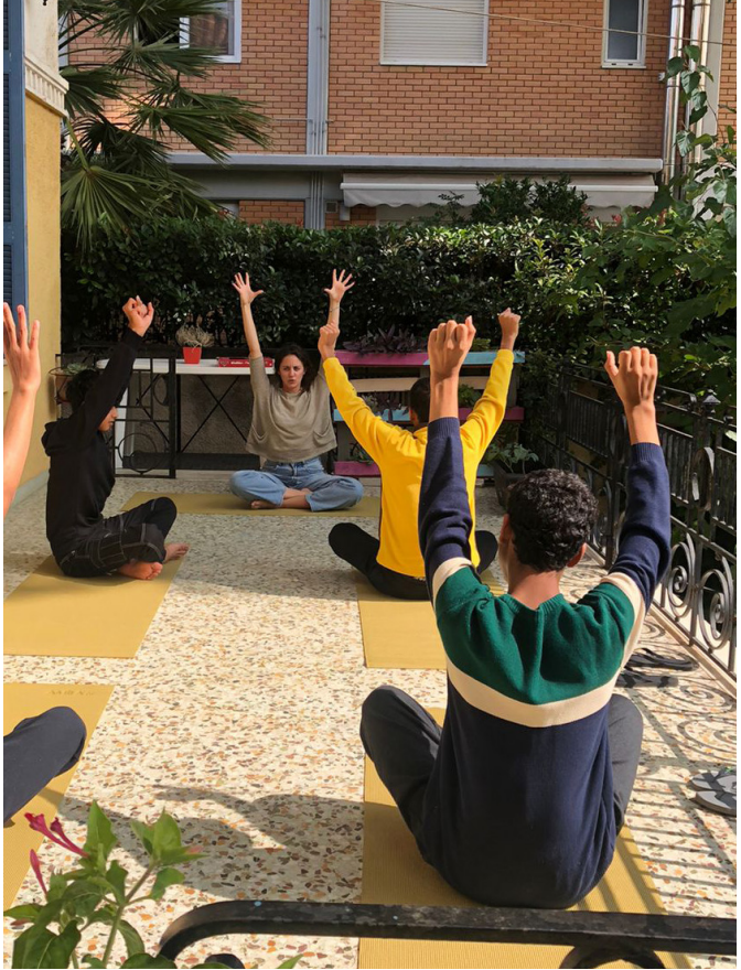
Unaccompanied Migrant Children at the Emergency Accomodation Facility in Chalandri