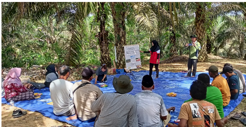
Farmer field school in Bengalon sub-District, East Kutai

Component 2: Establishes a Program Support System to foster a community of practice and facilitate knowledge sharing and learning exchanges across landscapes and intergovernmental agencies at both national and subnational levels.