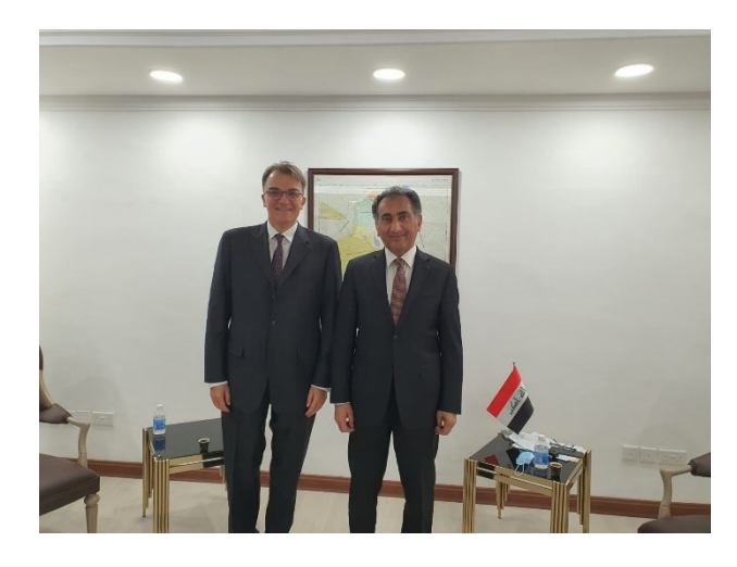
Ambassador Gasser with Senior Deputy Minister of Foreign Affairs Nizar Khairallah

engagement in Iraq, especially in the energy field. The delegation also discussed topics related to migration and camps closures.