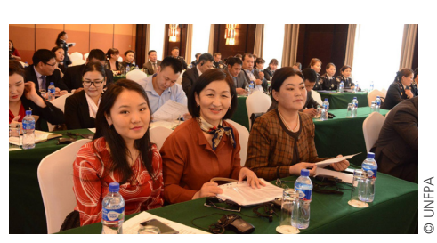
A forum on multi-sector cooperation to respond to domestic violence in Mongolia.

A new partnership was established with the National Emergency Management Agency to effectively respond to emergencies, particularly in meeting the specific needs of women and girls during emergency planning and response. It is known that in humanitarian situations, women and girls are more vulnerable to violence.