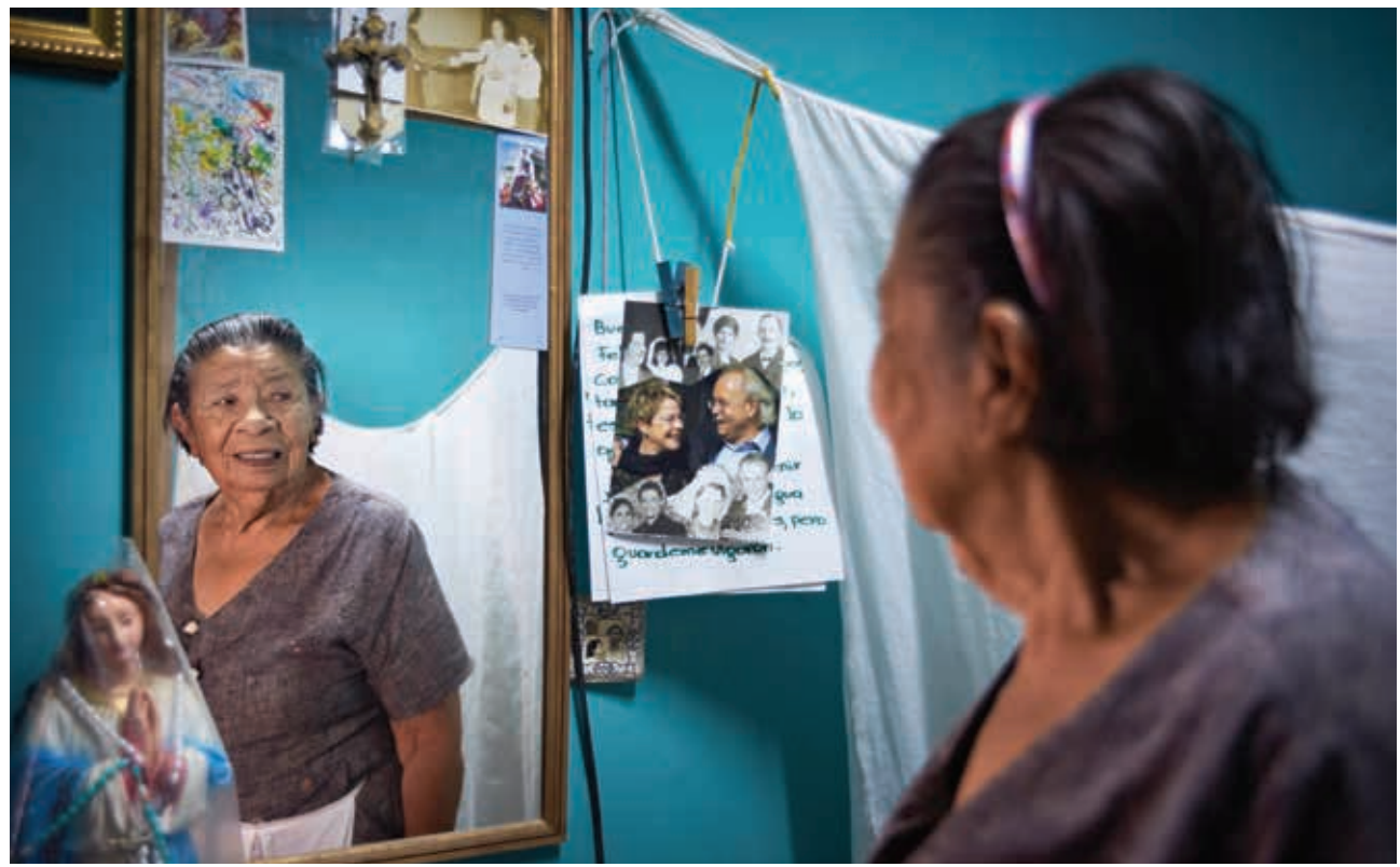
San Marcos, Nicaragua, and Biel/Bienne, Switzerland, have been twinned since 1979. Solidarity has always been a Swiss value.

repaired roads or bridges, and thousands now live in conditions that are more resilient to the constant risk of disasters. Since the 1980s, collaboration with NGOs, institutions and civil society groups has been an integral part of Swiss Cooperation's work. In all these years, Swiss development cooperation has consistently focused on people, their empowerment and their participation in decision-making processes. It has been versatile in addressing the multiple forms of fragility that perpetuate poverty in the region, which required strong new themes, such as good governance, the fight against corruption, the strengthening of the rule of law and the promotion of human rights.