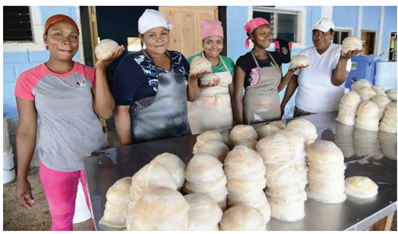
Women in La Moskitia, Honduras, process jellyfish for the market.