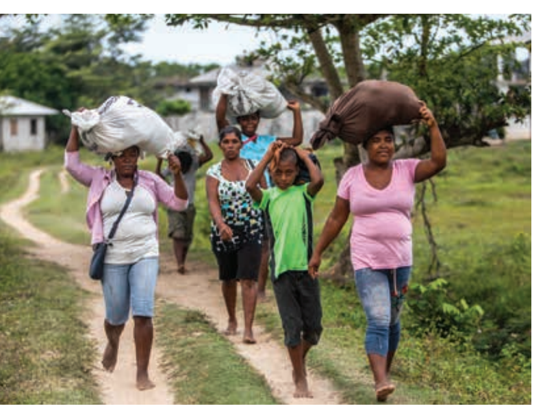
In Honduras, Swiss humanitarian aid focused on delivering food to communities affected by hurricanes Eta and Iota.

The good results achieved by Swiss Cooperation in the 2018-2021 period contrast with the general deterioration of the rule of law and democracy, exacerbated conflict and setbacks in the fight against poverty in the region. The balance of the 2018-2021 Strategy is therefore mixed. Despite the challenging context of these four years, thanks to Swiss Cooperation nearly 125,000 people are better prepared for frequent droughts through improved water resource management and the use of climate change adaptation technologies; 100,000 displaced people have access to safe places for their protection and access to basic services; over 9,000 young people (48 per cent women) have benefited from vocational training to move into the labour market, and hundreds of human rights defenders have benefited from protection. Although work on good governance has faced constraints at regional level, some progress has been made at national and local level. Progress was also made in disaster risk reduction through regional governance strengthened by capacity building in disaster risk reduction for 22,000 people in the region, including 2,500 university teachers and the establishment of an efficient earthquake warning system.