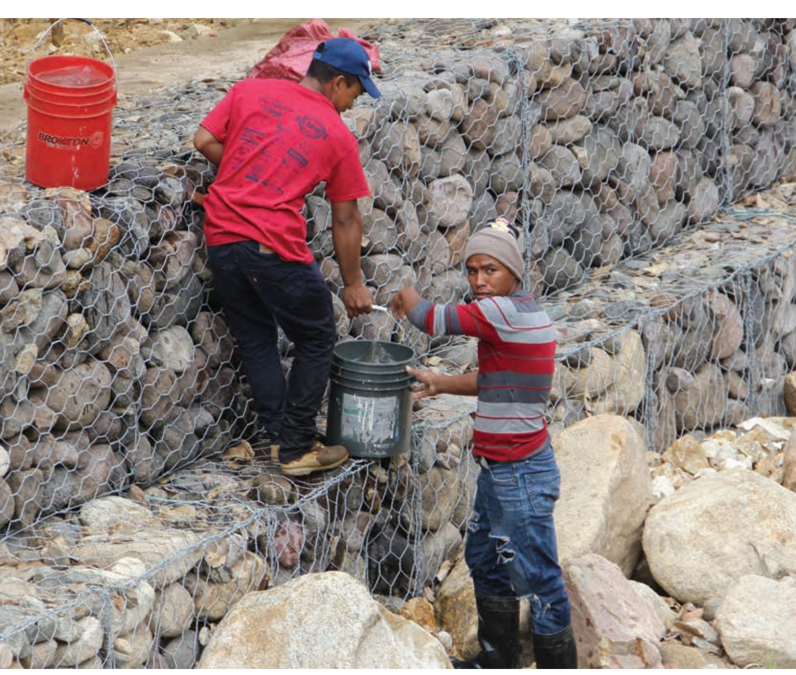
Maintenance works in tributaries of the Dipilto Basin, Nueva Segovia, Nicaragua.