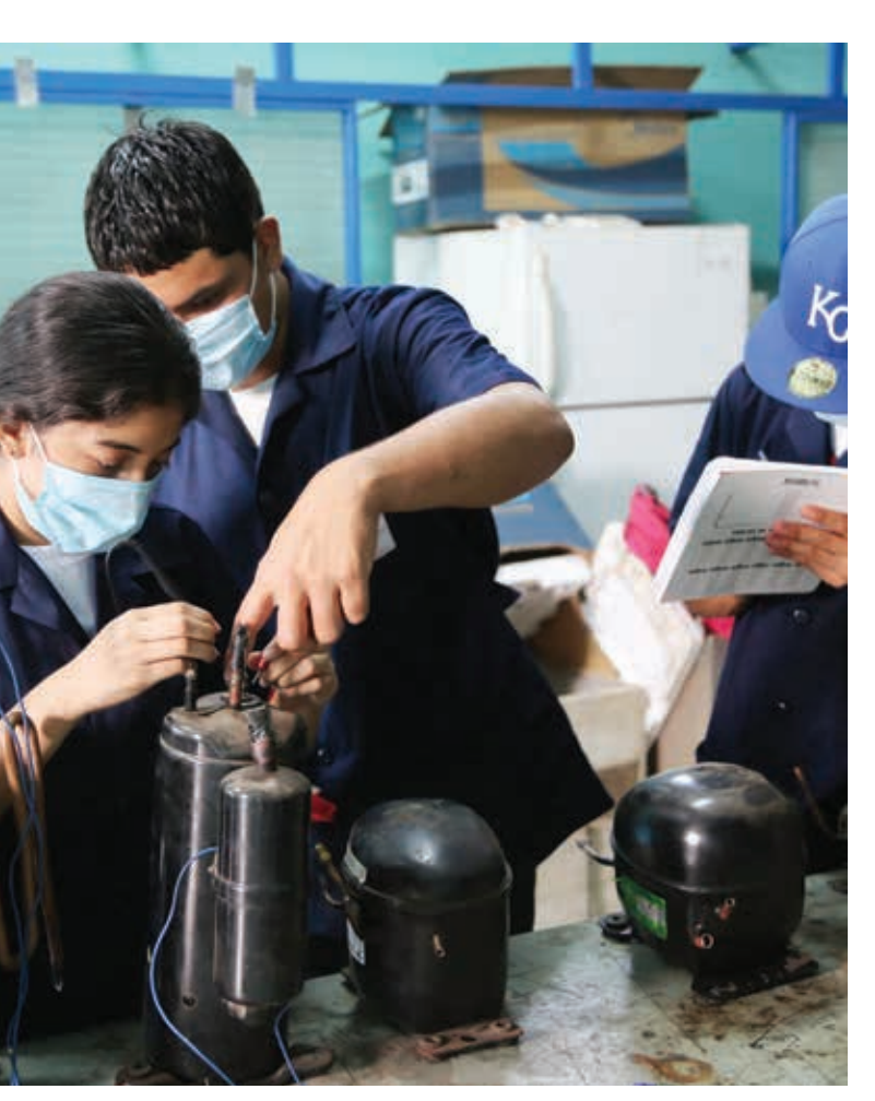
Central American youth are key to the region's development, and therefore they are at the centre of this strategy.

For over four decades, Swiss Cooperation has supported the fight against poverty and helped ensure that no one is left behind in Central American countries by supporting their efforts to tackle obstacles to development. Switzerland's presence is constant and impartial and has a rights- and values-based agenda.