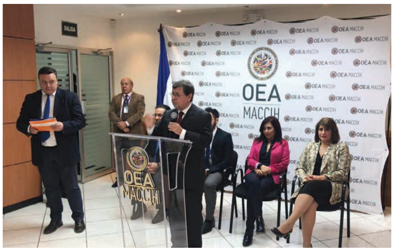
The Support Mission against Corruption and Impunity in Honduras was a mechanism created by agreement between the OAS and the Honduran government, and operated from 2016 to 2020.

there are now 8 million undernourished people, of whom 1.7 million<sup>2</sup> need urgent food aid. Overall, the number of people in humanitarian need has doubled in 2020, totalling some 10 million<sup>3</sup> people in the region. Conflict over property and the use of and access to natural resources has worsened, particularly affecting indigenous peoples living in reserve and water resource protection areas. The region has legislation that favours environmental protection and conservation, but greater political will and institutional response is needed for full compliance with rights-related norms and policies, access to information, participation and justice.