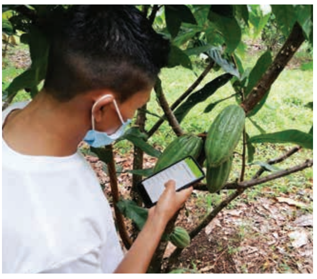
Cacao producers have an app which gives them access to technical assistance and information on the different stages of the crop, and other useful facts.

In sustainable natural resource management, Swiss Cooperation continues to have water governance, climate change adaptation and disaster risk reduction as priorities. It will strengthen partnerships with the United Nations Office for the Coordination of Humanitarian Affairs (OCHA) and the United Nations Office for Disaster Risk Reduction (UNDRR) and multilateral re-