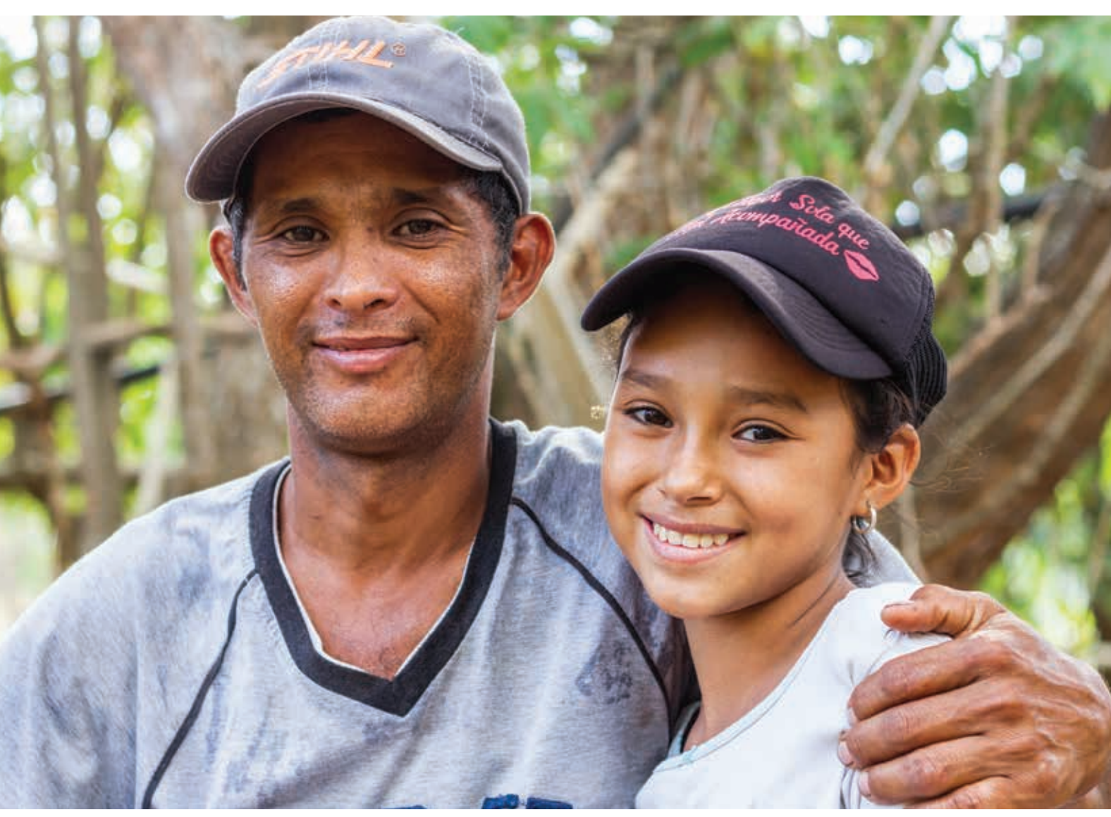
We will continue to work to empower people to make tangible changes in their lives. We are confident that we will live up to our legacy.