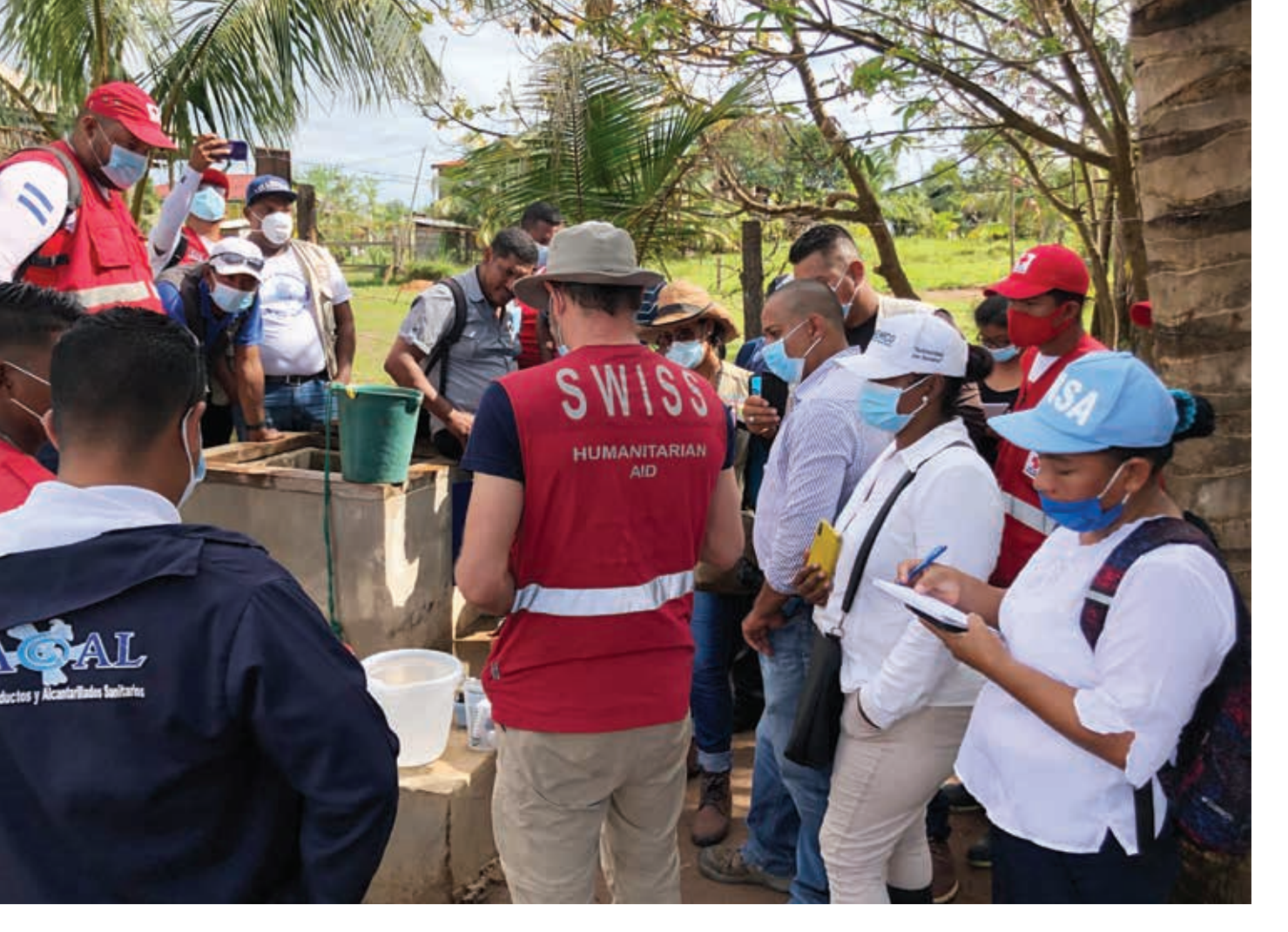
Swiss humanitarian aid is governed by the principles of humanity, neutrality, impartiality and independence. In the photo, water experts provide support after Hurricanes Eta and Iota in Bilwi, Northern Caribbean Coast Autonomous Region, Nicaragua.

In Nicaragua , Switzerland . will focus on contributing to strengthening the multi-stakeholder approach, promoting spaces for private sector and civil society participation in development and poverty reduction. Switzerland will in particular support think tanks that generate analyses and proposals for long-term reforms. Finally, Switzerland will lead a humanitarian policy dialogue and strengthen the coordination and action of the humanitarian organisation ecosystem.