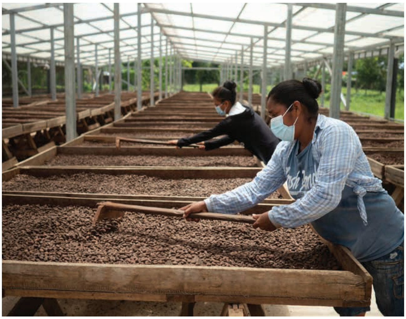
Women are involved in the cacao value chain. Here they are drying and turning cacao pods.

in the last two years and is now profitable. In Honduras, cacao promotion helped create 14,650 jobs. Swiss Cooperation consolidated a regional cocoa information and knowledge management platform, which contributes to national and regional public policies.