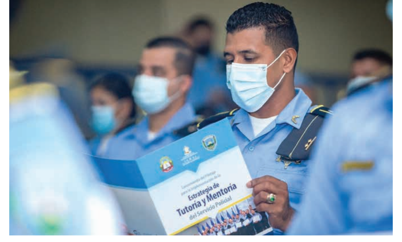
The police forces in Honduras receive support to increase their institutional integrity, implementing the principles of meritocracy and adopting ethical values based on respect for human rights.

successful Swiss experiences, leverage funds and scale up effects. This includes trilateral/south-south cooperation in order to consolidate, sustain or scale up the impacts of an initiative. It aims to collaborate with NGOs, town-twinning partnerships and other Swiss development agencies to create synergies and multiplier effects. In particular, it is strengthening cooperation with Swiss NGOs in disaster preparedness<sup>12</sup>.