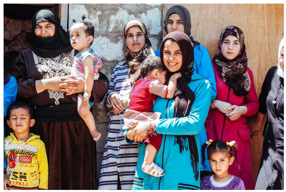
Abou Hassan's house in Akroum Village hosting 70 refugees in Lebanon