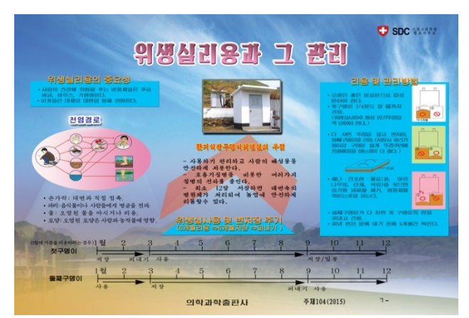
Hygiene promotion poster explaining the use and advantage of double pit latrines

WASH infrastructure in the DPRK has deteriorated since the early 90s, when rural and semi-urban dwellings had piped water supply and sewerage systems. Being at the end of its lifetime, much of this infrastructure does not work anymore or malfunctions. With the failure of sanitation infrastructure, diarrhoea is the number one cause of morbidity and mortality for children under five.