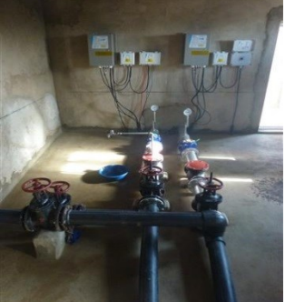
Solar power pump system Soksan Ri, North Hwanghae Province, 2017

Targeting 10,000 households and 80 social institutions (schools, health centres, children homes, etc.), the focus is on construction of water supplies in the rural areas, either through gravity-fed or solar-pumped systems, and encompasses the required sanitation infrastructure combined with hygiene promotion. In addition, the operation & maintenance of WASH services of 13 previously completed WASH projects is continuously monitored to achieve sustainability of impact.