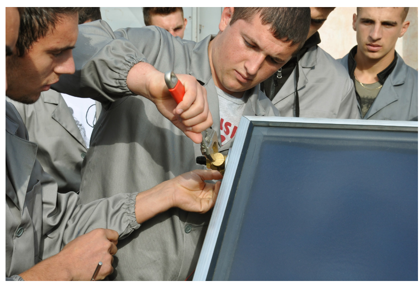
Students in thermo-hydraulics, Albania (2014)

The Swiss Agency for Development and Cooperation (SDC) implements Vocational Education and Training (VET) projects in the Western Balkans. These projects have the purpose of meeting the salient need to increase youth employment during the transition from centrally planned systems to modern market economies. With the collapse of the solid public enterprises from earlier times, public vocational schools have lost their traditional partners for workshop-based training and have not been able to meet the requirements of the private sector. In this context, the SDC has applied the success factors of the Swiss VET system as an effective approach to improving the relevance and performance of the VET systems.