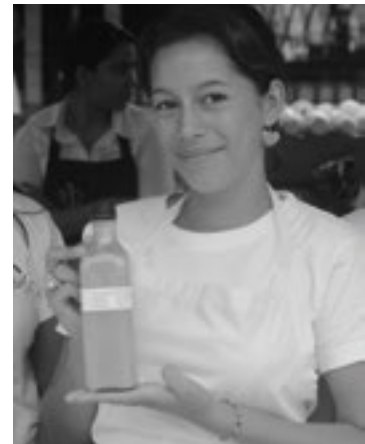
Vocational Education and Training Program

Switzerland is well recognized for its work in strengthening local governments and citizen participation, both in general aspects of public management and in the water and sanitation sector. Experiences with decentralized budget support are promising. Municipal government capacities have improved and their financial management is increasingly trustworthy, although with great variations. Overall, decentralization in both Honduras and Nicaragua is progressing. On this background, the Swiss program will move stepwise and in a differentiated way, taking into account capacities and risks, towards municipal budget support for local investments including water and sanitation and services related to the care economy. Technical assistance