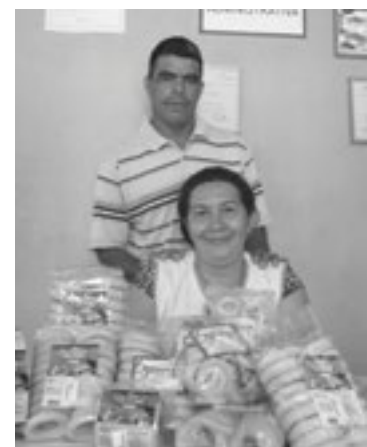
Small and Medium Rural Enterprises Program

The Central America strategy 2013-17 will comprise a mix of geographically defined programs (context sensitive interventions) and thematically defined bi-national or regional programs. Within countries, greater geographic concentration will be sought by clustering interventions in selected territories or sub-regions.