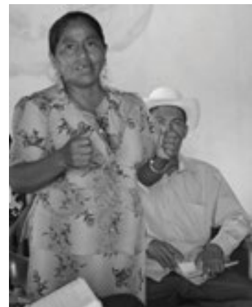
Local Governance Program

In Honduras, military rule ended in 1982 and gave way to a formal democracy with four year government cycles, no possibility of presidential re-election and with the peculiarity of public primary elections the year prior to the general elections. This means that attention is given to party politics and campaigning half the time affecting policy continuity and governance. Moreover, the lack of an effective civil service both at the central government and municipal levels results in a high staff turnover driven by political considerations and clientelism, draining the already weak institutional capacities. The coup d’Etat in 2009, when the Supreme Court ordered the removal of president Zelaya deeply divided the country and raised tensions and political conflictivity. Donors put aid on hold, many diplomatic relations were suspended or downgraded, leaving the country in political isolation.