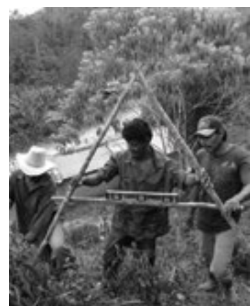
Disaster Risk Reduction Program