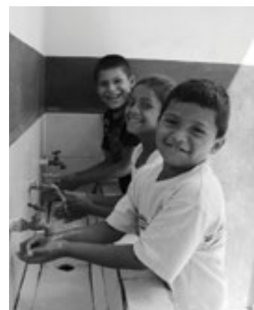
Small towns and Schools Program