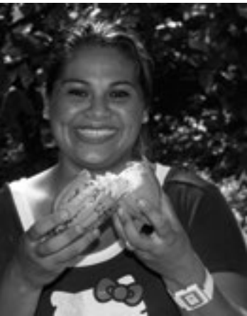
Local Governance Program

for strengthening capacities and facilitating continued innovation and learning will be provided.