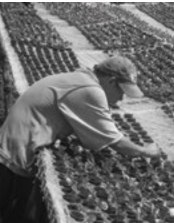
Agricultural Technology Market Program

Project evaluations and the recent qualitative self-assessment showed that the thematic priorities were relevant. The annual results reporting showed that results achieved were generally satisfactory in all three thematic areas of intervention, particularly at country levels. Although strategically important and relevant for facilitating regional knowledge management, results of programs with regional counterpart institutions were less satisfactory.