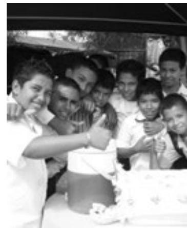
Local Governance Program

Central America is a region prone to natural disasters including hurricanes, floods, droughts and earthquakes. The high environmental vulnerability will be further exacerbated by the effects of climate change. Nicaragua and Honduras rank as number three and four in the global climate change risk index. This means more droughts, water shortage and crop failure in the drier, poorer regions. It also means a higher frequency and intensity of natural disasters (hurricanes, flooding, landslides). Poor people living in marginal rural areas and depending on agricultural production or living in precarious urban settlements will be affected disproportionately. The main challenge is adaptation to climate change. Goals of reducing environmental vulnerability are included in the national development plans in Nicaragua and Honduras. Specific climate change policies and plans exist, but implementation capacity, integration in public policies and budgets are still quite limited. Central America is not an important emitter of greenhouse gases, but Nicaragua and Honduras in particular have a great potential to reduce emissions related to inappropriate land management (deforestation, livestock, slash and burn practices) and to secure financing for the costly adaptation.