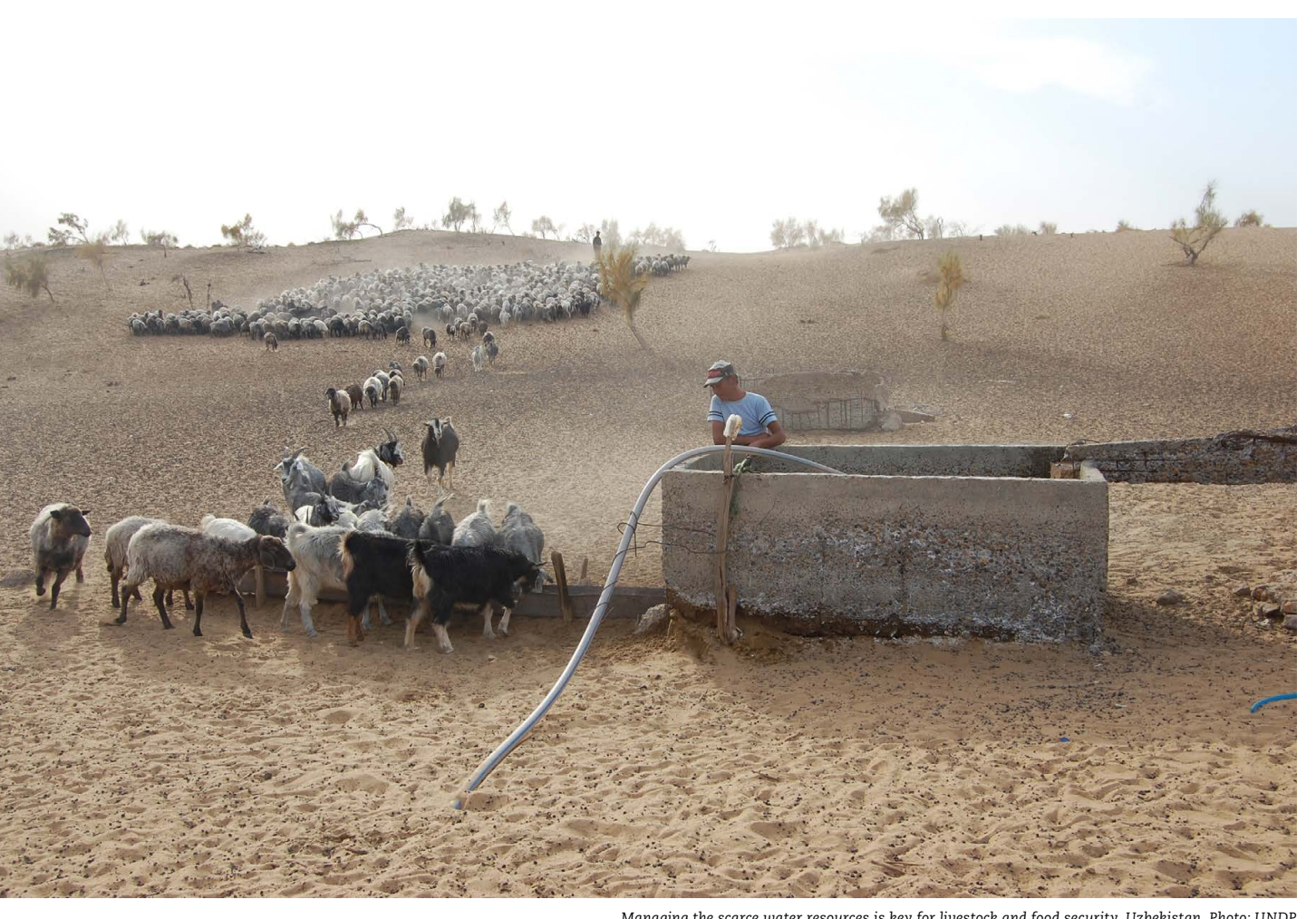
Managing\ the\ scarce\ water\ resources\ is\ key\ for\ livestock\ and\ food\ security,\ Uzbekistan,\ Photo:\ UNDP