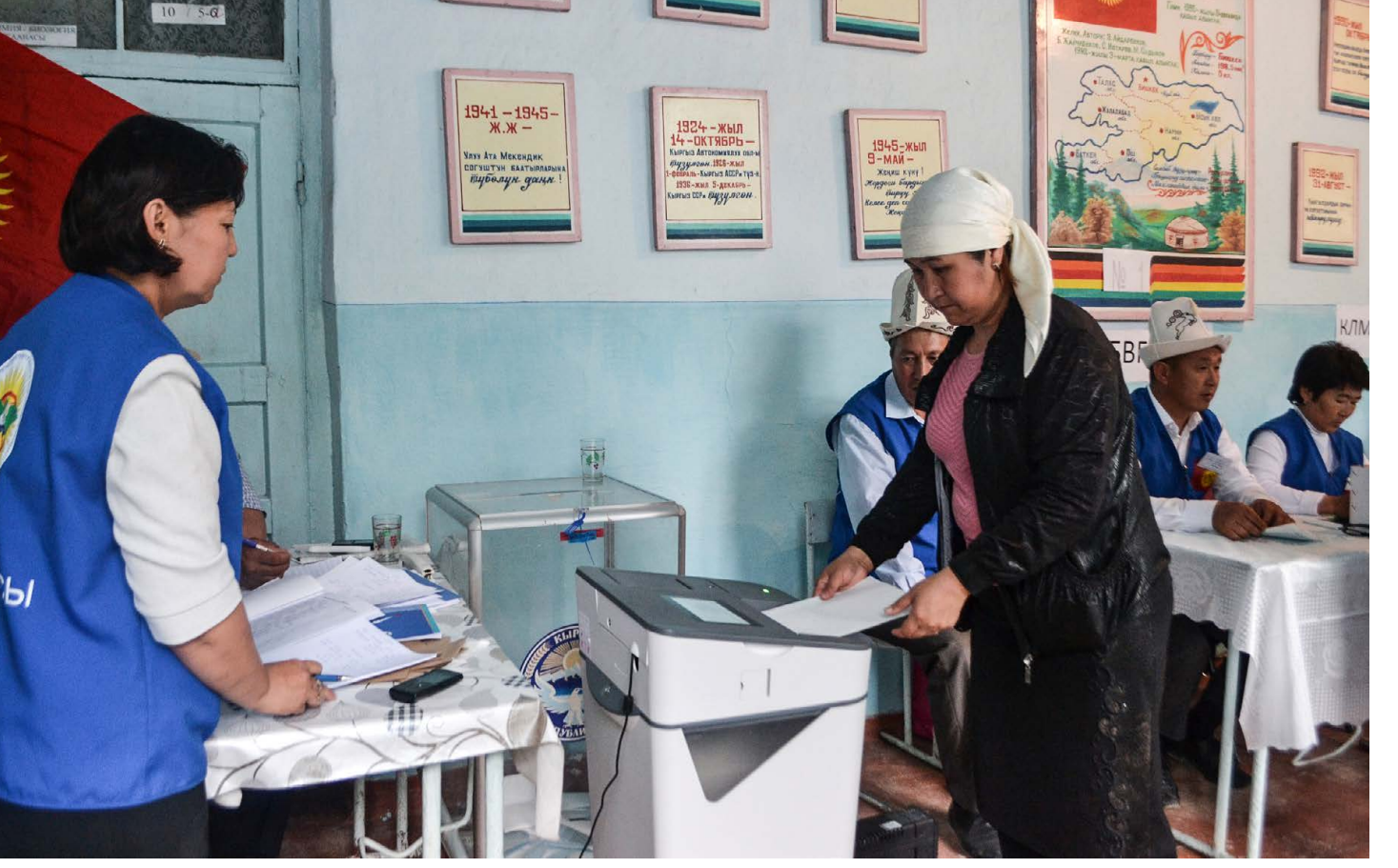
People are voting in parliamentary elections, Kyrgyzstan.