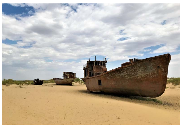
Ship wrecks in the dried up Aral Sea, Uzbekistan

The combination of a regional approach and bilateral interventions will offer an opportunity for the required flexibility in a dynamic and changing environment and underscores the requirement to 'think regionally, act locally'. The regional approach consists of four sub-approaches: 1) Regional action to solve regional problems; this currently refers mainly to the Blue Peace Initiative; 2) Cross-border programmatic activities; where Switzerland is ready to support such interventions if requested by the countries; 3) Multi-country programming, i.e. working on the same topic in different countries; this is already being done in a number of areas, e.g. in supporting country-level interventions for integrated water resource management and for the provision of quality public infrastructure services as well as in helping MSMEs provide access to jobs and income opportunities; and 4) Regional exchanges and knowledge management; whereas this sub-approach is already developed in the water, infrastructure and climate change (WICC) portfolio and culture programme, its application to other areas of interventions will be promoted and tested, and Swiss government entities engaged in Central Asia together with involved partners will coordinate their regional efforts more closely to increase impact and learn from each other.