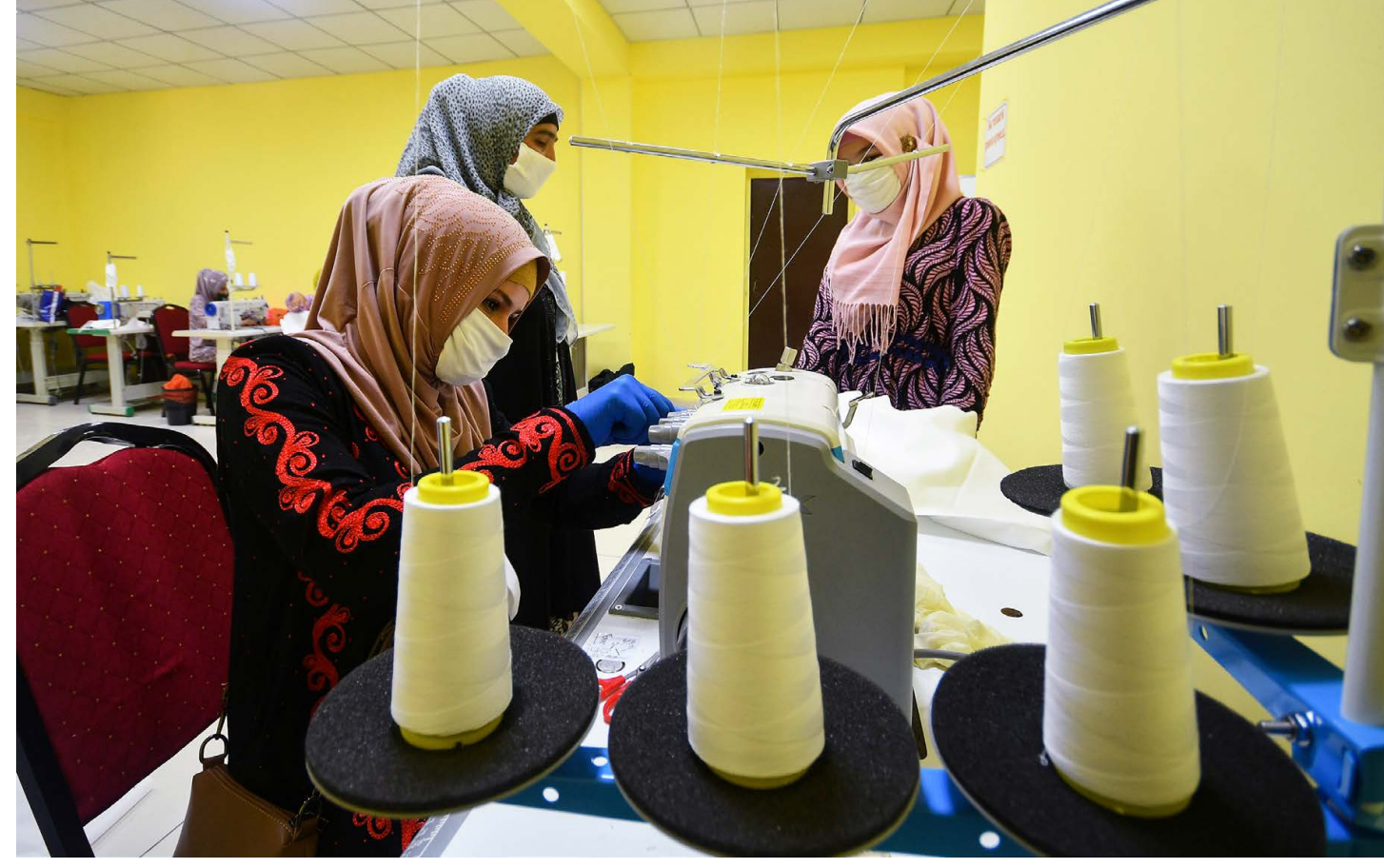
Women sewing textiles in their sewing factory.