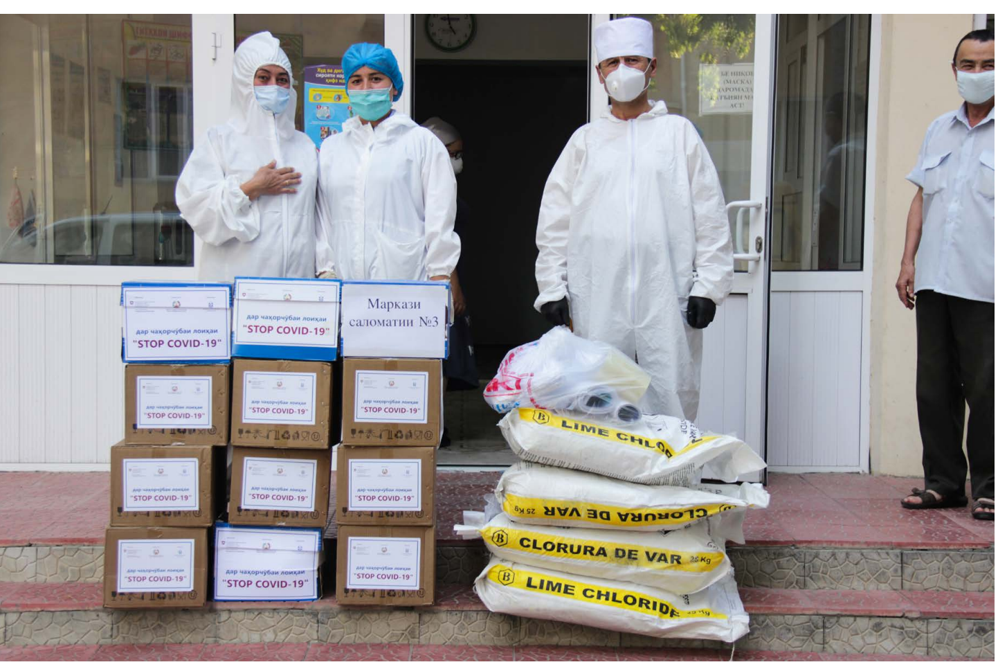
Local hospitals have received help in response to Covid-19, Sugd, Tajikistan, Photo: International Secretariat for Water