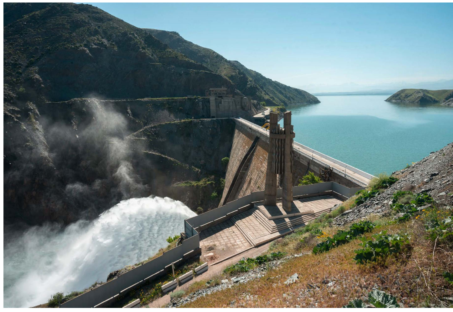
The Kirov reservoir, the water dam in west of Talas province, Kyrgyzstan.

A key lesson learned at regional level is that there is a need for better understanding of the regional political economy in the water sector with its underlying power and interest mechanisms, including the divergence between formal and the actual governance. Values governing the water agreements at various levels have not been sufficiently investigated.