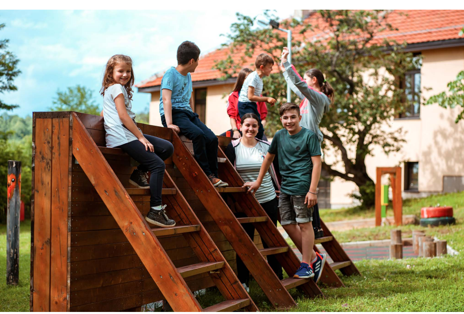
Education Center for Nature Conservation in Negrevo.

governance, rule of law and regional development. In economic development, where there are only few development partners, Switzerland works alongside the EU, the World Bank, the European Bank for Reconstruction and Development (EBRD), USAID and the United Kingdom. It stands out through a strong emphasis on VET and private sector engagement, including some successful cases of diaspora engagement. In the field of environment and public utility services, Switzerland is the second-largest grant donor after the EU.<sup>6</sup> Its technical assistance and capacity building for national and local stakeholders are highly appreciated.