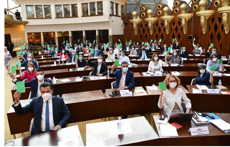
Assembly of the Republic of North Macedonia.

The overall goal of Swiss cooperation is to support North Macedonia to build a socially inclusive democracy and market economy, while ensuring sound natural resources governance and resilience to climate change. Swiss cooperation focuses on areas where national priorities and Switzerland's Strategy for International Cooperation 2021–24 align, and where Switzerland adds value.