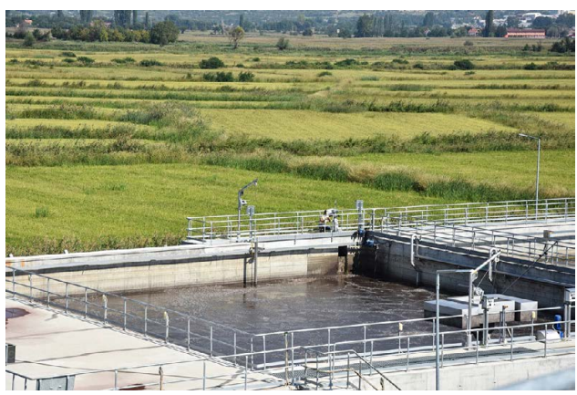
Kocani Waste Water Treatment Plant.

Sustainable and inclusive public utility services, improved natural resources management and enhanced community resilience to natural hazards will reduce disparities, increase the attractiveness and competitiveness of urban and rural areas, and contribute to steady economic growth and enhanced quality of life.