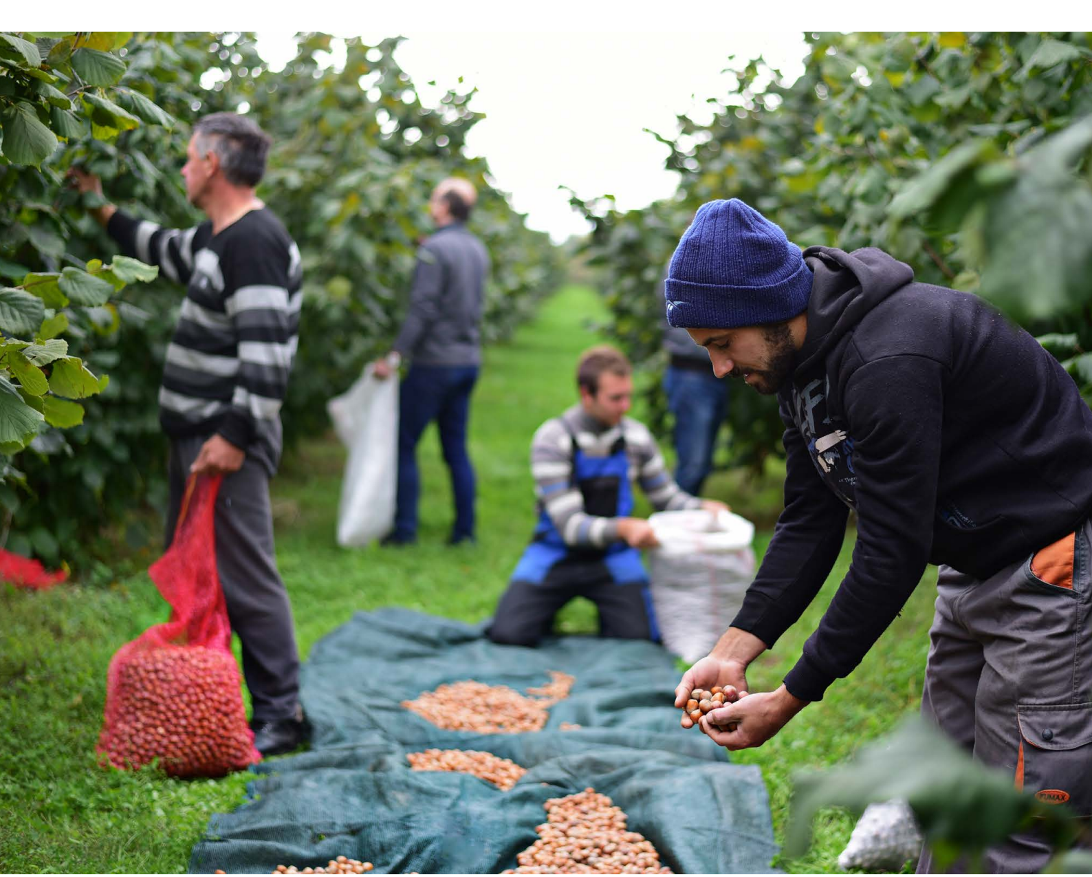
Organic hazelnut production exporting to European markets.