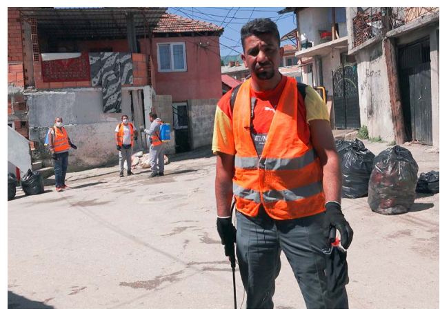
Work integration for recipients of minimum income and low qualifications.

Youth (36%), Roma (49%) and people living with disabilities are particularly vulnerable to unemployment. The labour force participation of women is significantly lower than that of men, and North Macedonia's ranking in the Global Gender Gap Index is slipping.<sup>3</sup> Although poverty reduction and social inclusion have been high on the government's agenda, the effects of measures such as a guaranteed minimum income are yet to be seen. The relative poverty rate has remained stable at 21.9%; poverty is more prevalent in rural areas (30%).