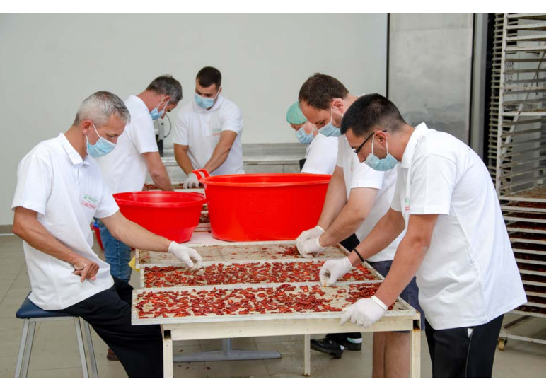
Centre for work-oriented rehabilitation of persons with disabilities in Strumica.

Switzerland's engagement in the Western Balkan region was initiated in the 1990s. Underpinned by its geographic proximity, close ties have been formed between the Swiss government and people of North Macedonia and other Western Balkan countries. As a non-EU/non-NATO member, Switzerland is considered an independent partner and honest broker. In 2018, Switzerland contributed CHF157.5m to development cooperation, human security and peacekeeping in Albania, Bosnia and Herzegovina, North Macedonia, Serbia and Kosovo. A sizeable diaspora of around 500,000 people from the region have made Switzerland their home.