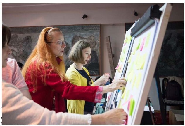
Promoting gender responsive policies and budgeting.

Risks emanating from climate change, environmental degradation and natural hazards significantly influence the resilience of systems and communities. Switzerland systematically assesses whether projects/programmes are impacted by these risks and considers mitigation and adaptation measures in the design of its activities<sup>12</sup>.