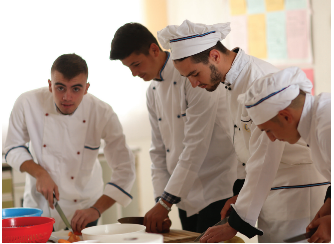
Vocational hospitality and tourism students in Vlora, south Albania.

During 2014-2017, Switzerland supported macro-economic stability, private sector development and youth employment. At the macro-level, with Swiss support, the Ministry of Finance built a macro-economic forecast model for evidence-based policymaking. The Bank of Albania improved its capacity for monetary policy formulation, which has contributed to a gradual return of inflation towards its target value. New software helps the Albanian government to better manage and report on its public debt.