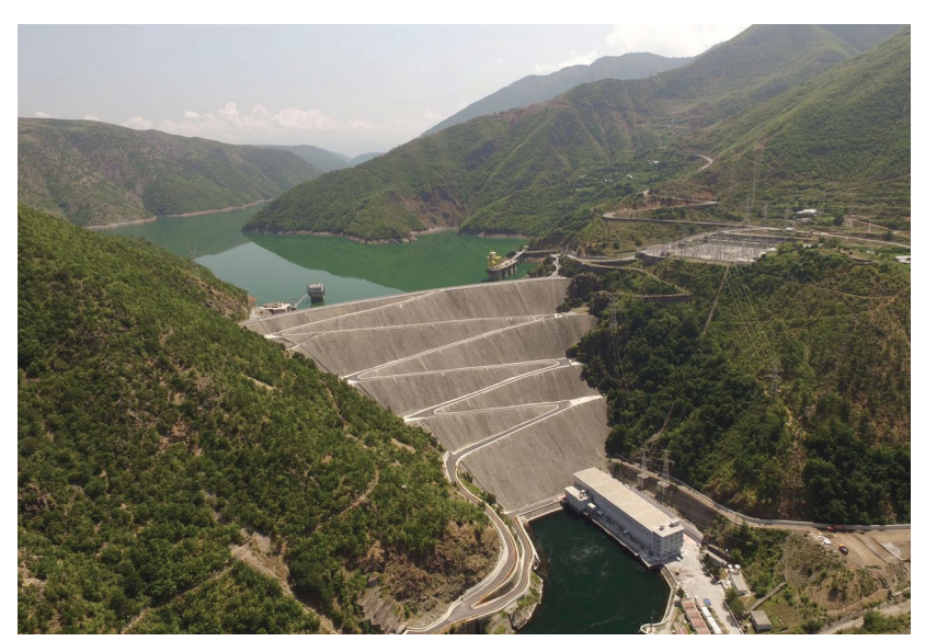
Fierza hydropower dam over river Drin, north Albania.

Recent energy sector reforms have been a great success. Albania ranked 25th among 127 countries in the 2017 Global Energy Architecture Performance Index Report, outperforming all other South-East European countries. Progress in the development of the gas sector and especially the construction of the Trans Adriatic Pipeline (TAP) are significant for economic growth and future energy diversification. The TAP is a strategic investment that connects Albania with European gas networks, thus fostering Albania's position as reliable partner in the European economy. However, energy supply is likely to remain at risk owing to a vulnerability to droughts, the slow diversification of energy resources and a weak financial performance. Low energy efficiency offers considerable potential for improvement.