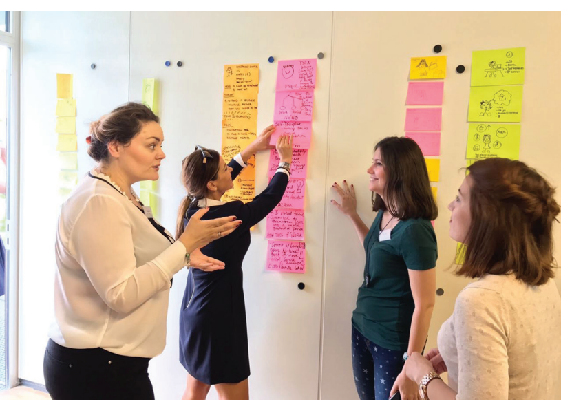
Discussions and group work during a workshop.

Resources: Total planned commitments for 2018-2021 are CHF 105 million. Democratic governance is the largest domain in monetary terms (CHF 38 million); health is the smallest (CHF 12 million). Compared to the 2014-2017 strategy, funding for democratic governance (+46%), economic development and employment (+41%) and health (+20%) will increase, while there will be a slight reduction in funding for urban infrastructure and energy (-8%). The increase in SDC funding for VET is in line with the Federal Dispatch on International Cooperation. Annex 4 provides detailed information for 2018-2021 compared to 2014-2017.<sup>9</sup>