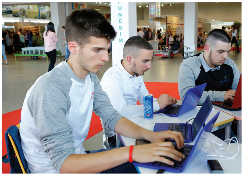
IT students at the vocational school 'Pavarësia' in Vlora.

The overall goal of the Swiss Cooperation Strategy 2018-2021 is to contribute to a functioning democracy, improved public services and an inclusive, competitive market economy in support of Albania's European integration.