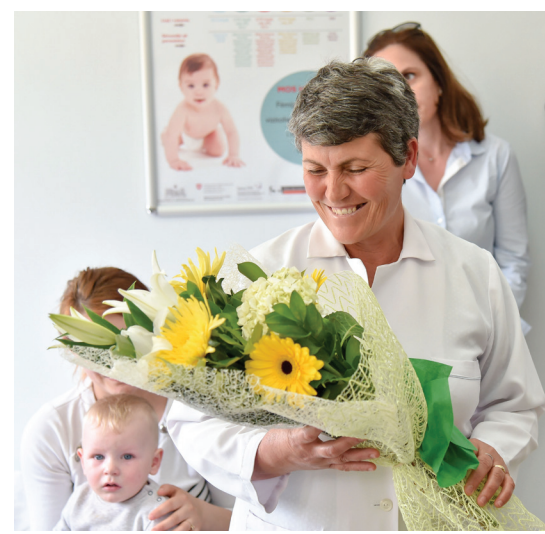
Nurses at a renovated health centre in south Albania.

Switzerland has supported the Albanian health sector since the 90s and since 2013 with an emphasis on primary healthcare. Contributions have led to a series of initiatives and innovations to improve the health system at local and national levels. Swiss expertise considerably supported and influenced the newly-approved national health promotion policy and action plan and contributed to the National