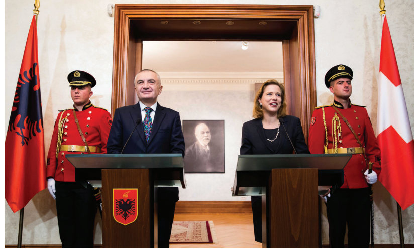
High level exchanges between Switzerland and Albania have intensified.

Cooperation with Eastern Europe is an integral component of Swiss foreign policy and foreign economic policy. Switzerland supports former communist countries in Eastern Europe - their governments and civil societies alike - on their paths to democracy and social market economies. Switzerland's transition assistance in the region is founded on mutual interest in inclusive socio-economic development, stability, security and European integration. It is underpinned by Switzerland's solidarity with the poor and excluded, and respect for human rights. Despite obvious progress, a backlog of reforms remains in areas such as decentralisation. rule of law. economic development and public services. Furthermore, transition assistance opens up economic opportunities for Switzerland.