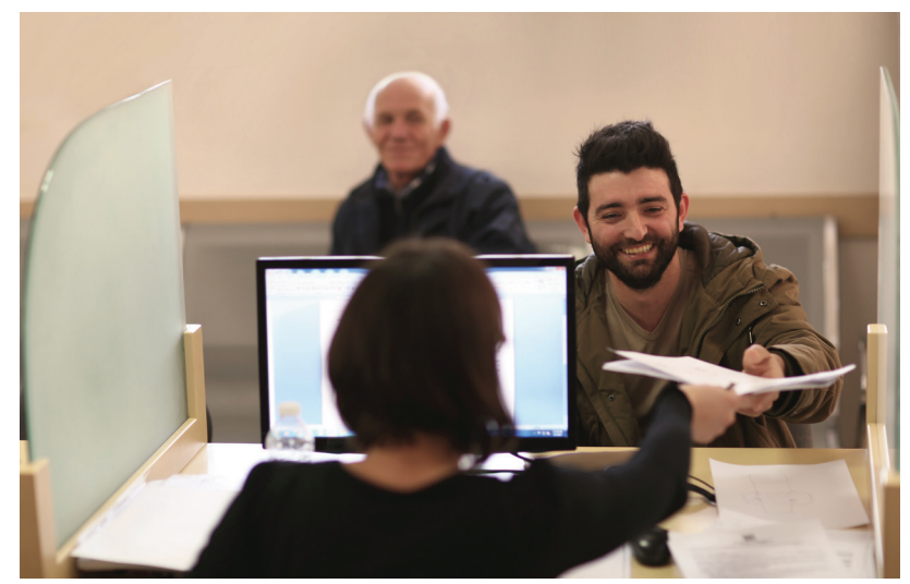
Citizens receiving services at newly built municipal one-stop-shop.

In light of pending far-reaching reforms on Albania's path to European integration, Switzerland will intensify its engagement in and support for participatory policy dialogue, building on its strong track record and credibility.