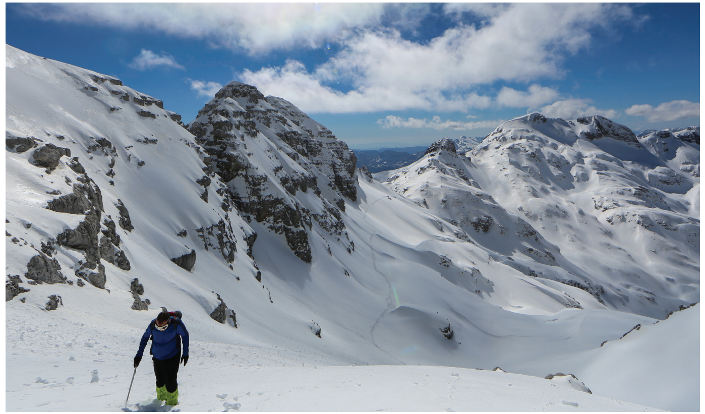
An increasing number of tourists visit Albania's mountainous areas.

Albania graduated to upper middle-income status in 2009 but remains one of the poorest nations in Europe. In the economic development and employment domain, Switzerland will enable sustainable and inclusive growth and employment by simultaneously fostering macro-economic stability, facilitating job and income creation, and developing market-oriented skills. The Swiss programme will help to strengthen economic governance by supporting key national public finance institutions to improve PFM and financial sector regulation and supervision. It will address the challenges of the private sector, especially those in agriculture, IT and tourism, and - in view of a consistently high unemployment rate among young people - strengthen its focus on labour market oriented vocational education and training (VET).