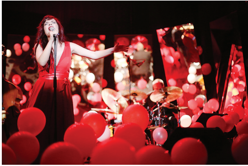
Swiss-Albanian singer Elina Duni in concert in Tirana.

Transversal themes: Switzerland will apply a governance and gender-sensitive approach in all of the aforementioned domains in alignment with SDC and SECO guidelines for transversal themes. As regards the integration of governance, Switzerland will address corruption and promote anti-corruption measures – e.g. as part of VET, health sector reforms and the corporate development of public utilities. It will pursue different aspects of inclusion (social, economic and political) through a programmatic approach.