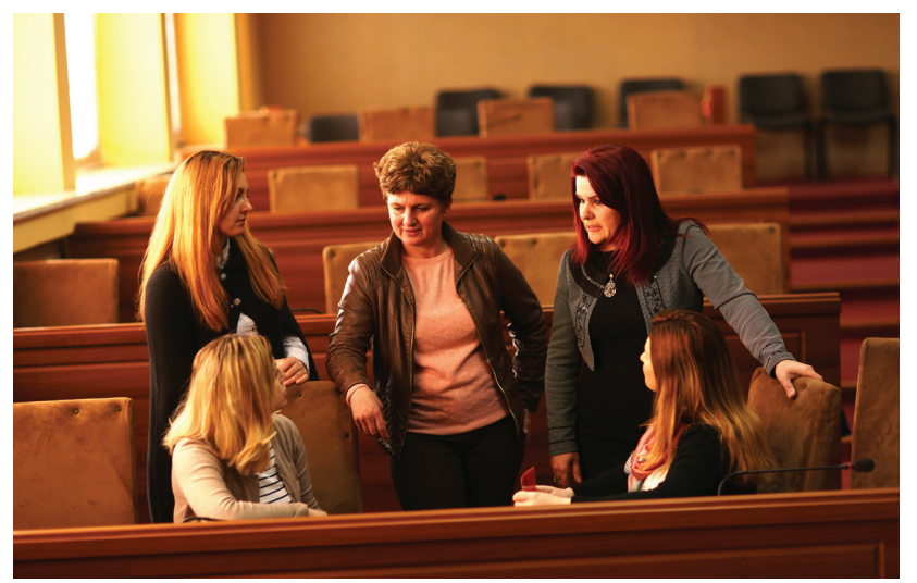
Women politicians from north Albania supported by the Swiss decentralisation programme.

Switzerland has promoted civil society actions in Albania, especially in relation to the functioning of local government. Swiss-supported civil society stakeholders and media successfully mobilised citizen