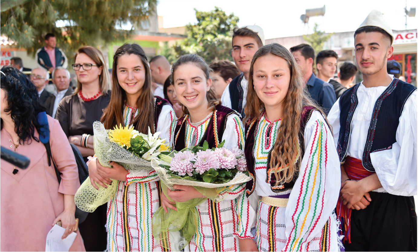
Young people participate at an event in Cakran, Fier, south Albania.