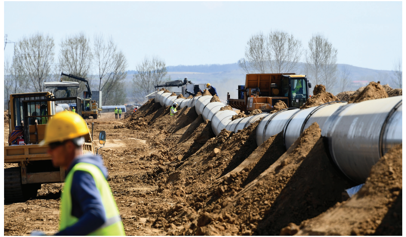
Trans Adriatic Pipeline installation works underway 100 km south of Tirana.

Lessons learnt: Over the last two decades, Switzerland has contributed substantially to the development of Albania's energy supply system including dam safety. To continue leveraging its experience and good reputation in this sector, Swiss engagement will shift to energy demand by improving energy efficiency.