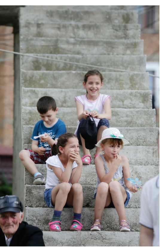
Children near the town square in Has, north Albania.

There is a common consensus regarding the need to implement sensitive judicial reforms and to tackle widespread corruption and organised crime. However, resistance from those profiting from the status quo is undermining the reform process and could delay the start of EU accession negotiations. Cannabis cultivation and drug trafficking pose major