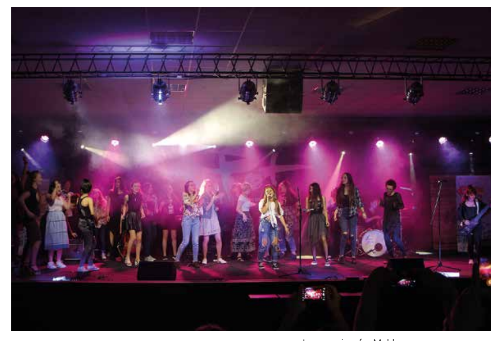
In a premiere for Moldova, the SDC-supported summer school uniting girls and music professionals from all regions of Moldova produced five new allgirl rock bands and staged an amazing rock concert.

During the implementation of the CS 2014–2017, SDC has made increasing efforts to address issues related to diversity and inclusiveness through its small actions and culture program. As a result, Switzerland has become recognized as a promoter of unity in diversity and achieved significant visibility in this regards amongst the government, civil society and international community.