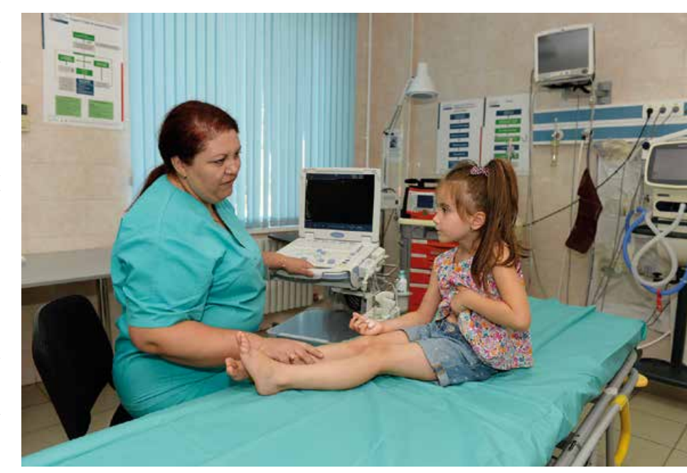
A girl examined by a medical specialist in the Emergency Department of the Municipal Hospital in Cahul city, southern Moldova, one of the three regional paediatric emergency centres in Moldova set-up with SDC support.

of an increasing number of young people, parents and community members in health promotion. Progress has also been registered in the area of steering and governance. The Ministry of Health, Labor and Social Protection (MoHLSP) is moving towards more evidence-based decision-making, enabling a more efficient resource allocation and more effective policy implementation. Policy influencing activities contributed to the approval of the Law on Tobacco Control and the decision to restructure the outdated public health services. SDC, for the first time, entered into a large-scale engagement in the Transnistrian Region. In close cooperation with Moldovan authorities and the de-facto authorities of the region, perinatology services were modernized and regionalized, improving the access of pregnant women to quality care. A particular focus of interventions lay on fostering exchanges between professionals of both river banks, with a view to building confidence between the Moldovan and Transnistrian sides.