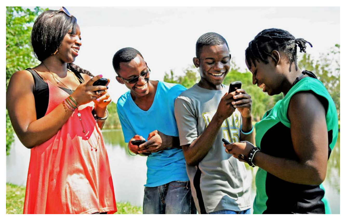
Youth and technology for health, Zimbabwe.

If, through the GPH's policy and programmatic work, health systems are of better quality, and if key determinants of health are effectively addressed (such as malnutrition and environmental pollution), and if specific needs of disadvantaged people, such as women, young people and migrants are considered, and if governance mechanisms for global health are more inclusive, efficient and effective, then the health and well-being of disadvantaged people in low and lower-middle income countries can be improved and protected. This is because the drivers of inequity, such as gender, socioeconomic status, educational level or age are targeted in all components.