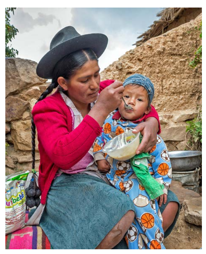
Nutrition campaign, Bolivia.