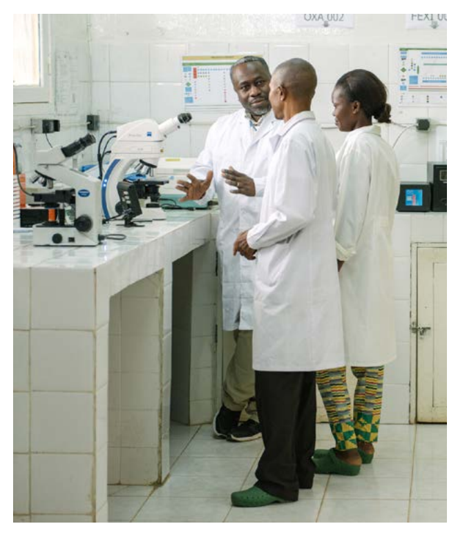
Strengthening research in endemic countries, Democratic Republic of Congo.