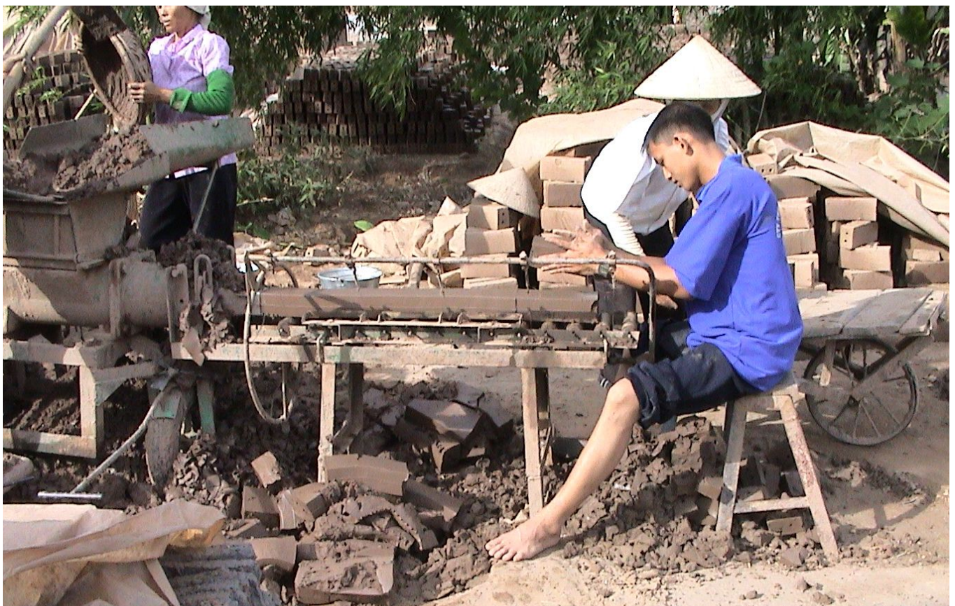
Selective mechanization: mechanical extruders have replaced hand-moulding of bricks and have been introduced almost everywhere in the Vietnamese brick industry. This makes work easier and produces better bricks.

Much attention was paid to improving the flue gas systems and to eliminating all toxic gases on the Vertical Shaft Brick Kiln (VSBK, see below) that could lead to health hazards for the workers. Double air ducts for flue gas collection to the chimney were introduced to allow minimal flue gas releases on the top of the VSBK.