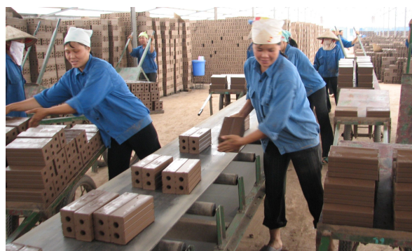
Mechanized Bricks-production in Nam Dinh Province, Vietnam