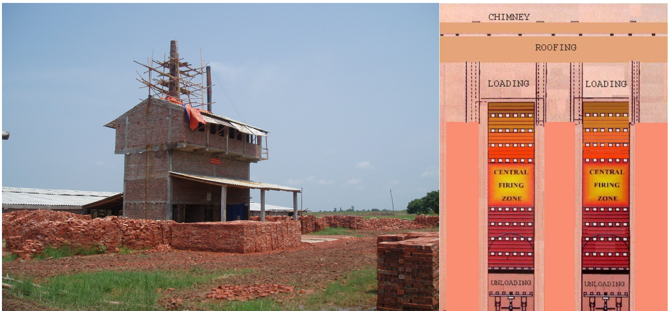
Model VSBK enterprise (left) and drawing (right) of how a VSBK functions. It can be compared to a vertical-shaft tunnel kiln where the bricks slowly glide down the shaft. The VSBK is the most energy efficient of all brick kilns.

So far, some 300 VSBKs with over 600 shafts have been introduced in Vietnam, and the soon forthcoming phasing-out deadline for traditional kilns may boost their dissemination further. Some 10,000 kilns may potentially be replaced by VSBKs.