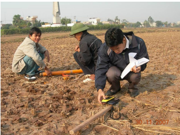
Mapping of clay deposits in Nam Dinh

The clay of the Red-River delta contains high amounts of fluoride; and the coal, high amounts of sulphur. This combination led to highly toxic flue gases that damaged the surrounding crops. A relatively simple and cheap solution was to add limestone to the green bricks in order to neutralize the SO 2 and fluorine of the flue gases.