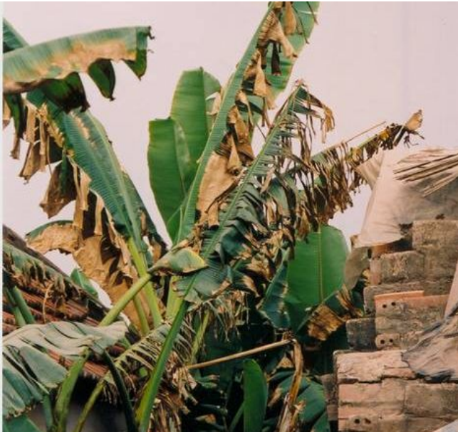
Banana crop damaged by toxic flue gases

Several important improvements to the local environment were able to be achieved: