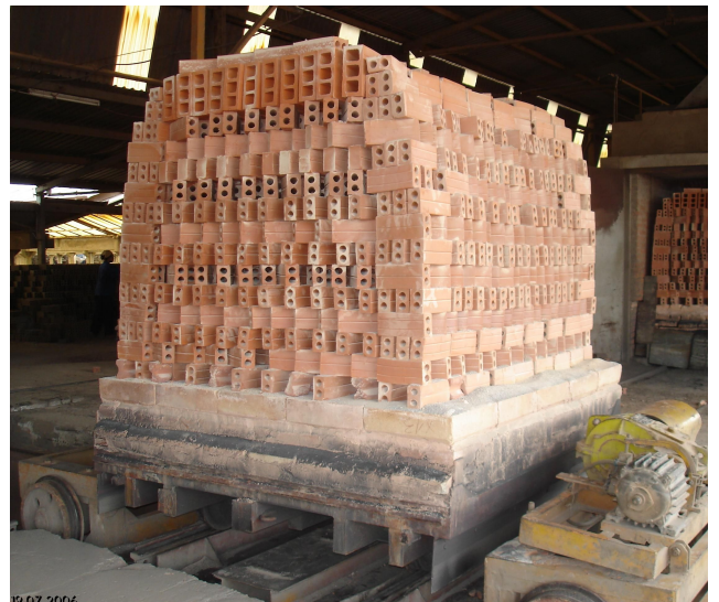
The bricks pass through the tunnel kiln on such carts. These carts need to withstand up to 1,000 °C in the firing zone.

In Nam Dinh alone, more than 25 of these low-cost tunnel kilns are already in operation. Brick prices are very high at the moment due to high demand and increased coal prices; this makes the brick business very attractive. The lower investment costs also allow the private sector to operate these tunnel kilns, while Western tunnel kilns would require state-owned enterprises.