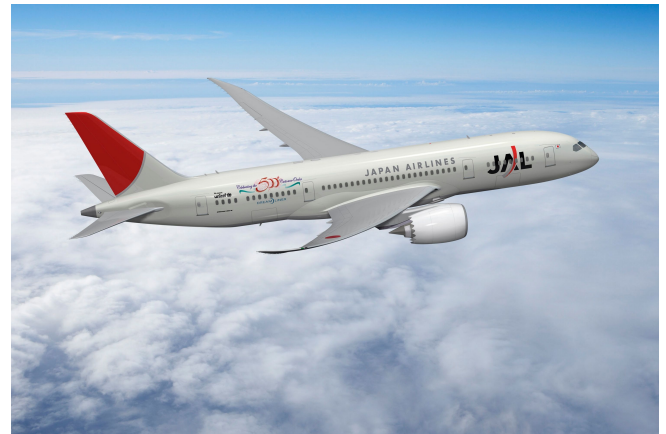
One VSBK compensates in one year CO 2 emissions to the tune of a full Airbus flight Europe – Vietnam.

But an even higher impact on energy conservation may be the result of using hollow bricks with better insulation properties: it is estimated that a wall made of hollow bricks saves some 5% of the electricity spent on air-conditioning.