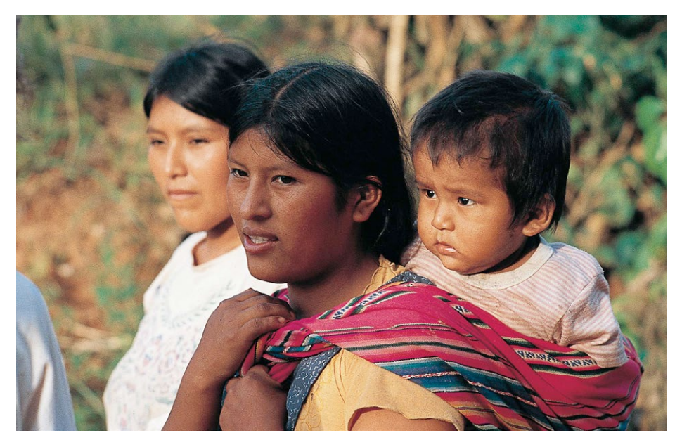
More democracy: decentralisation programmes promote the political participation of women.

The active participation of women and gender balance became commonplace. "We are aware that empowerment and democratisation can only come from civil society organisations if the participation and balanced representation of women are guaranteed", says a popular participation promoter. The fact that wherever they went, PADEM teams were always mixed sent a powerful message. Men and women formed a tandem known as "chacha-warmi" in the Aymara culture.