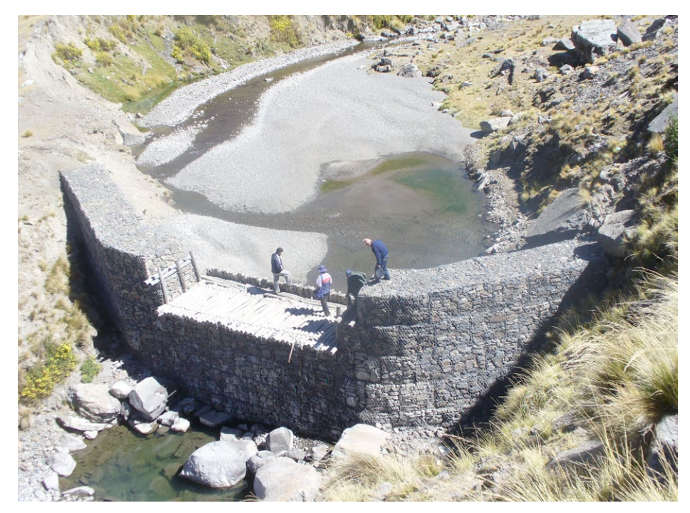
Protective dam: between 2000 and 2006, newly empowered municipalities shouldered around 46% of national expenditure on infrastructure.

Independent evaluations point to a series of positive results, such as an improvement in the quality of the education and health system in the municipalities. The ability of local authorities to negotiate with the central government in La Paz has also been strengthened. Citizens have become increasingly aware of their rights and responsibilities – a phenomenon that has promoted the burgeoning of an active citizenry. Local institutions have been strengthened and democratic rules have been established to regulate access to power. Today, most mayors in rural areas are farmers or indigenous people. The popular demand for "ojotas al poder" (power to the sandals) is being fulfilled.