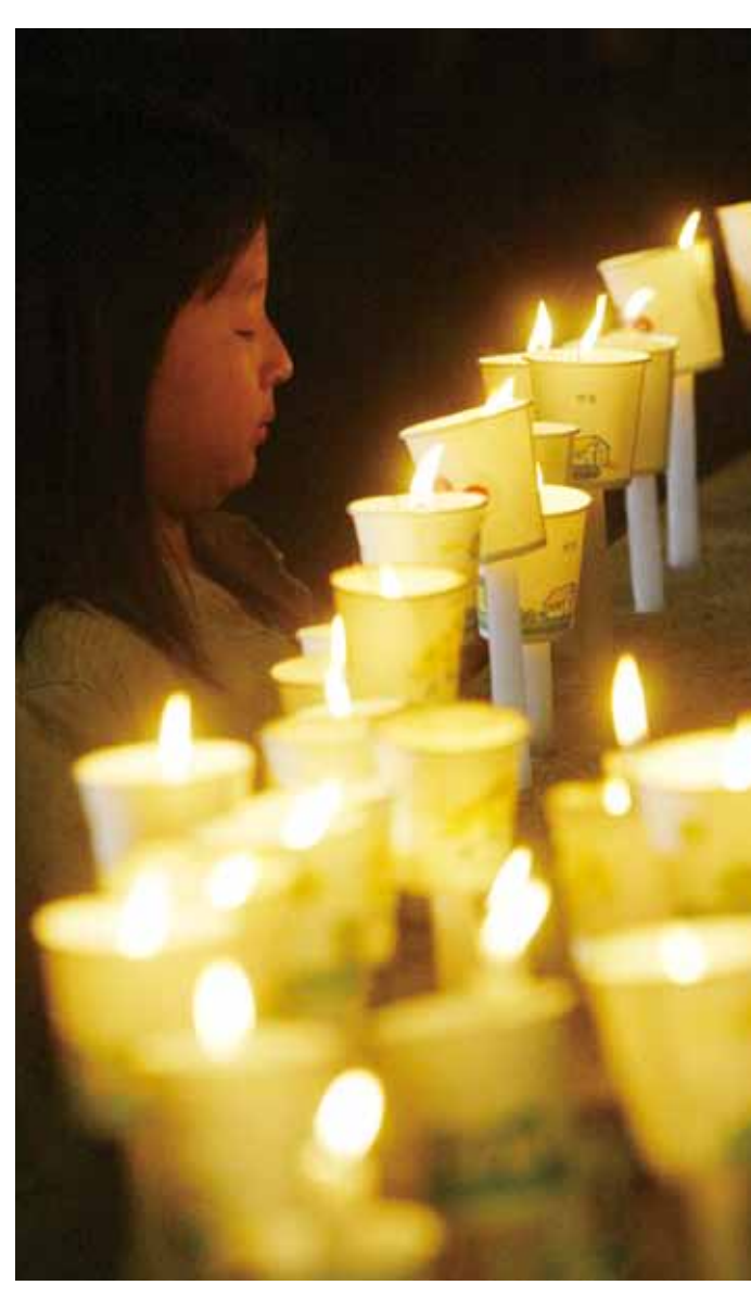
Citizens praying for her quick recovery after the knife attack, May 21, 2006