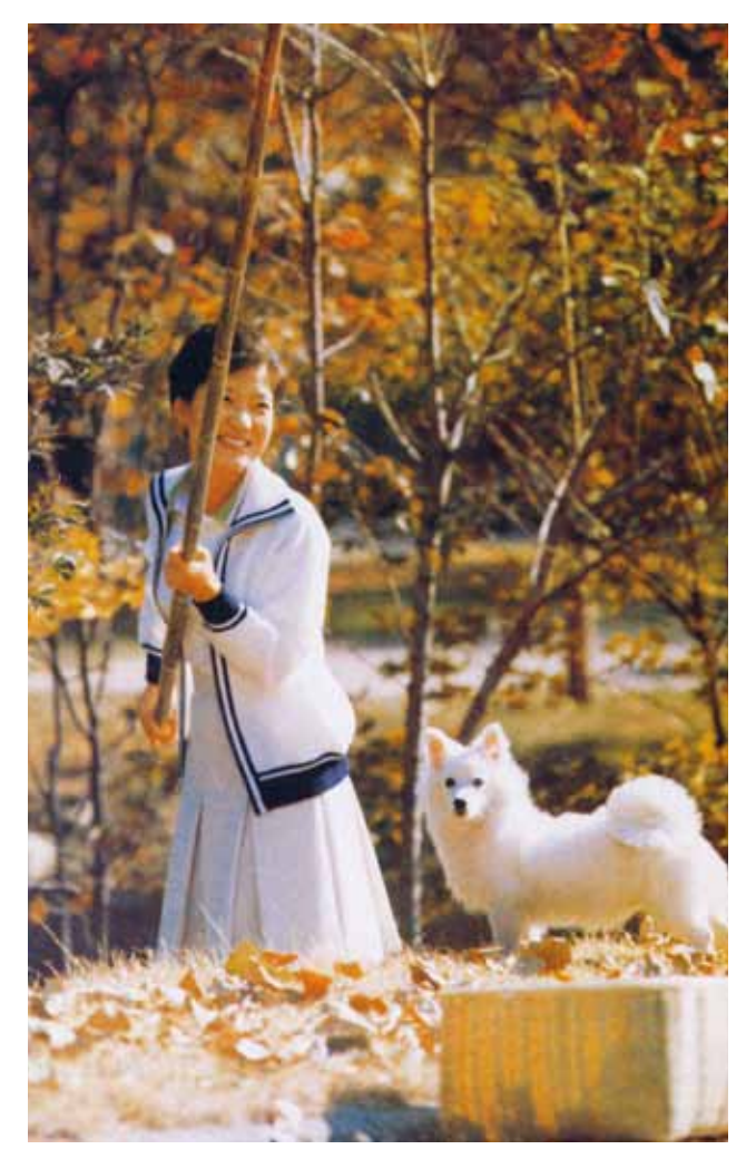
With her dog Banguli, October, 1972

Korea's national health insurance system continued to expand, and in its twelfth year it became a universal health insurance scheme covering the entire population. It is now regarded as one of the most successful national health insurance systems in the world.