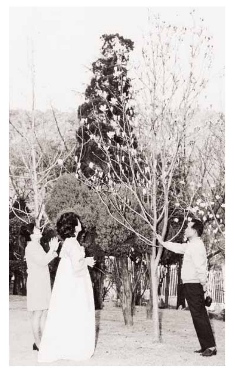
Looking at magnolias with her parents

Park Geun-hye received the news in the early hours of the morning on October 27. Her first words were, "Is everything alright on the border?" Her father's death was not just a personal loss, it was also a national crisis that could tip the balance at the Demilitarized Zone at any minute.