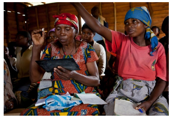
Women learn to read and write and are informed about their rights.

The SDC addresses the medical, psychosocial and integration aspects of victims' problems. An enduring response to sexual and gender-based violence in the Great Lakes region requires not only efforts at the community level (including with the men) and strengthening of the healthcare system, but also and especially a firm political commitment by the states concerned to combat impunity and systematically prosecute the perpetrators of these crimes.