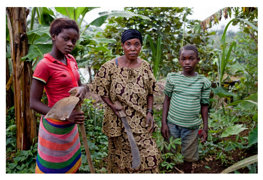
The status of women is one of the topics of the sensitization workshops

Cost : About CHF 3 million p.a. Duration : 2011–2017 Contact: dsf@eda.admin.ch