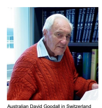
to undergo assisted suicide

sovo and the multicultural composition of the Swiss national team were also the subject of debate. Links were at times made with tensions associated with national identity issues currently circulating in Europe. Although the Serbian press voiced harsh criticism of the behaviour of these players, the media in other countries explained it by the heavily-charged emotional context during the match and the attitudes of certain supporters. The understanding expressed by Federal Councillors Ignazio Cassis and Guy Parmelin was also reported in some media outlets. The media reporting ended by focusing on the fine imposed by FIFA on the players concerned.