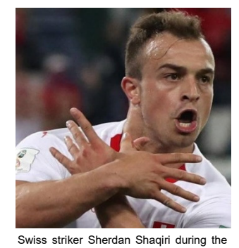
Swiss striker Sherdan Shaqiri during the Switzerland-Serbia World Cup match