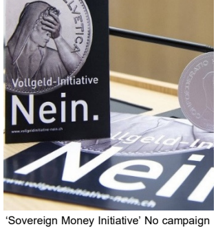
'Sovereign Money Initiative' No campaign

debate – complex but nonetheless essential – had relevance beyond the country's borders. There was also speculation about how big an impact such a measure would have had if the initiative had been accepted. The outcome of the vote prompted a lively response especially in the British and the German-language media, which saw the relevance of the situation in their countries and the European Union. Overall, the outcome of the vote was presented from a neutral perspective.