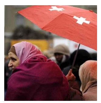
The contrast between the lifestyles of the host country and the country of origin