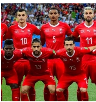
Debate about dual citizens in the Swiss national football team