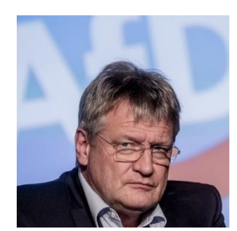
AfD leader Jörg Meuthen under pressure owing to dubious donations from Switzerland