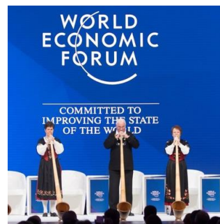
Alphorn players at the WEF opening ceremony

assistance that was approved by the Zurich public prosecutor's office. Although attention was concentrated on AfD representatives and not primarily on Switzerland, ongoing media interest resulted in Switzerland being associated with illegal political campaign support and funds of dubious origin.