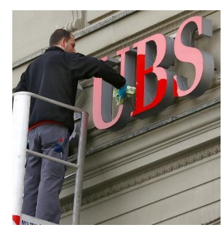
A gamble in France could cost UBS dear