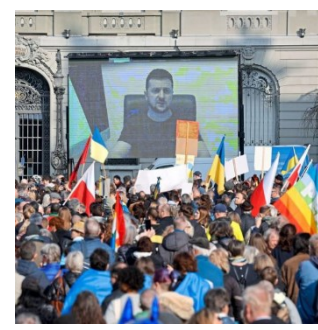
Ukrainian President Zelenskiy joined a rally in Bern virtually

an automatic exchange of information with many countries particularly prone to corruption.