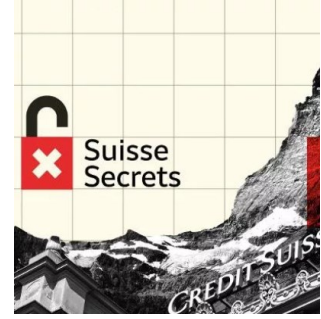
Reports published by the media outlets involved in the 'Suisse Secrets' investigations were presented in a standardised format