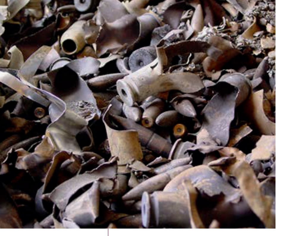
Albania Destroyed small arms ammunition

the Wassenaar Arrangement as well as the ATT, and takes the lead with regard to the implementation and ongoing development of the ATT. SECO also provides technical support to countries in implementing the ATT, and specifically in establishing national measures for import and export controls.