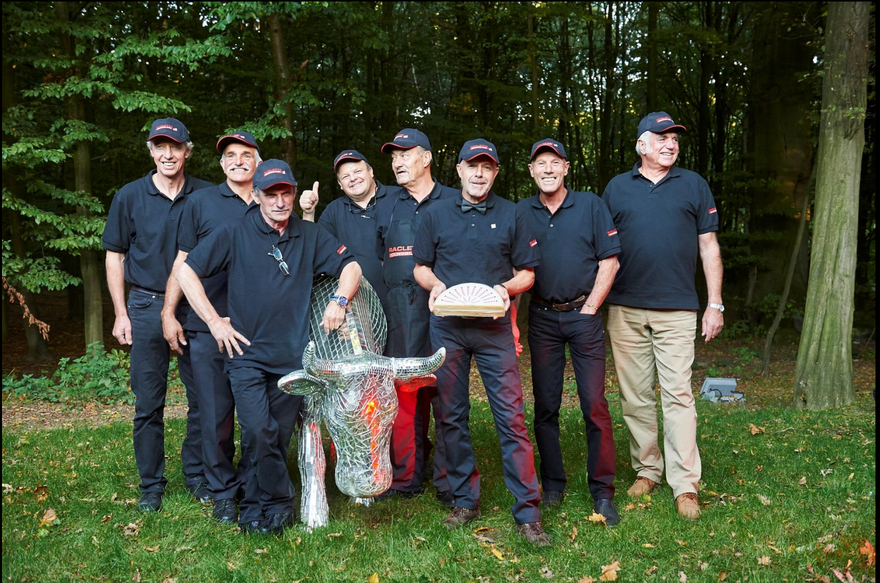
8 racleurs joined from the Canton du Valais to serve our guests the best Swiss raclette