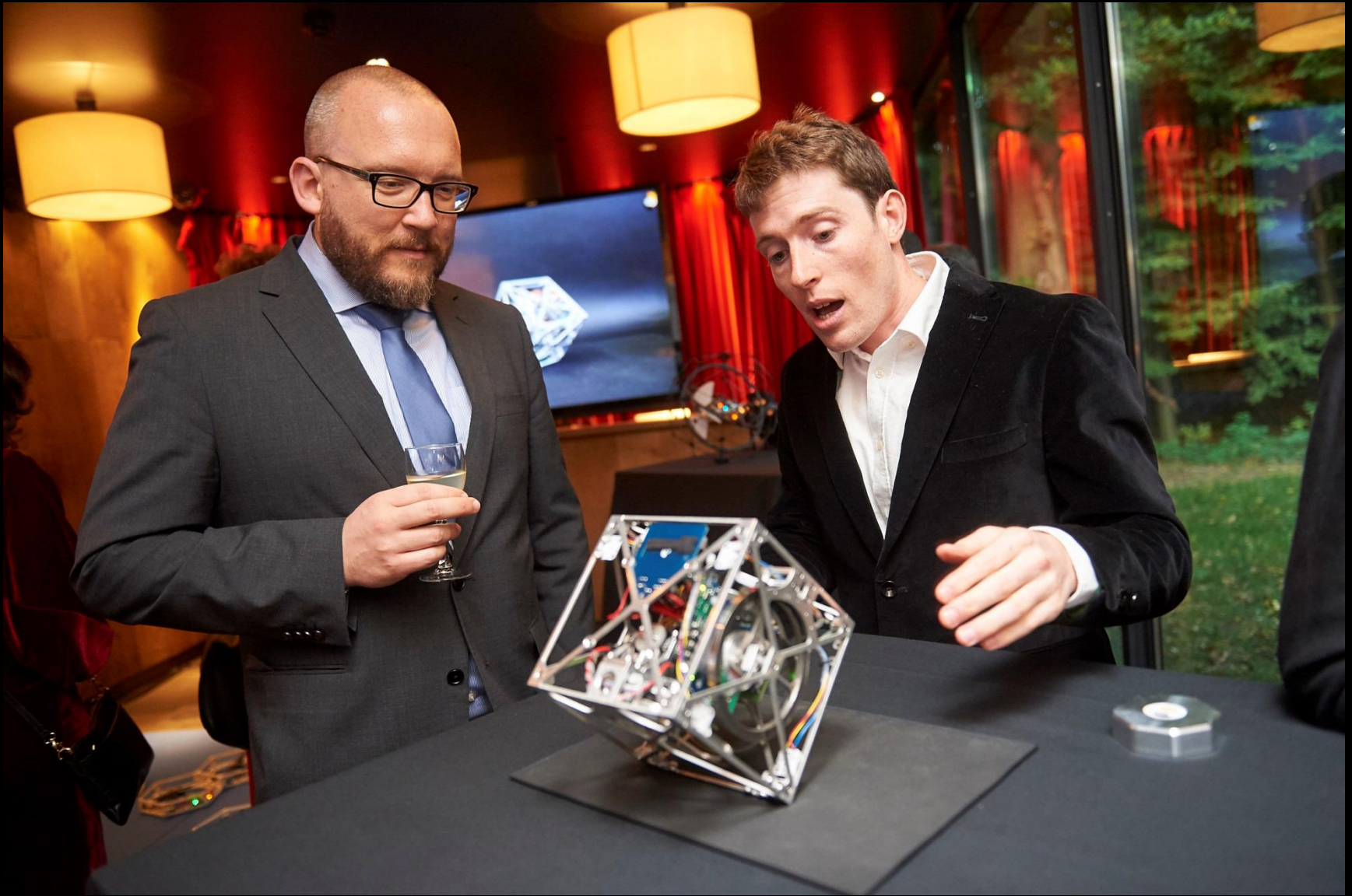
The Soirée suisse was also sponsored by the two Swiss Federal Institute of Technology ETHZ and EPFL. They showed with their robots the importance of innovation and research in Switzerland.