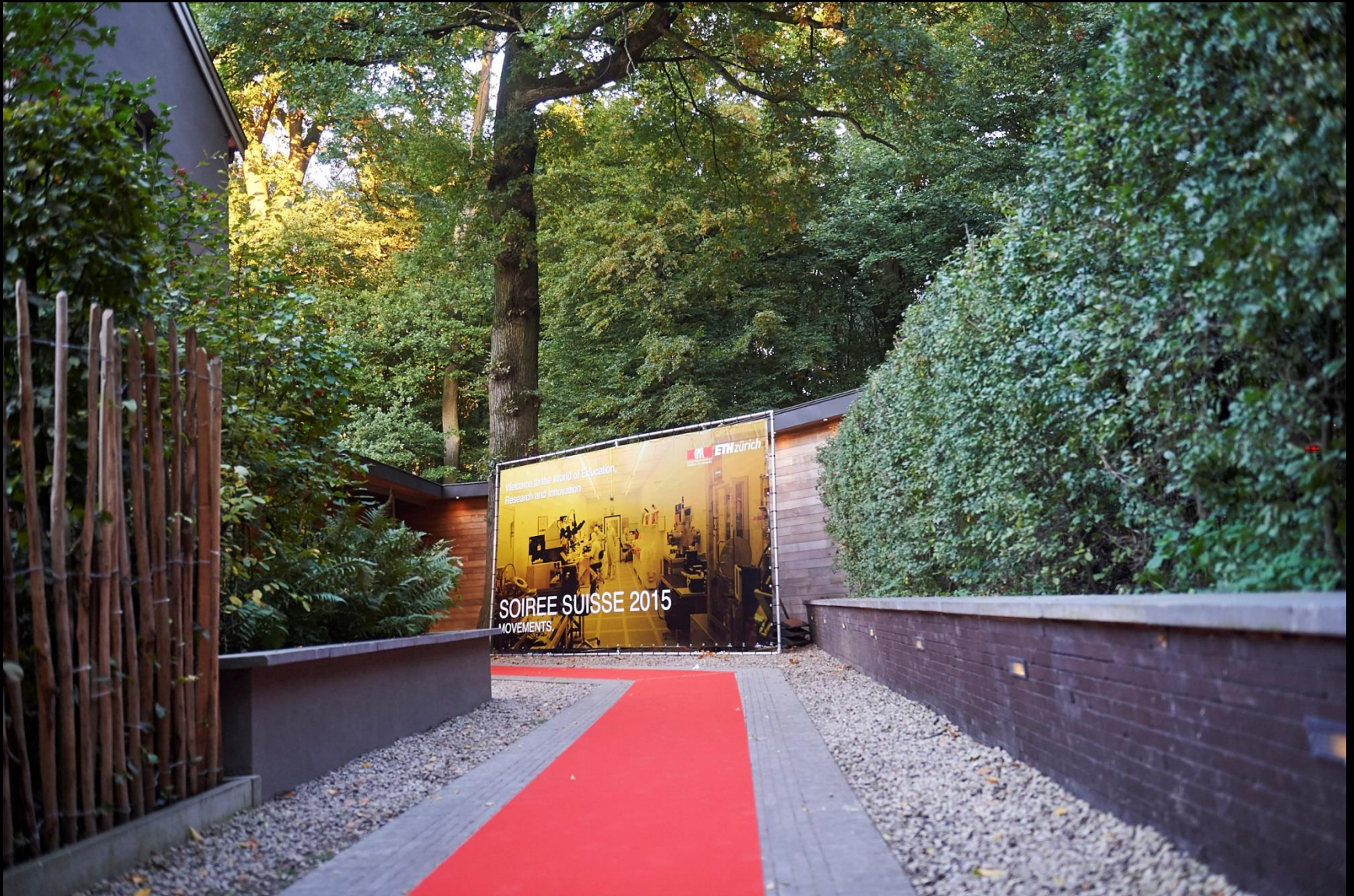
Soirée Suisse at the Jeux d'hiver in Brussels