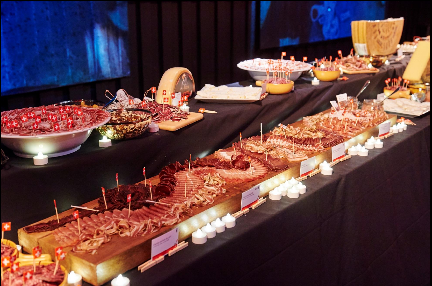
At this gastronomic evening, the guests could taste various Swiss specialities