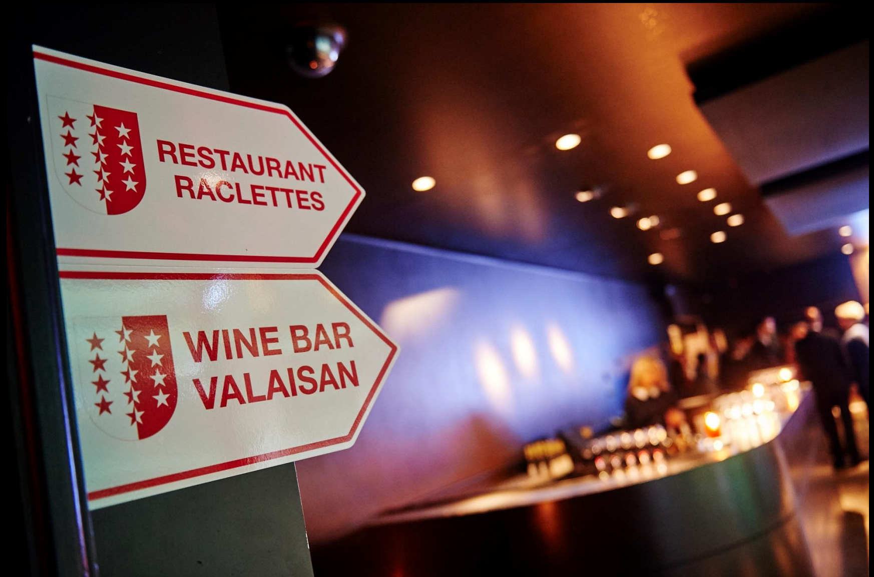
The Canton du Valais sponsored a wide range of traditional food and wine produced locally in the Canton du Valais