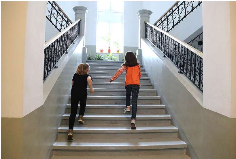
Renovating the energy systems of four schools in Brasov and Cluj-Napoca lowered both CO 2 emissions and costs for the city.

Switzerland actively engaged in promoting a sustainable energy, transport and environmental policy in Romania. To this end it supported Romanian towns and cities in developing and implementing sustainable energy strategies.