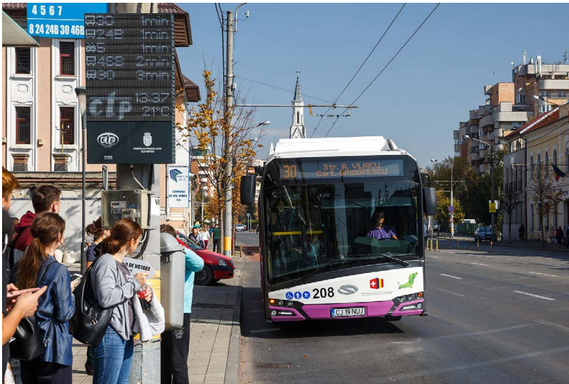
Romania's first 11 battery-operated buses in Cluj-Napoca, powered via new charging stations.