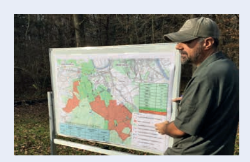
A representative of the Croatian demining organisation CROMAC points to parts of the Croatian municipality of Petrinja where large swathes of land have not yet been demined.

Croatia's environmental protection efforts will be supported by SECO. Various projects are in development to improve drinking water supply and collect and treat waste water in north-western Croatia. As well as improving local people's quality of life, the projects aim to improve the region's appeal and create jobs to give the local economy a lasting boost.