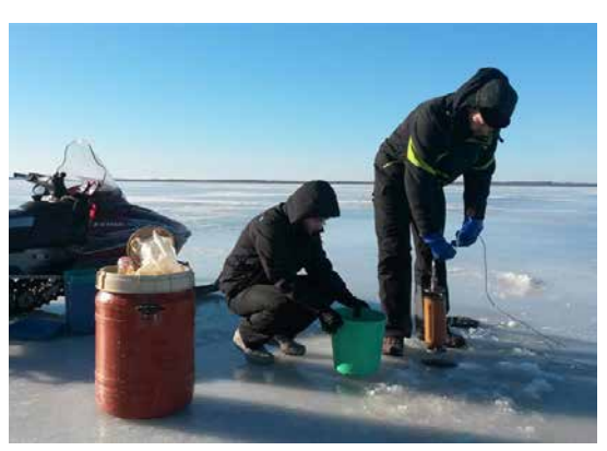
Thanks to Switzerland's support, Estonia can now rely on comprehensive, reliable environmental data on water and air quality, radioactivity and natural hazards. Estonian experts taking measurements on Lake Võrtsjärv.