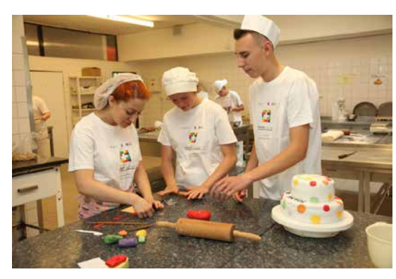
Courses at the VET school for food processing and hotel services in Bratislava are a good foundation for apprentices entering the Slovakian job market.

Switzerland is supporting a project to help Slovakia improve dual vocational education and training. To ensure the vocational education they offer is practice-based and market-oriented, vocational schools are increasingly gearing their courses to the needs of employers. Pupils receive training in a company in addition to theoretical knowledge. This equips them with better qualifications and improves their job prospects.