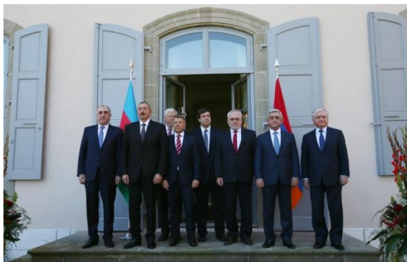
Presidential meeting in Geneva

On 16 November, the presidents of Azerbaijan and Armenia met in Geneva to discuss the peaceful settlement of the Nagorno-Karabakh conflict. In a joint statement, both parties and the three Co-Chairs of the OSCE Minsk Group stated that the meeting took place in a constructive atmosphere and that the two presidents agreed to take measures to intensify the negotiation process and to take additional steps to reduce tensions along the line of contact.