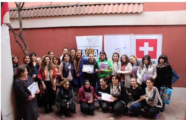
Participants of the training with their diplomas

The Embassy funded a two-day financial education training for women who found refuge at the “Clear World” women’s shelter in Baku.