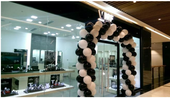
New store of VMF at 'Ganja Mall'

In November 2017, President Ilham Aliyev has officially opened a new shopping mall in Ganja city, west-northern part of the country. 'Ganja Mall' is located in the heart of the city and its infrastructure is totally changed and modernized in a fashionable way. It was the first mall established in Ganja city.