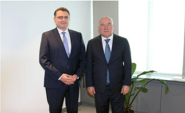
Swiss National Bank Chairman, Thomas Jordan with the Chairman of Central Bank of Azerbaijan, Elman Rustamov

From 13 to 14 July 2017, a high-ranking delegation of the Swiss National Bank (SNB), led by the Chairman of the Governing Board, Thomas Jordan, visited Baku on an official mission. The SNB delegation met with the Chairman of the Central Bank of Azerbaijan (CBA), Elman Rustamov, Finance Minister, Samir Sharifov, the Chairman of the Financial Market Supervision Authority, Rufat Aslanli and the President of the State Oil Fund (SOFAZ), Shahmar Movsumov. The meetings focused on recent economic developments in Switzerland and Azerbaijan as well as on bilateral and international cooperation. At the CBA, SNB Chairman Jordan also held a presentation on “The Swiss National Bank’s monetary policy in the current context”. In his presentation, he spoke about the