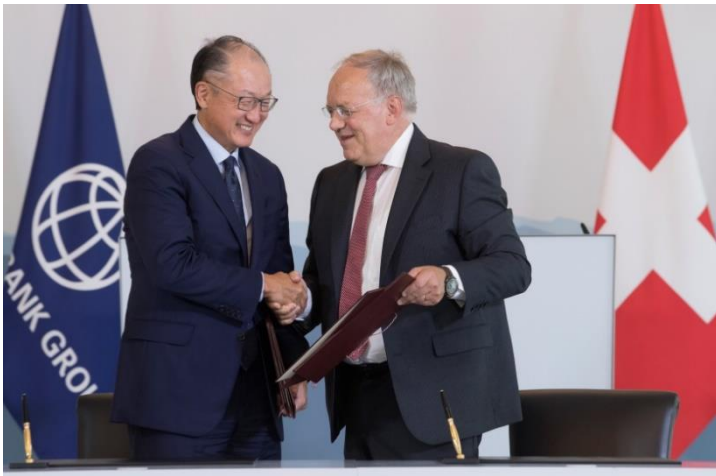
President of WB Jim Yong Kim and Swiss Federal Councillor Johan Schneider-Amman

This year marks the 25 th anniversary of the fruitful partnership between Switzerland and the Bretton Woods institutions (World Bank and International Monetary Fund). Federal Councillor Johann N. Schneider-Amman and World Bank President Jim Yong Kim met for a conference on this occasion in Bern in August 2017. The anniversary conference discussed the Bank's successes and challenges for the past 25 years and explored future avenues to the World Bank's contribution towards contributing to the UN Sustainable Development Goals and reducing poverty worldwide.