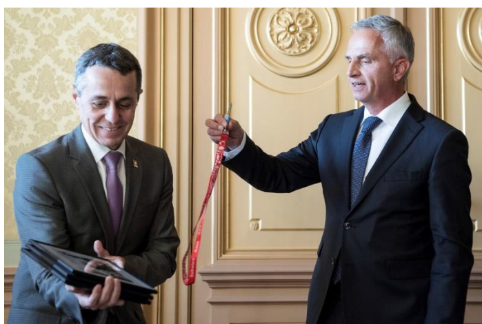
New Swiss Minister of Foreign Affairs, Federal Councilor Ignazio Cassis, receives the keys from his predecessor, Federal Councilor Didier Burkhalter

Le 1er novembre 2017, le Tessinois Ignazio Cassis, conseiller fédéral nouvellement élu, a été accueilli par les six autres membres du Conseil fédéral et a reçu les clés du Département fédéral des affaires étrangères de son prédécesseur Didier Burkhalter. Pour sa première visite, le chef du DFAE s'est rendu à Rome et a ainsi rompu avec la tradition qui veut qu'un nouveau conseiller fédéral se rende en Autriche pour son premier voyage à l'étranger. Le PLR tessinois a décidé de tirer un bilan de son activité de conseiller fédéral après 100 jours, durant lesquels il va étudier les nombreux dossiers qui doivent être traités, notamment sur le développement des relations bilatérales avec l'UE.