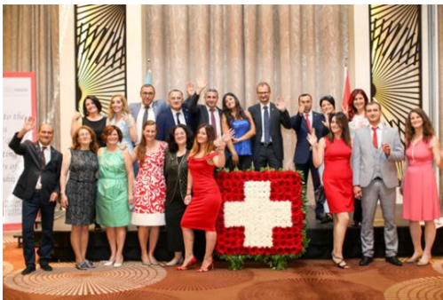
The team of the Embassy celebrating Swiss National Day