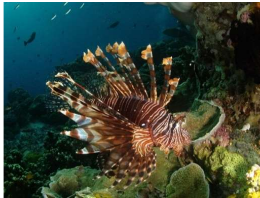
Underwater marine life in Wakatobi

Switzerland has a long history in supporting tourism development. Between 2009 and 2018, WISATA programme supported local governments, tourism businesses and communities in four tourist destinations to better promote and manage their destinations, as well as to ensure that local communities benefited from the tourism development in their areas. With a long history of Swiss expertise supporting regional tourism development, the Sustainable Tourism Development in Indonesia (STDI) programme was initiated with the goal of boosting the competitiveness and sustainability of Indonesian tourism destinations, as well as strengthening the tourism workforce in Indonesia.