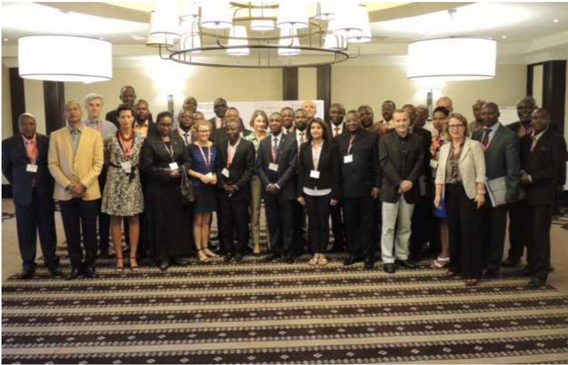
Group photo with the Governor of the province of Katanga and participants from the March 2014 workshop