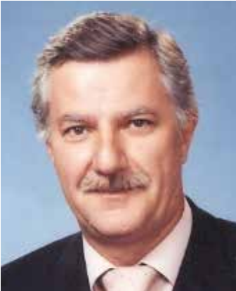
Jacques F. Gremaud, Ambassador of Switzerland in the Democratic Republic of the Congo

It was a privilege for the Embassy of Switzerland to work alongside Congolese key stakeholders in the mining sector for much of 2014 in order to find answers to the problems of extreme poverty amongst the people living in mineral rich areas of the Democratic Republic of the Congo.