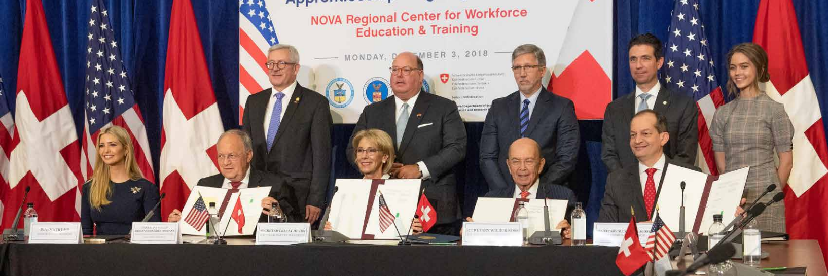
U.S. Secretary of Labor Alexander Acosta, U.S. Secretary of Commerce Wilbur Ross, U.S. Secretary of Education Betsy DeVos, then Swiss Federal Councillor Johann N. Schneider-Ammann, and Advisor to the President Ivanka Trump (front row, from right to left) at the Memorandum of Understanding signing ceremony.