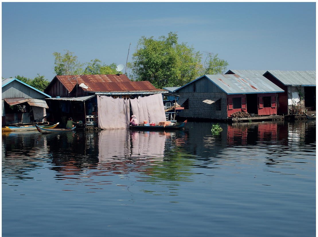
Floating houses, Cambodia.

In the literature, it is widely acknowledged that climate change does affect women and men differently and that they have different coping capabilities with the effects of climate change – the impact of climate change is not gender-neutral. On the