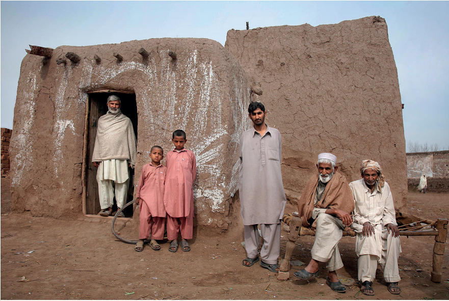
Four generations in Swabi, Pakistan.