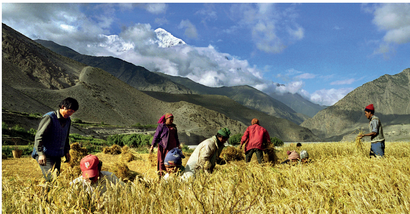
Harvest in Kagbeni, Nepal.

and this often threatens their breadwinner role, contributing to increased stress, violence and male migration in search for other income opportunities (ICFG/SDC 2013). On the other hand, coping and adaptive capabilities to respond to the effects of climate change are also influenced by gender inequalities in land rights and gendered social roles and they hinder women from responding effectively to climate risks - even when several studies have shown that women have very effective strategies for responding to climate change. It is therefore important that responses to climate change take these inequalities into account and that women not be addressed as passive actors, but as potential agents for change (Action Aid 2010: 26; Aguilar 2014; IFAD 2014: 7; Sieber 2014; UNDP 2012: 2).