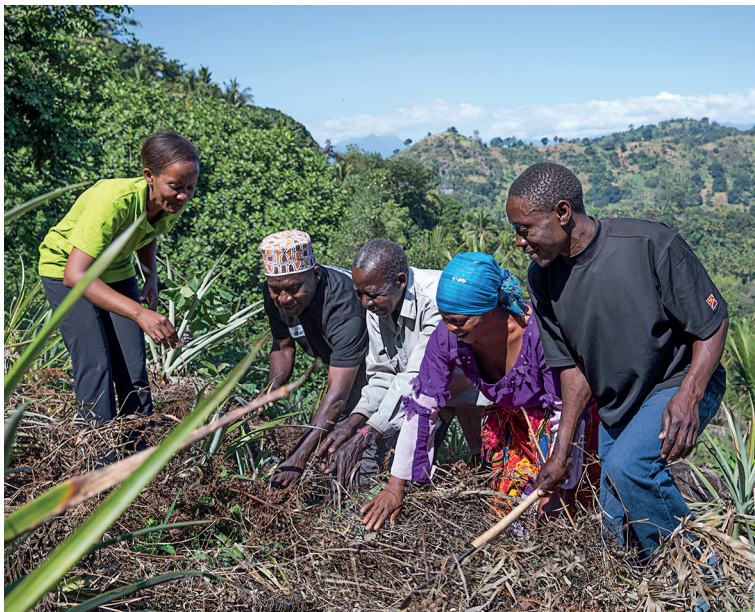
Training in agricultural technics, Tansania.