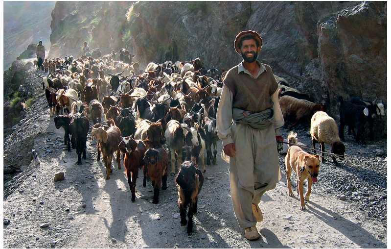
Shepherd with goat caravan, Pakistan.