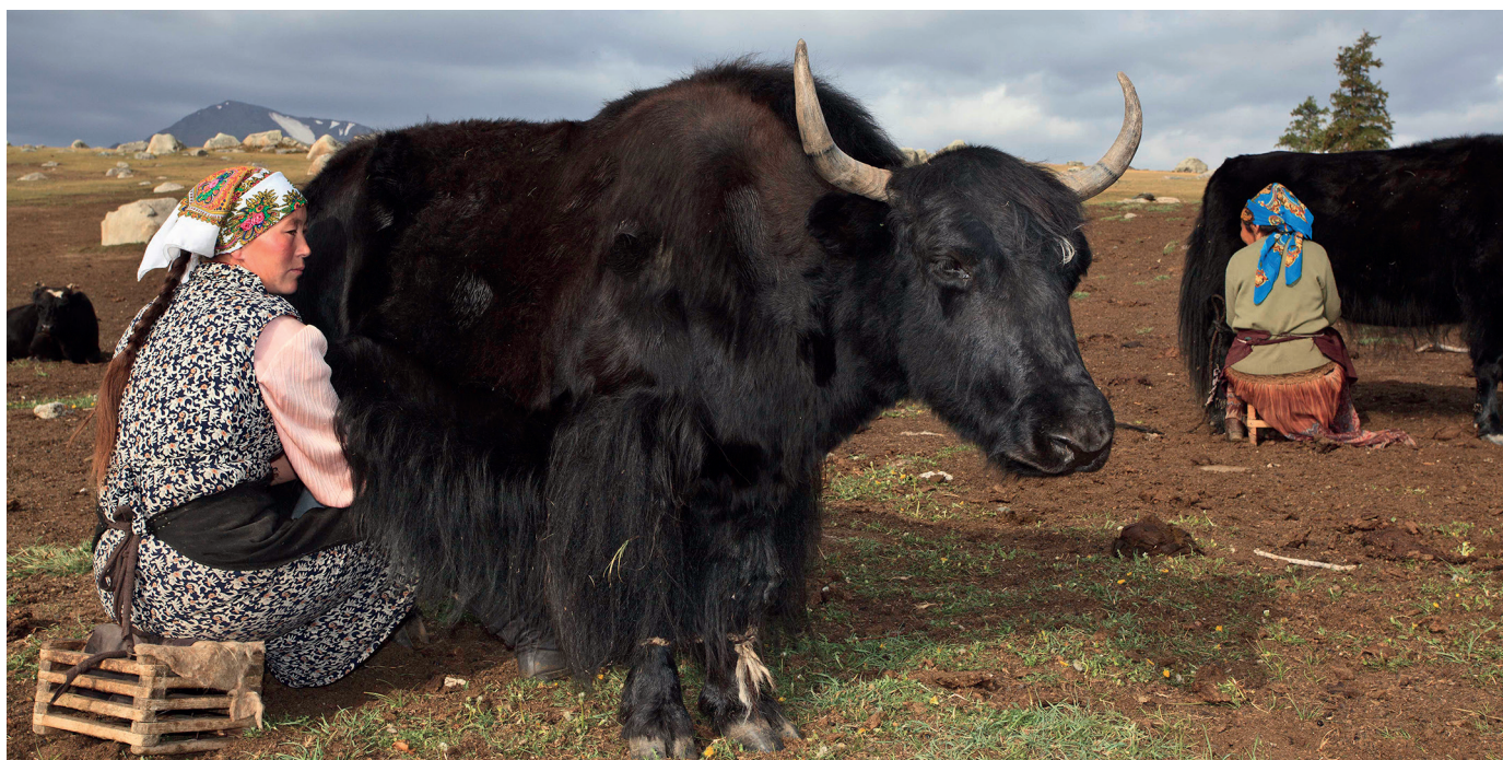
Women milking yak, Mongolia.

gender inequalities and empowering women and men with equal rights to land. Now, in the process of elaborating sustainable development goals in the post-2015 development framework, women's activists, NGOs, international organisations and governments such as Switzerland support the inclusion of a twin track gender approach: A stand-alone goal on gender equality, women's and girls' empowerment and women's human rights, as well as the transversal integration of gender equality in all other goals. Equal rights to land are an important target under the stand-alone goal and are also integrated in a number of other goals (OECD 2013; Swiss Position on a Framework for Sustainable Development Post-2015 2014: 19; UN Women 2013).