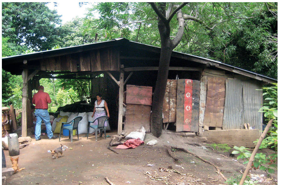
Farmer's house, Nicaragua.