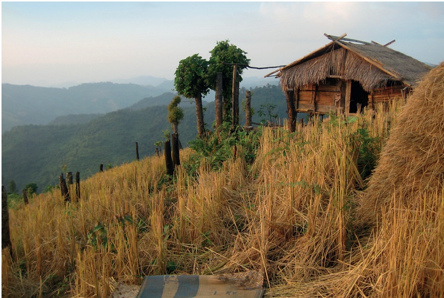
Landscape of northern Laos.