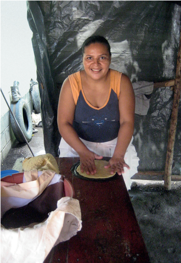
Woman preparing food, Nicaragua.

to achieve equitable and sustainable food security and development. For other regions of the world, there are similar legal and policy instruments, such as for example the consensus documents adopted at the Regional Conference on Women in Latin America and the Caribbean (Action Aid 2010: 13-15; OHCHR/UN Women 2013: 11-13).